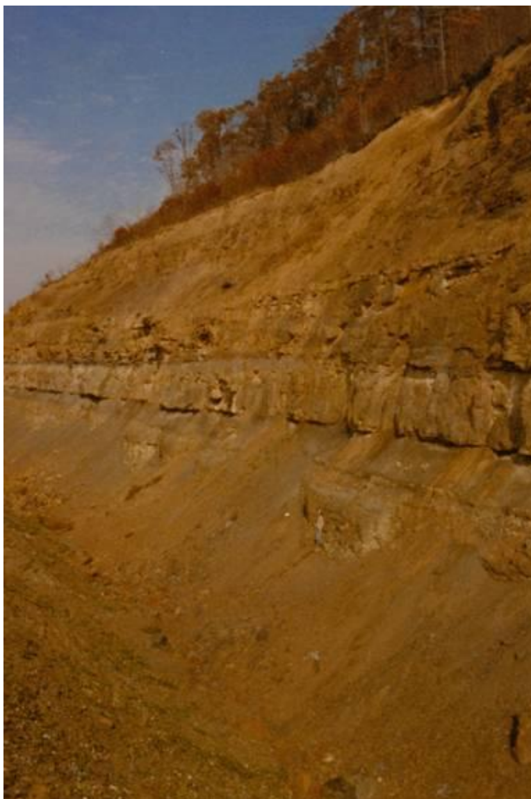
PRE-RECLAMATION (Note the person in the photo)