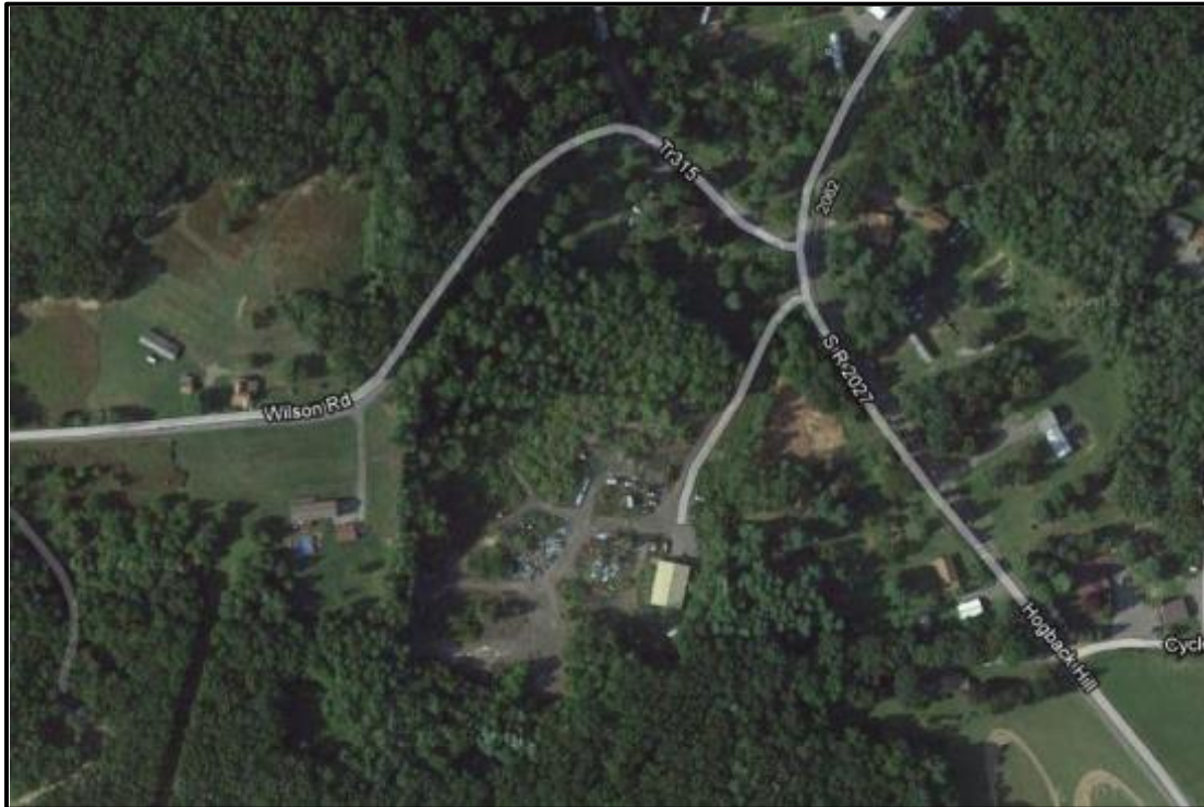
Site "A" Aerial Photo