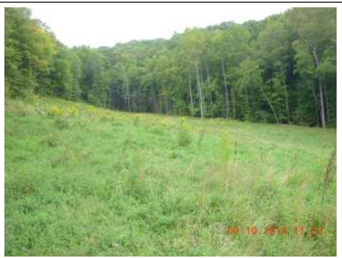
View of the grading area and Swale No. 1, above Berndale.