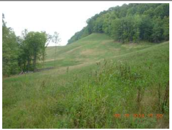
View of the main grading area and Coal Refuse Pile No. 2.