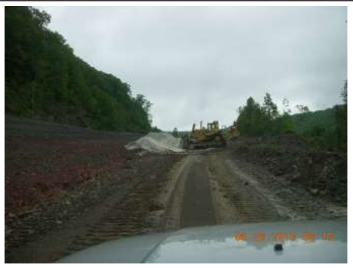
Removal of coal refuse from Coal Refuse Pile No. 2.