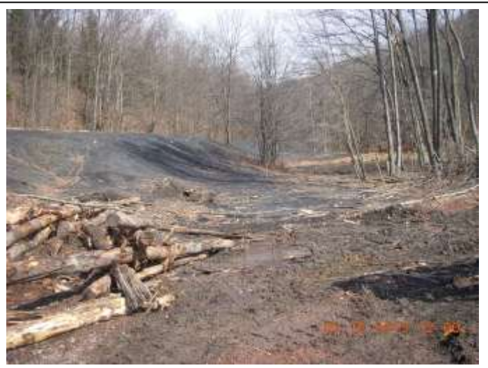
The highwall and pit floor.