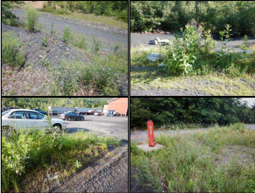
Figure 4: Milkweed on AML sites – Eckley/Delano/Mahanoy City/Centralia

propagated by both seed and rhizome cuttings. Seeds and plants are available from many nurseries. It is very recognizable - the plants can be recognized at highway speeds by their distinct form. Seeds can be harvested easily by hand in the fall.