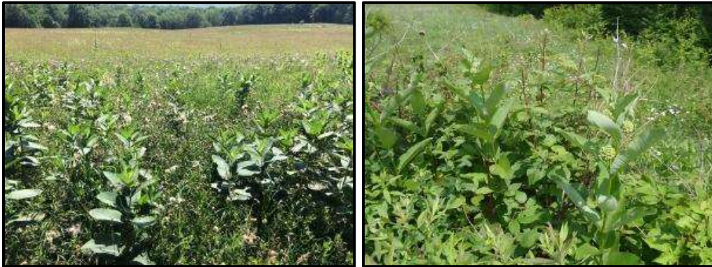
Figure 8: Milkweed at Newtown South