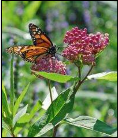
Figure 2: Common Milkweed addition, a whole host of insects like beetles, spiders, lady bugs and lacewing use milkweed as their primary food source, or as a major food source.

Common Milkweed ( Asclepias syriaca ) is an important plant because so many species of insects depend on it. Monarch Butterfly larvae, Milkweed Tiger Moth larvae, Milkweed Bugs, and Milkweed Leaf Beetles only eat milkweed, and cannot survive without it. Milkweed nectar contains high amounts of glucose and is sought out by hummingbirds and nectar-eating insects such as bees, butterflies, moths, and beetles. Common Milkweed not only acts as a host plant for Monarchs, but also services up to 75 native pollinator species when in bloom. It's a favorite of bumble bees, honey bees, ants and wasps. In