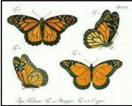
Figure 1: Monarch Butterfly

William of William & Mary), who was also known as Prince William of Orange, Stadtholder of Holland. It is the State Insect of Illinois, West Virginia, Minnesota Idaho, Vermont, Alabama and Texas.