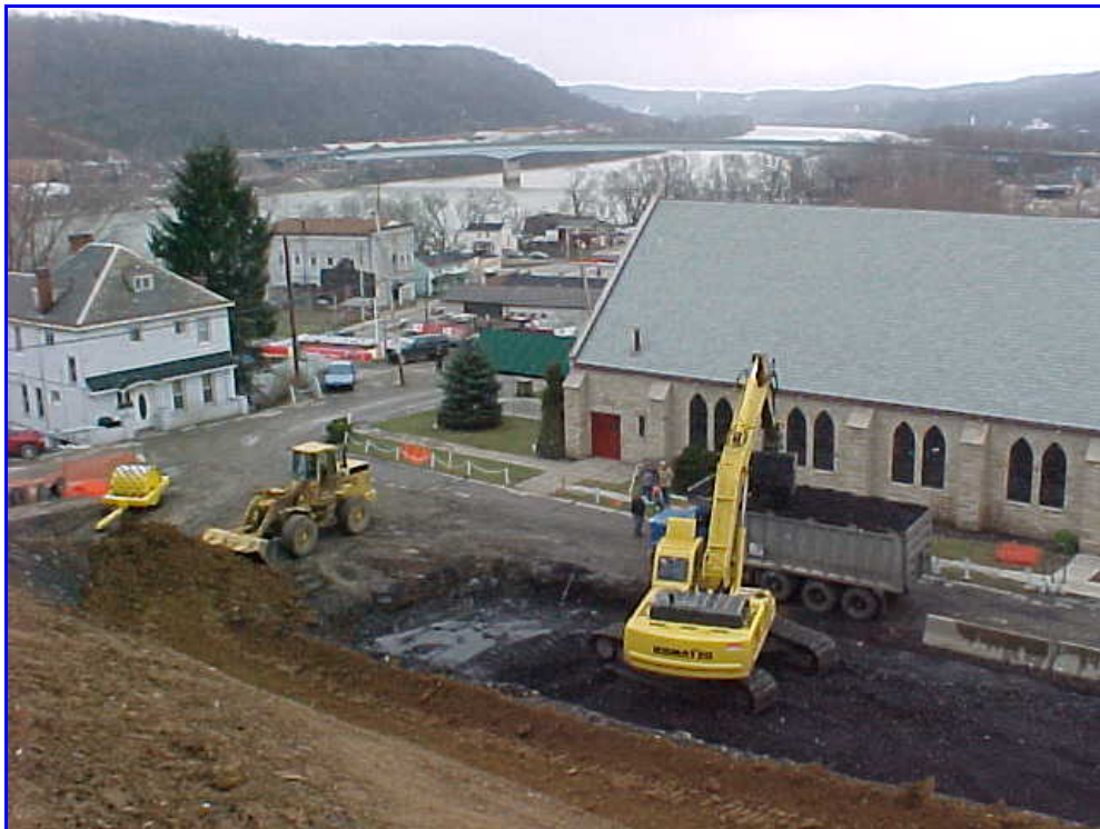
Figure 6. Incidental coal extraction during project construction.