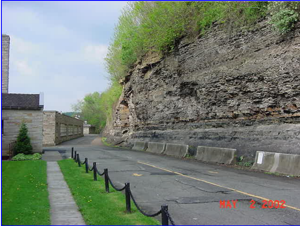
Figure 2. Dangerous highwall looking west with the church, school and parish house visible on left.