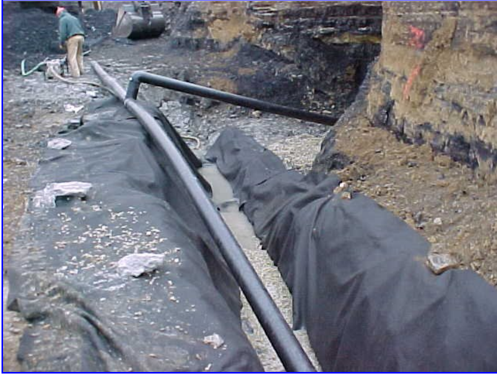
Figure 8. Mine drain being constructed near the base of the finished cut slope.

The micropiles were not included in the original project design, and the cost to install the micropiles was approximately $104,000. In addition, a five-foot high security fence was installed along the top of the entire length of the finished cut slope. Figure 9 shows the retaining wall under construction, and Figure 10 shows the finished retaining wall and rock face support system near the west end of project site.