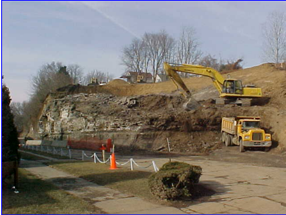
Figure 4. Initiation of the excavation work to reduce the slope of the highwall.

By cutting back the hillside to eliminate the vertical highwall, a block of Pittsburgh Coal was uncovered. Approximately 1,956 tons of coal were removed from the project site and sold. Figure 6 shows the coal removal operation during project construction. During excavation of the final cut slope, a number of underground mine workings were intercepted resulting in four standing mine openings at the base of the final slope. The design called for pneumatic stowing of the opening to block access followed by horizontal drilling of the exposed coal seam face with injection of a cement grout to stabilize the old mine workings and prevent future problems due to mine subsidence. However, before all of the openings were stowed and grouted, one of the larger openings in the middle of the project area collapsed. This necessitated a design change to construct a small retaining wall and to grout the strata above the opening. The cost of the remedial work to stabilize the collapsed area was about $44,000.