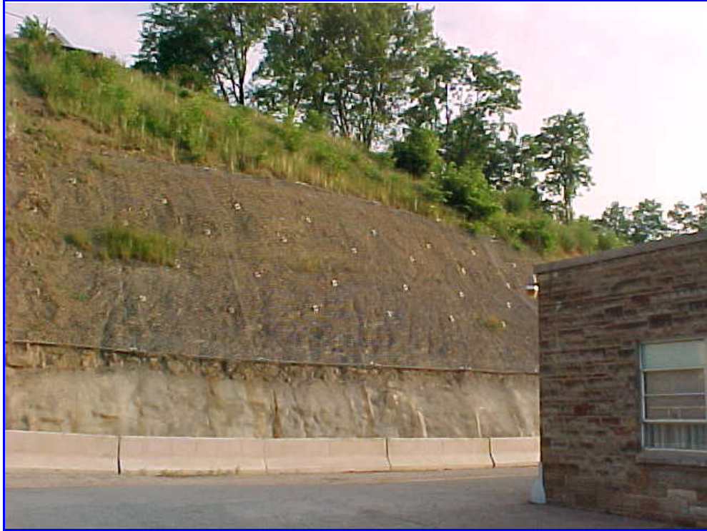
Figure 5. Finished cut slope with rock face support system adjacent to the school building.