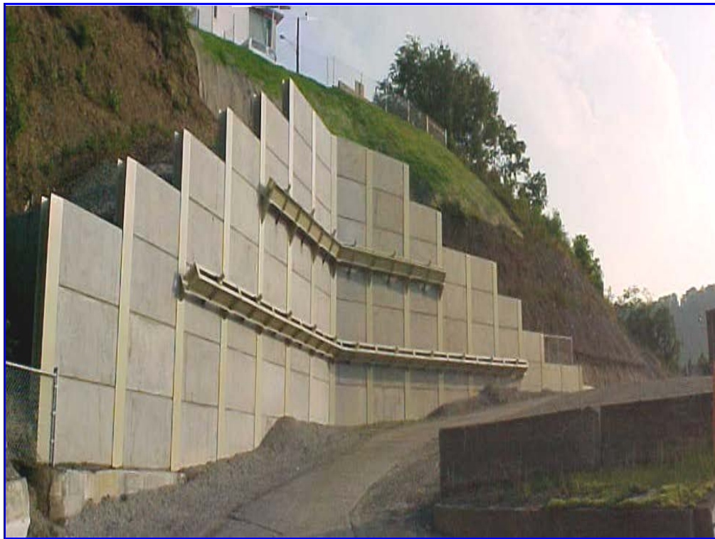
Figure 10. Completed retaining wall at west end of project site - the school is just visible on the right edge of photograph.