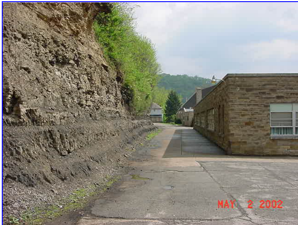
Figure 3. Dangerous highwall looking east with the school and church on right.