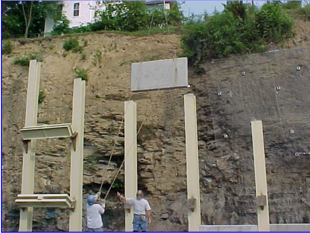
Figure 9. Soldier pile and lagging retaining wall under construction.