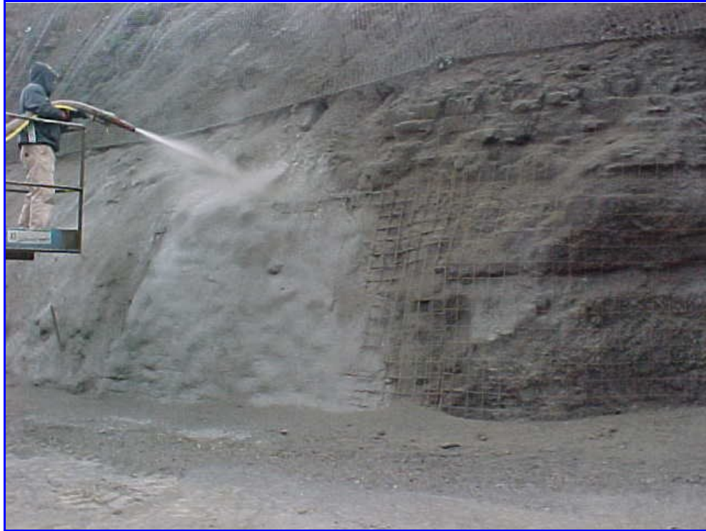
Figure 7. Fiberglass-reinforced grout being applied to the coal seam face.

In order to effectively route stormwater runoff from the project site, a new storm drain had to be installed and tied to the municipal stormwater system located along Park Avenue. The existing municipal system was undersized and in a state of disrepair, so the PA-DEP partnered with the City of Monongahela to upgrade the facilities along Park Avenue. A new culvert had to be installed under Park Avenue to effectively route the water to Pigeon Creek, and the PA-DEP contractor, Alex E. Paris Contracting, Inc, performed this work. A small volume of mine water also drained from the mine entries located at the base of the final cut slope, and a mine drainage collection and conveyance system had to be constructed to route this water away from the finished church parking area. Figure 8 shows the mine drain being constructed near the base of the finished cut slope.