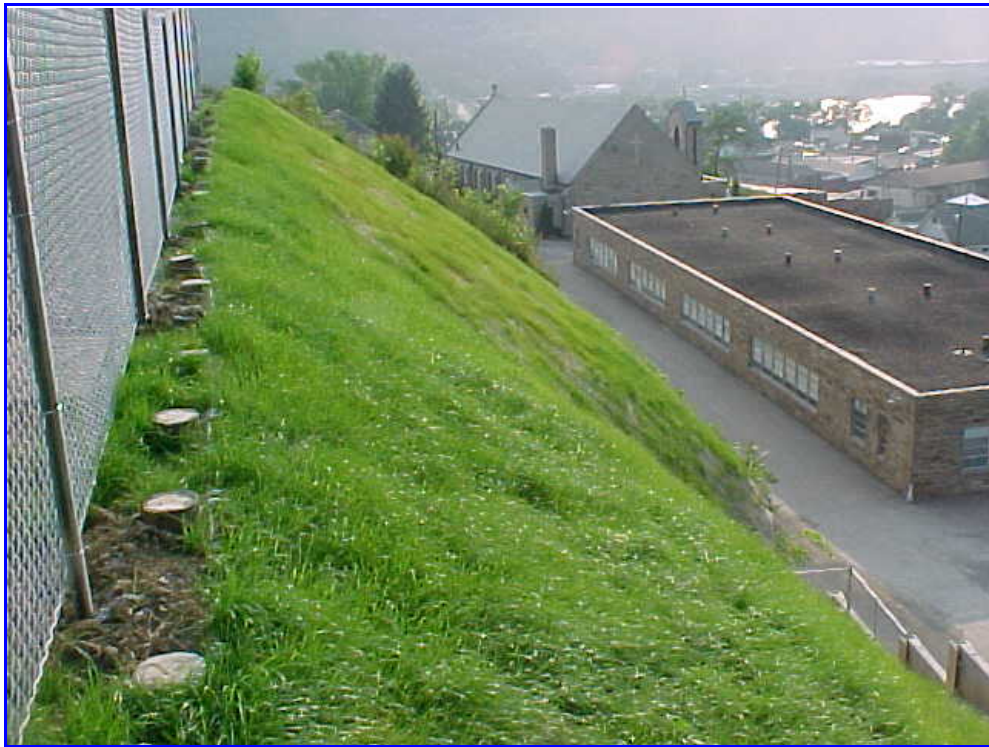
Figure 11. Reclaimed site from above with the school and church in background.

The Monongahela South No. 1 project eliminated an 800-foot long dangerous highwall that presented a severe health and safety hazard for the members of St. Anthony's Roman Catholic Church in Monongahela. The highwall averaged 40 feet high and, due to weathering of the exposed highwall face, was extremely unstable. The highwall also posed a hazard to persons living in residential properties and walking the city streets that were located immediately above the top of the highwall. The project was designed by GAI Consultants, Inc. and constructed by Alex E. Paris Contracting, Inc. The final project cost was $1,457,925.57. Because of the many buildings and roads in the immediate proximity of the highwall, reclamation options were limited. The ultimate reclamation plan incorporated the needs and interests of many people and groups, and the completed project showcases the kind of exemplary reclamation that can be accomplished by the AML Program.