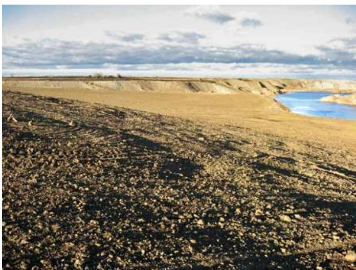
2012 will mark the completion of 14 reclamation projects at the Columbus Mine. These projects were conducted to backfill nearly nine miles of dangerous highwalls and level and revegetate about 700 acres

Surface mining began at this site as early as 1902, shortly after the city of Columbus was settled. Several small "wagon mines" provided lignite coal to area residents between 1900 and 1920 for a dollar a ton or less. Beginning around 1918 larger strip mines began to operate and by 1923, the Truax Brothers Kincaid Mine was producing over 100,000 tons of coal per year. This mine fueled a Montana-Dakota Utilities power plant and shipped coal across the state.