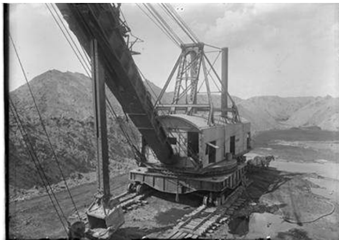
Surface mining began near Columbus, ND, around 1902. By 1923 the, Truax Coal Company's Kincaid (Columbus) Mine was producing over 100,000 tons of coal per year. Truax-Traer Coal Company and Consolidation Coal Company operated this mine until 1968, producing more than 12 million tons of lignite coal.

Benefits of coal mining near Columbus included relatively cheap fuel and electricity, employment and infrastructure. Its detrimental impacts included vast acreages of barren and unstable spoil piles, hazardous water bodies, equipment and facilities, and dangerous highwalls.