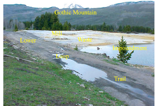
View of Lower Loop Trail as it Traverses Peanut Mine Site Prior to Reclamation.