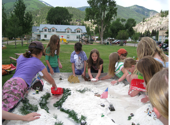
School children learn and play with a “watershed trailer” sponsored by the Lake Fork Watershed Stakeholders in Lake City, Co.

WHWT volunteers live in these rural mining communities, working with the local population and the local volunteers dedicated