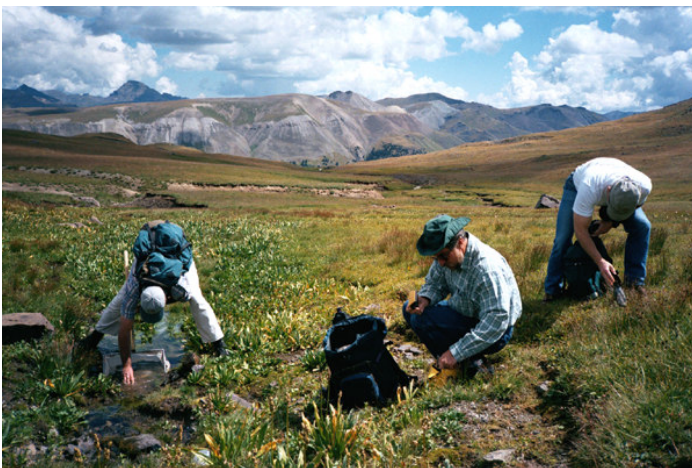
Volunteers monitoring water in 303d-listed Palmetto Gulch, which flows into the Lake Fork of the Gunnison and is monitored regularly by the Lake Fork Watershed Stakeholders, who were recently awarded the EPA’s 2008 Environmental Achievement Award for Region 8.

OSM/VISTAs have a long history of success with the communities in which they live and work, and this year (Oct. 2007-Sept. 2008) have generated 1145 hours of community volunteer service, $74,361 in grants and other cash resources, and $148,097 in documented in-kind donations— resources directly benefiting the organization and the community in which they work.