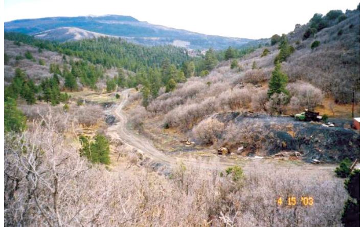
Franks Mine site before construction. (note the degraded, incised stream at center left of photo)