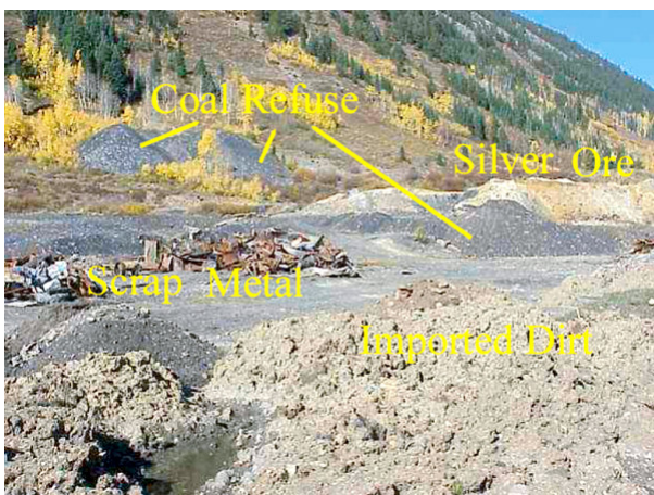
West Side Peanut Mine Prior to Reclamation.

By any measure, reclamation was a success at the Peanut Mine. The citizens of Crested Butte are now more aware of the hazards caused by past mining practices, and have become aware of how abandoned mines can be restored to beneficial use. This once neglected eyesore is now an enjoyable open space.