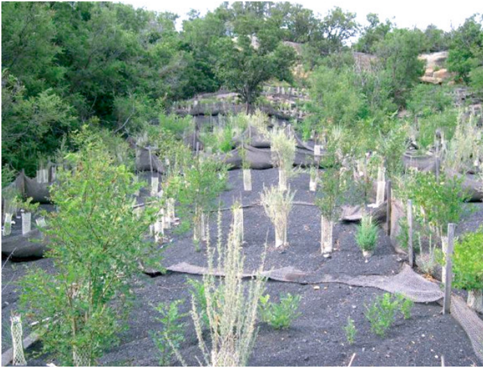
Native seedlings in the second season of growth in sandy gob at the Sunset Mine. (note root sprouting of New Mexico locust in the foreground)

of 1200 feet of an ephemeral stream, relocation of a road, incorporation of amendments, planting of native seedlings and hydroseeding with native species. The open coal adits, which were partially collapsed, showed no evidence of bat usage and were backfilled and marked with a permanent survey cap.