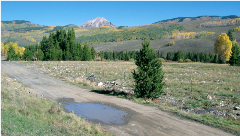
View of Lower Loop Trail as it Traverses Peanut Mine Site Less Than 2 Years Following Reclamation Construction.