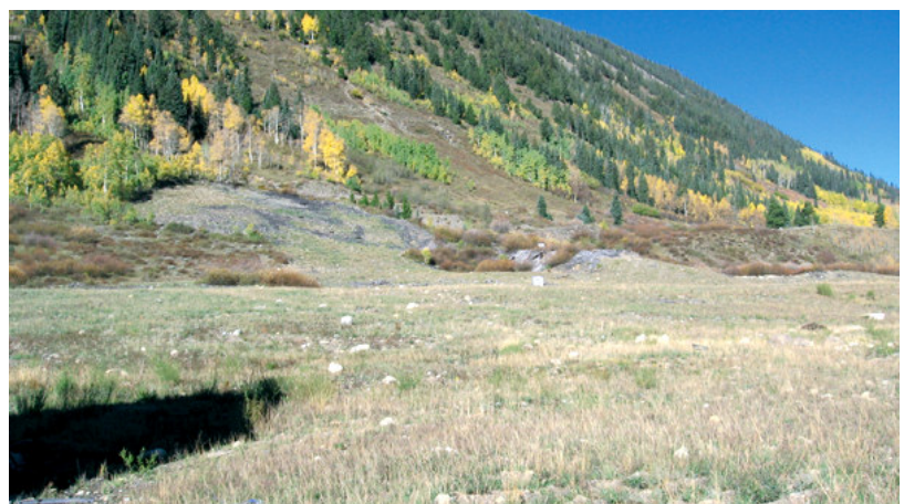
West Side Peanut Mine During Second Growing Season Post-Reclamation.