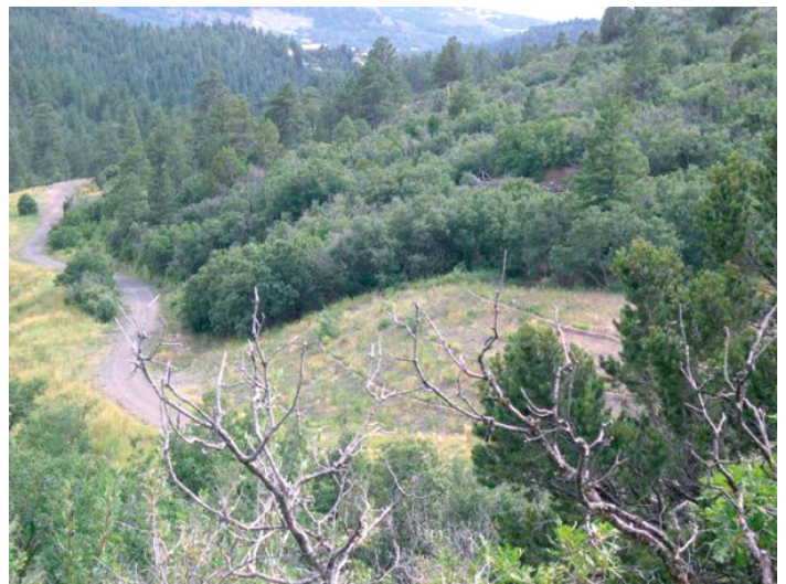
Franks Mine site following construction. (with relocated road and restored stream to extreme left of photo)

Partnering with the New Mexico State Land Office and private landowners, the New Mexico Abandoned Mine Land Program has shown that reclamation can be a successful cooperative endeavor that benefits not only the private landowner but also farmers and ranchers downstream, wildlife and the general public who visit the Land of Enchantment.