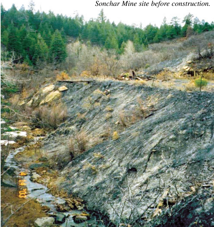
Sonchar Mine site before construction.

77% plant survival rate demonstrates. The project also demonstrates two innovative approaches to direct reclamation of coal mine waste piles in the Southwestern United States: the use of amendments, including a few inches of native soil, incorporated directly into the surface of the material and the use of specialized planting techniques suitable in very sandy, droughty gob material.