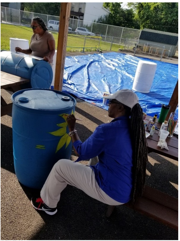
Painting rain barrels for a raincatchment system with Chesapeake Bay Foundation at Camp Curtin YMCA in Harrisburg, PA.