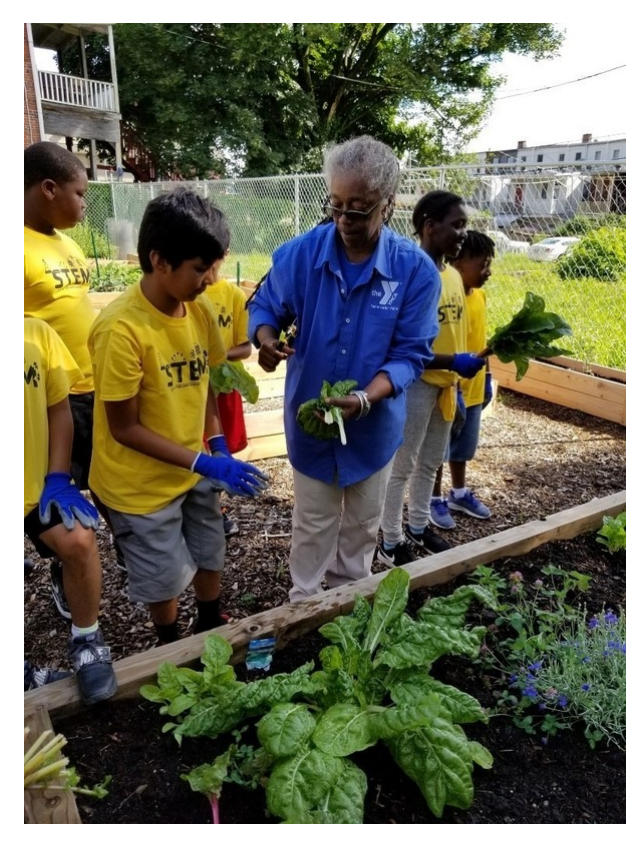
Planting vegetables in a raised garden bed at Camp Curtin YMCA in Harrisburg, PA.

Is there an EJ champion in your community? Does your community have a success story you would like to share? <u>Email us your story</u> for publication in the next Your Environment, Your Voice newsletter!