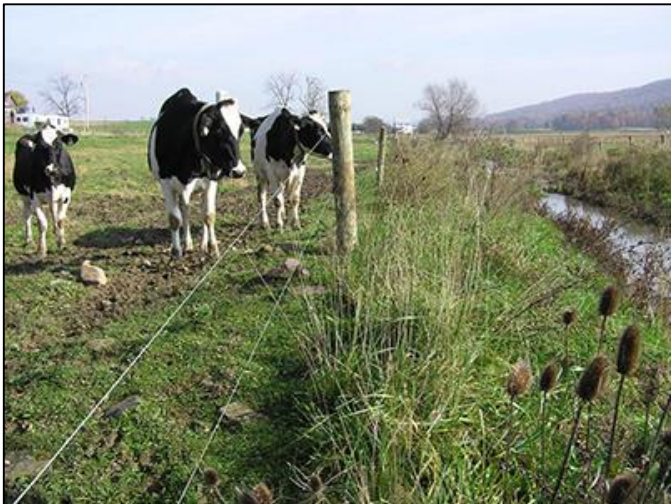
Streambank fencing agricultural practice