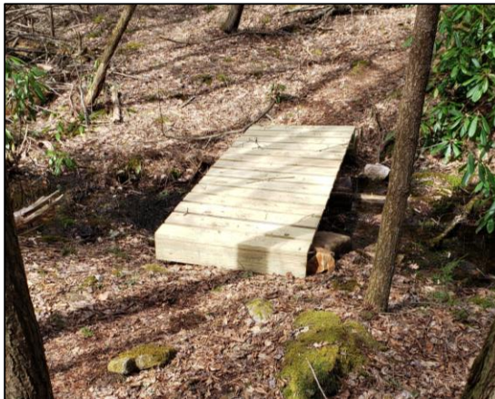
Low impact hiking trail crossing