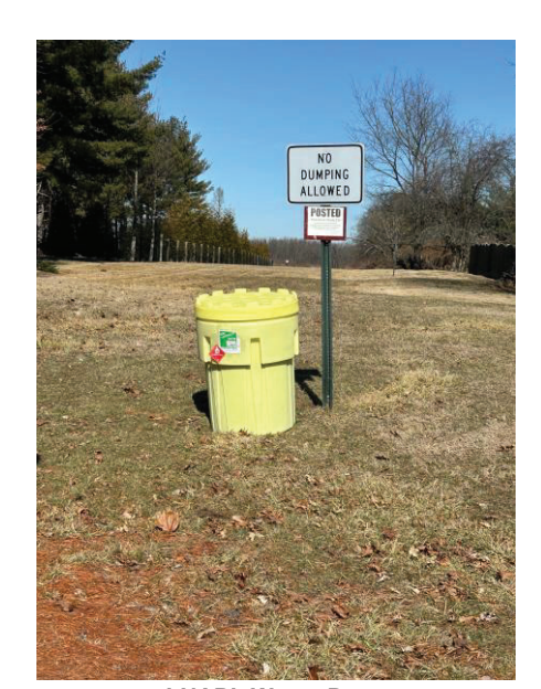
LNAPL Waste Drum 2-14-25 @ 11:32

Facility Name: Washington Crossing LNAPL______ Primary Facility ID: _____