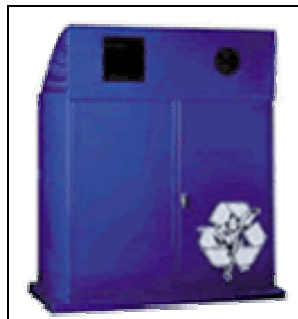
Figure 3 Multi-Material Recycling Container for Downtown Area