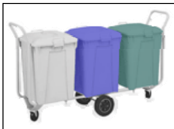
Figure A-1 Office Recycling and Waste Sorting Cart