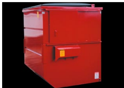
Figure A-2 Outdoor Recycling Container

likely to occur at food service establishments, such as restaurants and bars. Single-stream recyclers will accept storage of fibers and commingled materials in one container. If two-stream recyclers collect the materials, the recycling containers (one for fibers and one for mixed materials) should be visually distinct to avoid cross-contamination. By far, container service is the most cost-effective approach to collection; however, not all businesses can accommodate recycling containers in the alleys behind their establishments. In addition, a small number of businesses in the Borough may generate a sufficient volume to warrant larger roll-off containers (10 cubic yards and larger) with wheels. Figure A-2 depicts a typical outdoor recycling container collected by a front-end loader truck. Figure A-3 shows another recycling container, that is more likely to be placed in a downtown area or park-like setting.