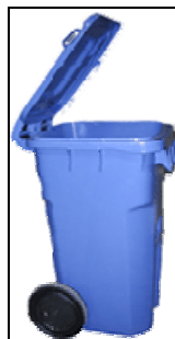
Figure A-4 Recycling Curb Cart