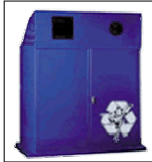
Figure 3 Multi-Material Recycling Container for Downtown Area