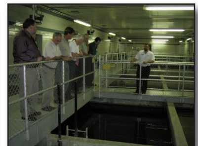
New membrane filtration Section

The North Wales Water Authority, along with the North Penn Water Authority, announced the completion of the Plant Expansion Project at the Forest Park Water Treatment Plant. The dedication ceremony and plant tour was held on Thursday, October 4th. In addition to the tour, there was a brief presentation that describes the treatment process and the nature of the expansion project.