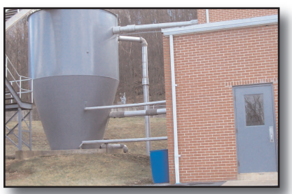
Spring Township Municipal Authority's upflow clarifier (left) and the chemical feed building (right).