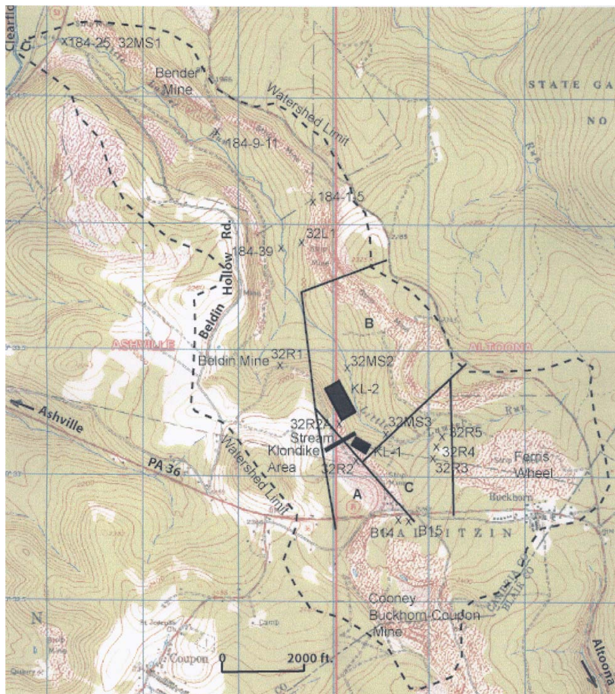
Figure 1. Map of Little Laurel Run watershed, sample points, properties and project area. Scale 1:24,000. Ashville and Altoona quadrangles. Properties: A: Hite, B: Blair Co., C: Cooney