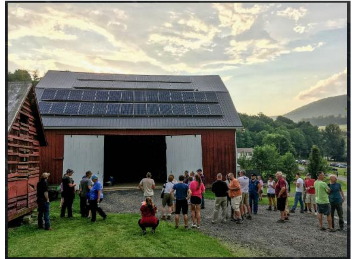
Solar panels on a farm in Lycoming County