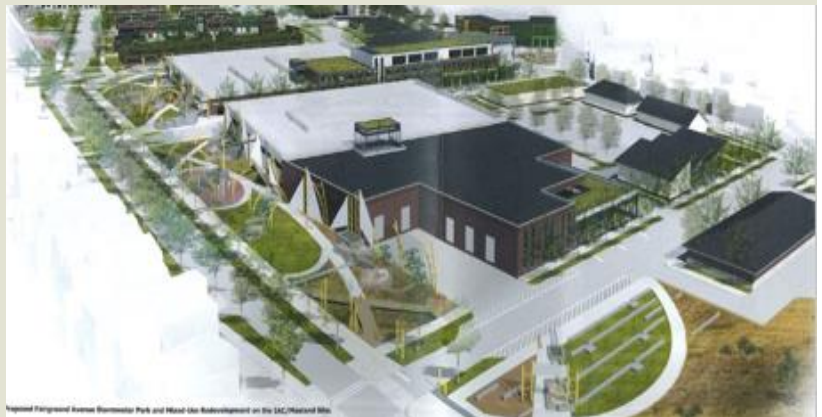
Approved Fairground Avenue Stormwater Park and Mixed-Use Redevelopment on the IAC/Masland Site