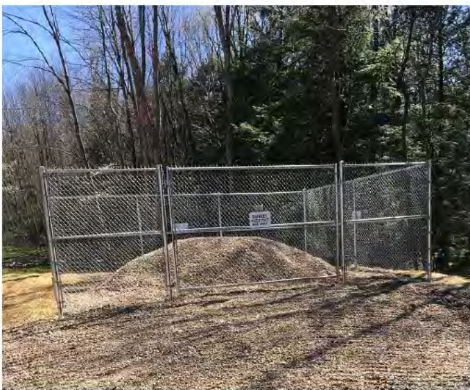
Fence installed around the filled shaft.