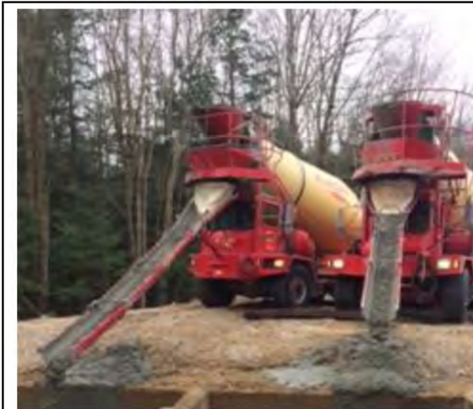
Grouting water infiltration area.