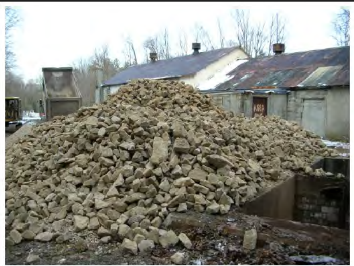
Rock fill dumped, to be pushed into the shaft by the excavator.