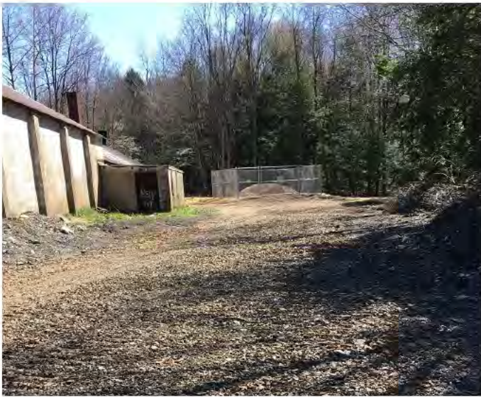
New aggregate entrance into the shaft.