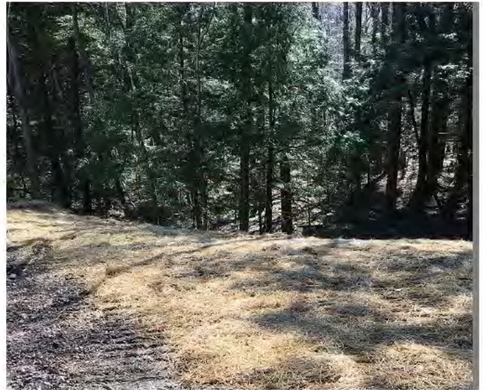
Seeded and mulched.