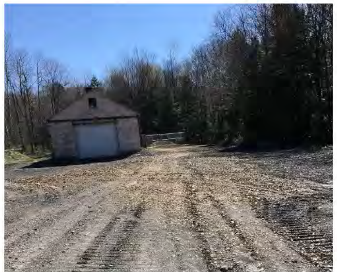
View from the entrance gate to the shaft.