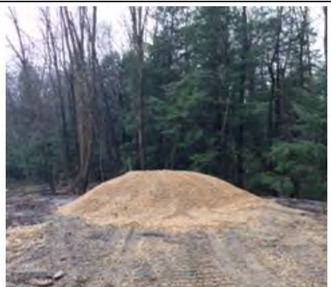
Shaft, completely filled.