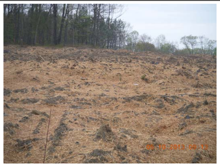
View of ARRI grading on Site B, looking west.