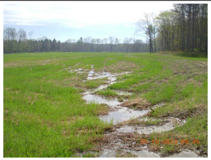
View of grass growing and water running along Site A, looking east.