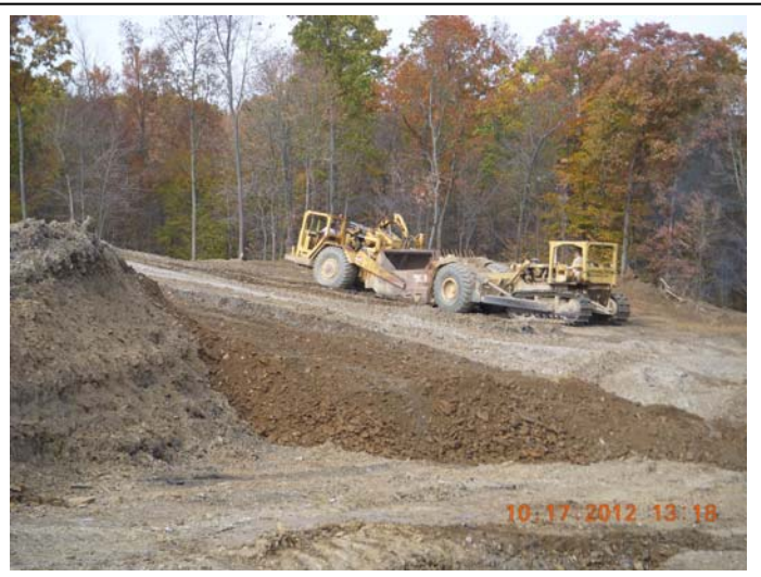
View of site grading looking along western dogleg on Site B.