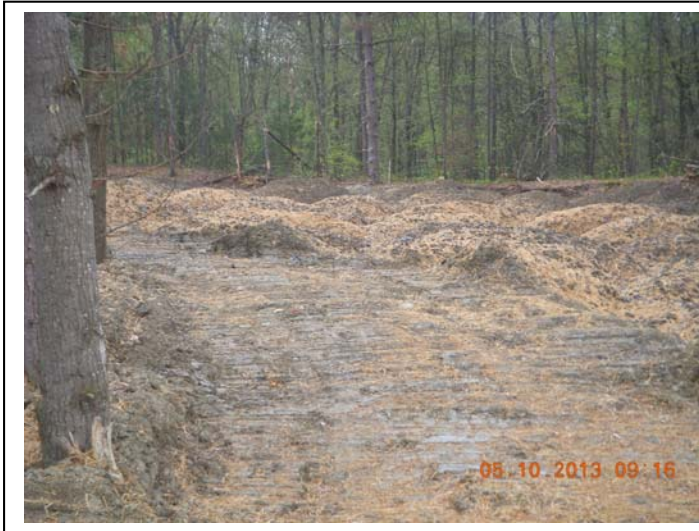
View of completed ARRI grading looking along western dogleg on Site B.