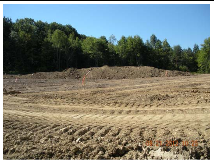
Site A, looking north, fill at west end of site (east end of fill).