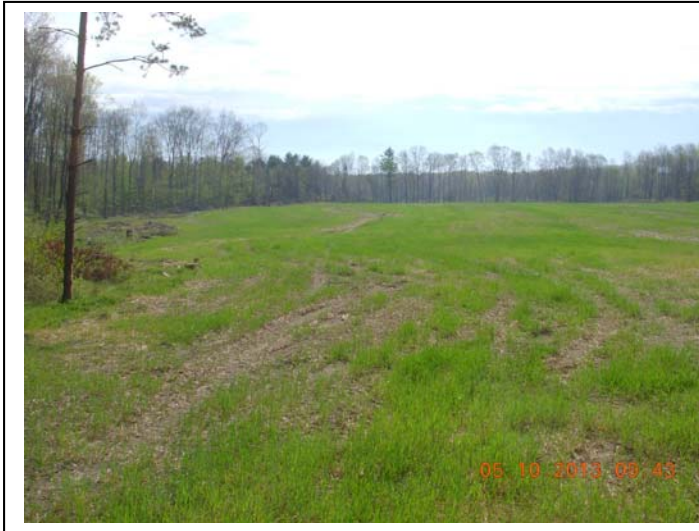
View of grass growing on Site A, looking east.