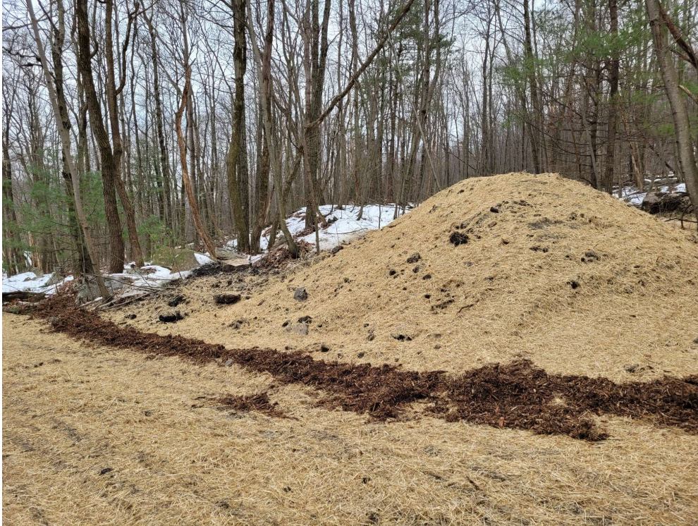
AMLF 0458-03 (VO) after seeding