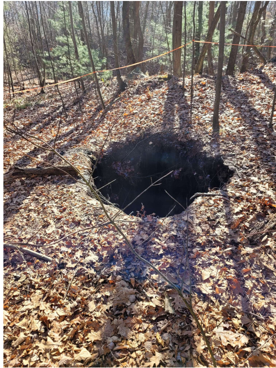
AMLF 0458-03 (VO): vertical opening measuring approximately 30 feet in diameter.