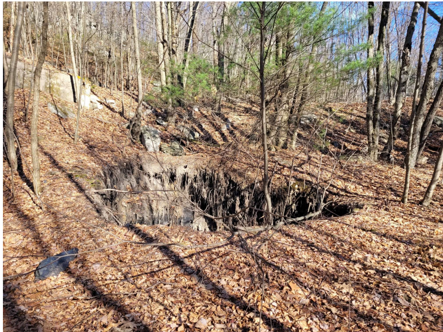
AMLF 0458-04 (VO): vertical opening measuring approximately 35 feet in diameter.