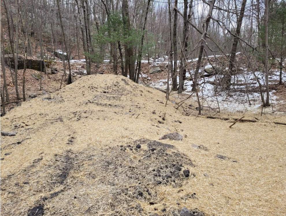
AMLF 0458-04 (VO) after seeding