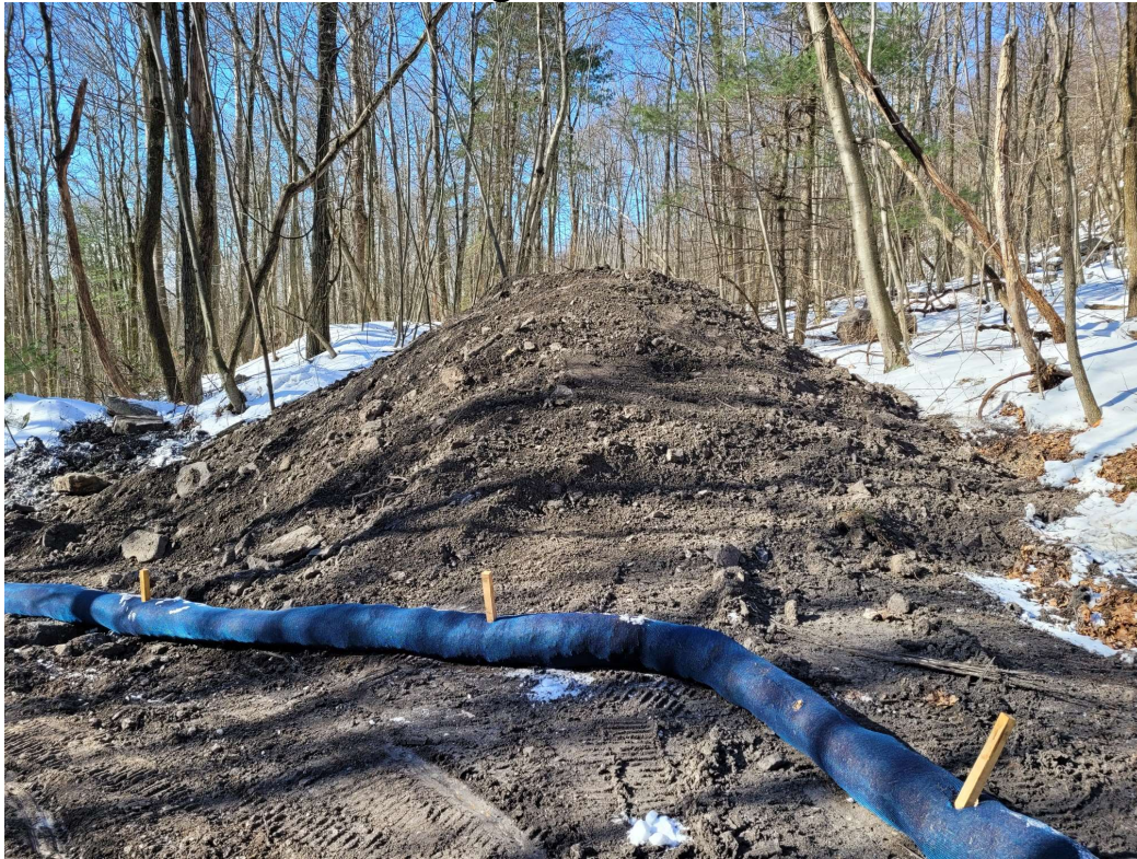
AMLF 0458-03 (VO) after being backfilled