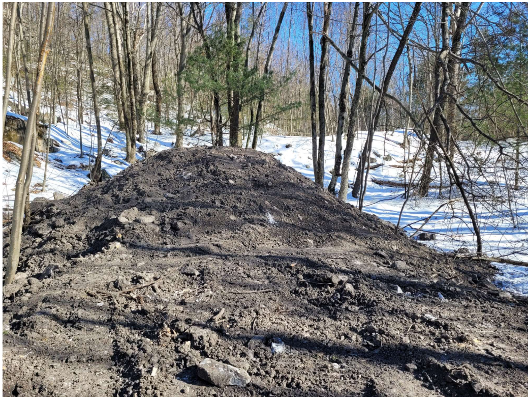
AMLF 0458-04 (VO) after being backfilled