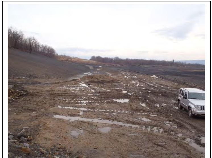
Grading Area A – Looking toward Pond C from Pond B