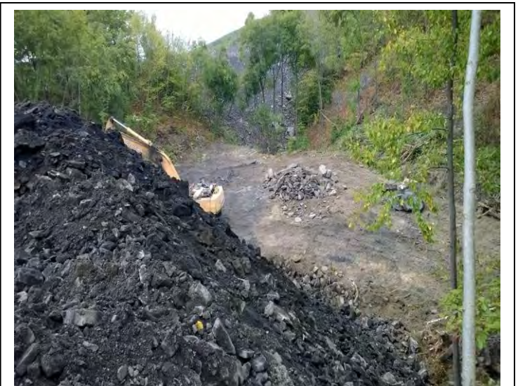
Grading Area A – Construction of Rock Chimney in Pond H