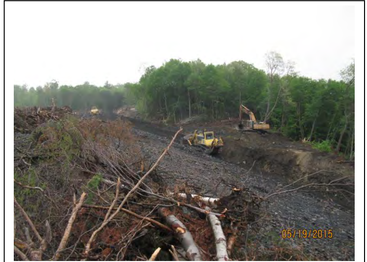
Grading Area B