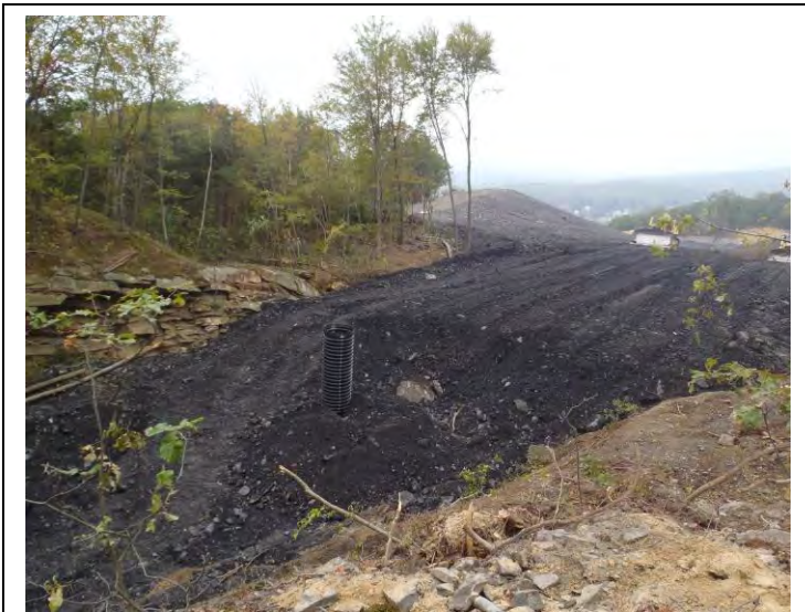
Grading Area B – Construction of Bat Gate