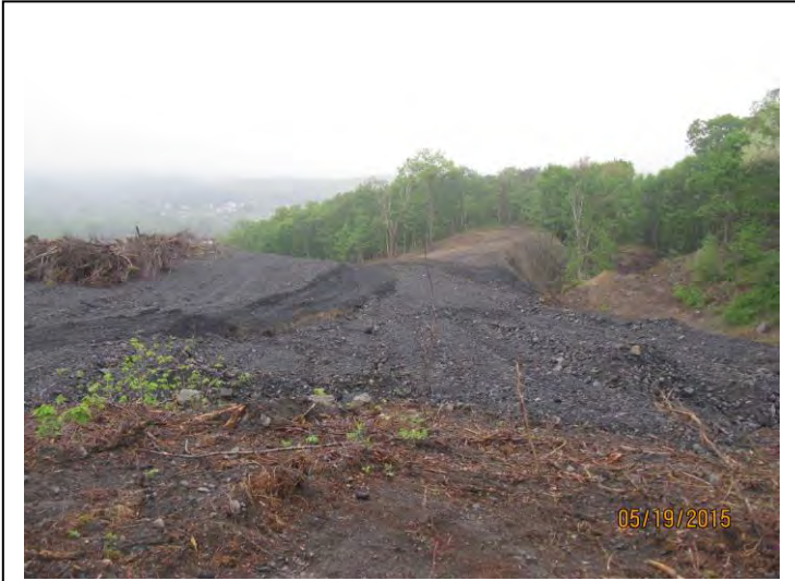
Grading Area B – Area of Pond G