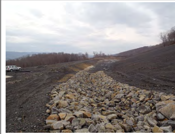
Grading Area A – Area of Pond C