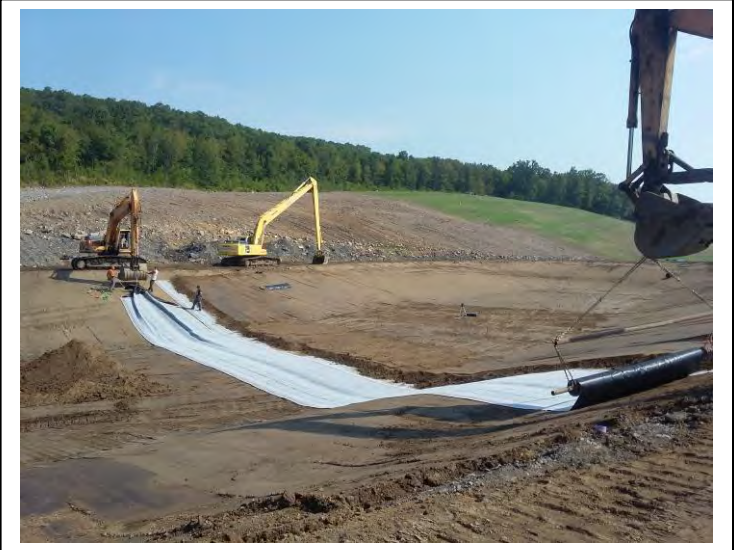
Grading Area A - Installation of clay liner in Pond A