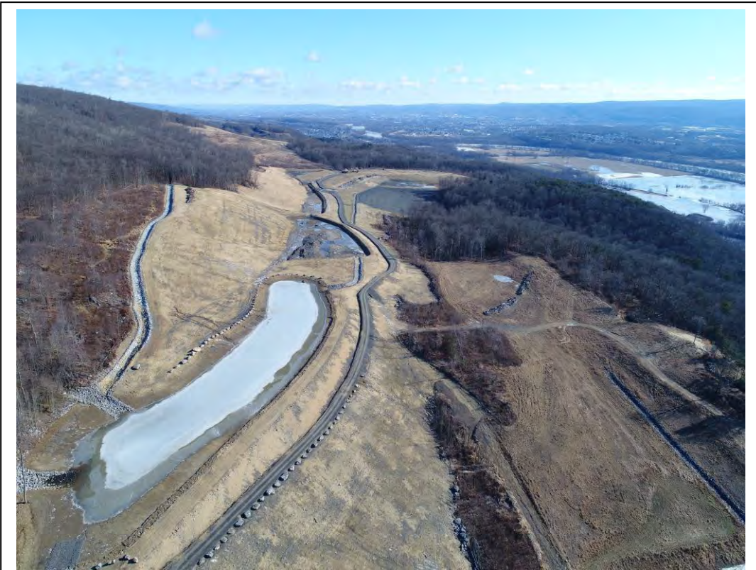
Grading Area A – Ponds A, B, C / Grading Area B