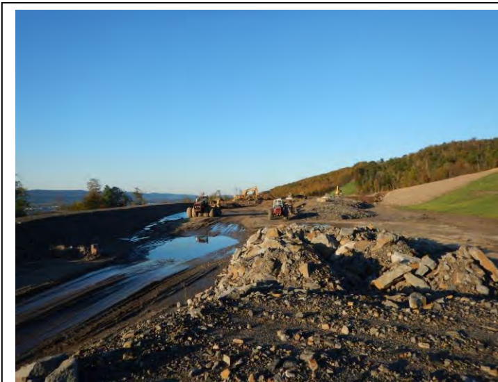
Grading Area A – Area of Pond B