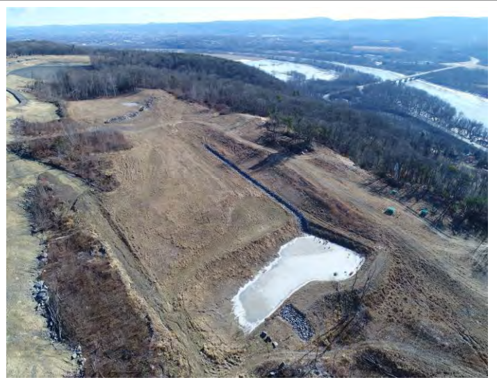
Grading Area B – Pond E