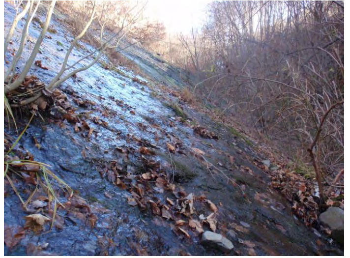
Bottom rock of pit showing surface water entering pit