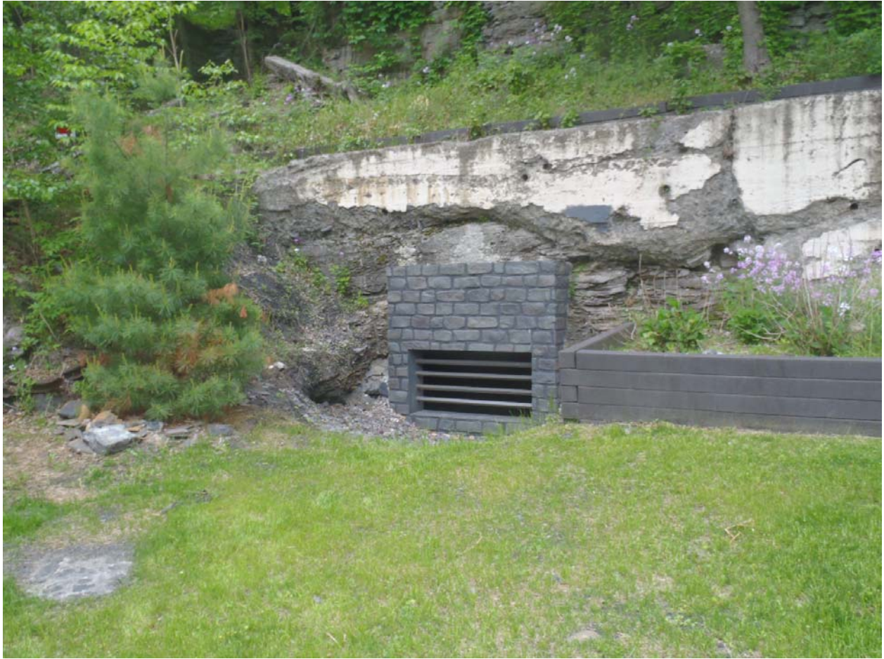
After Construction – Completed Bat Gate with Artificial Stone Surface Treatment