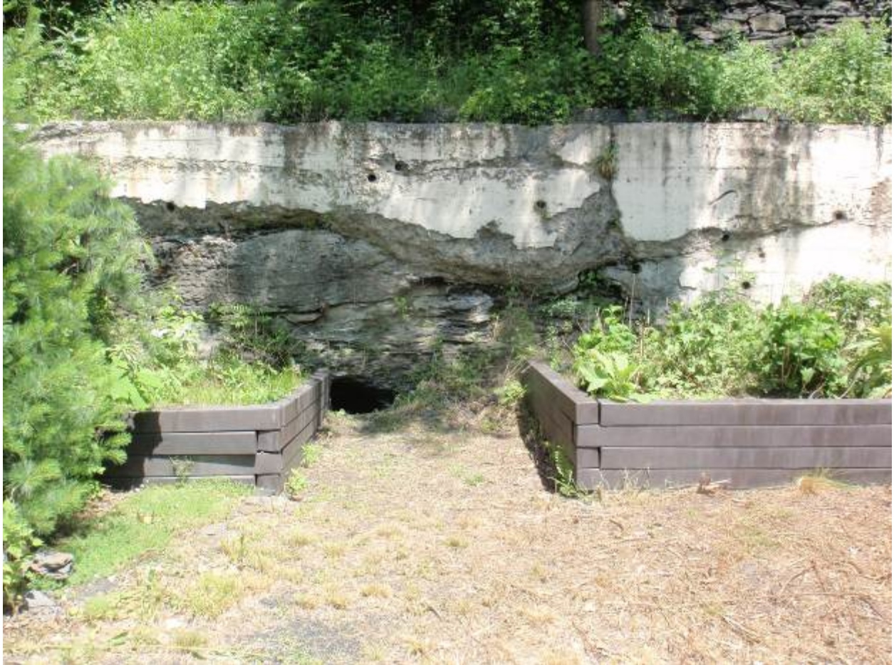
Before Construction – Mine Opening with Access into the No. 2 Tunnel