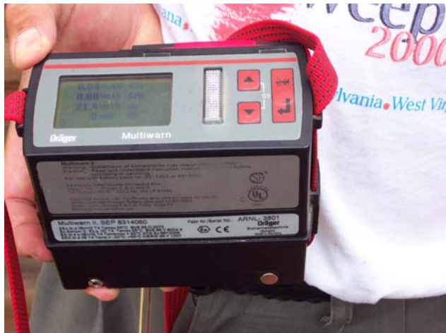
Figure 1. Dräger MultiWarn II

Field measurements are necessary to identify point sources and gas response to atmospheric conditions but are not as accurate as laboratory analyses. If the source is to be identified, grab samples are required.