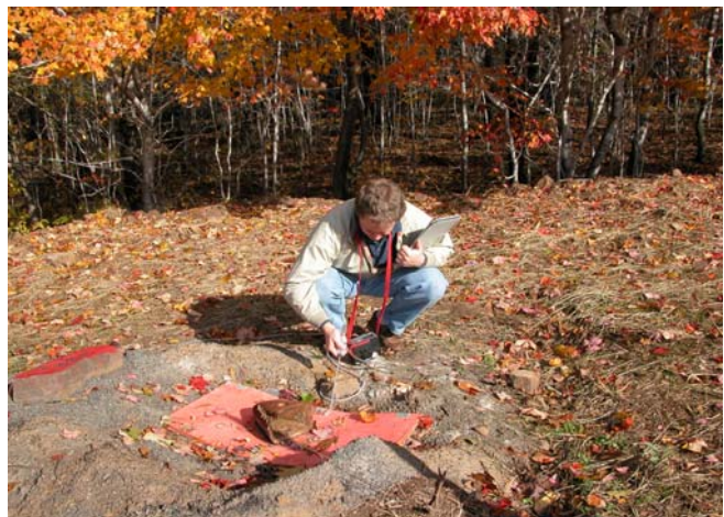
Figure 2. Borehole monitoring with sampling wand