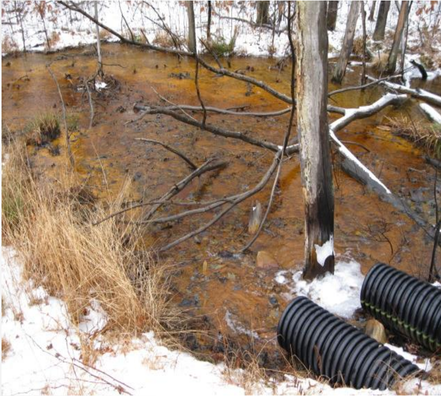
Discharge 37 – Majority of flow in Alder Run