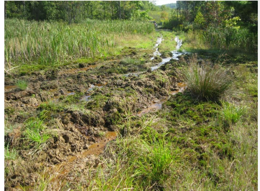
Discharge 36 – Collection Piping Collapsed