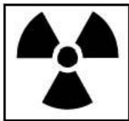
CAUTION RADIATION SYMBOL