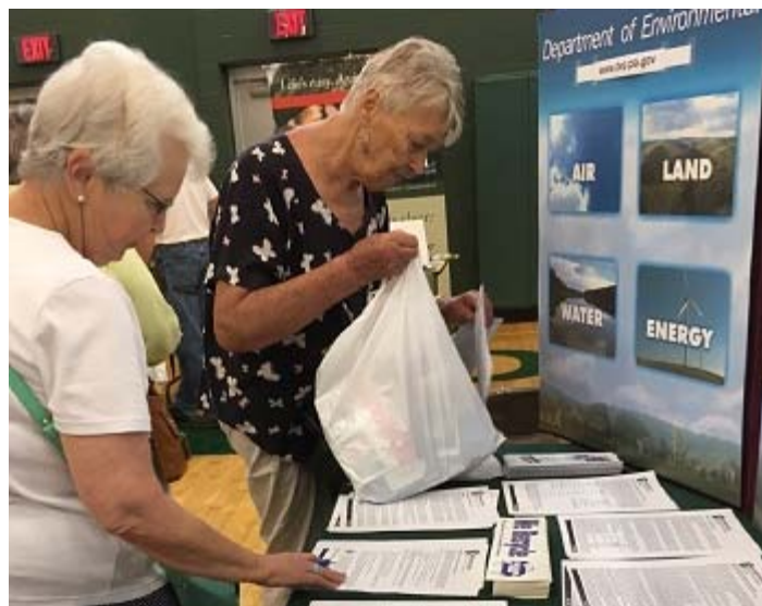
Several seniors look over environmental fact sheets and pamphlets at DEP's Senior Expo display.

WILLIAMSPORT -- Staff from DEP's North-central Regional office