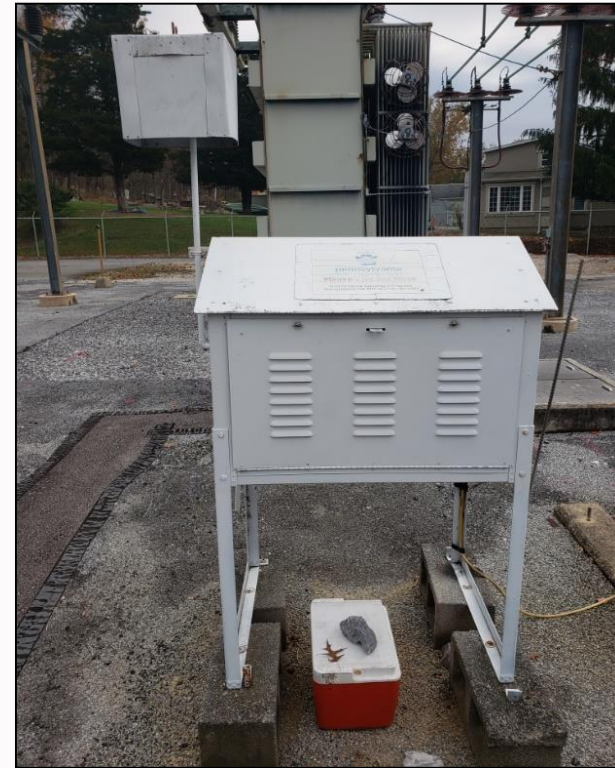
Air Sampler Housing