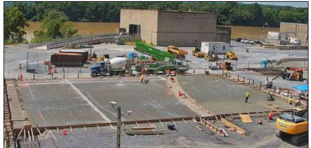
Decommissioning Support Building