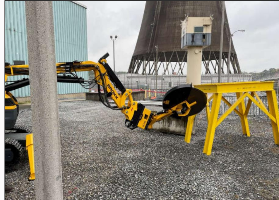
Robotic Equipment Training