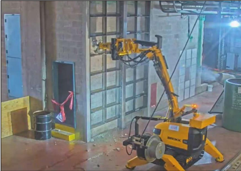
Video-Monitored Remote Work