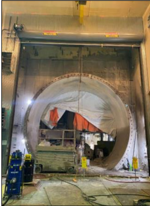
Enlarged Equipment Hatch