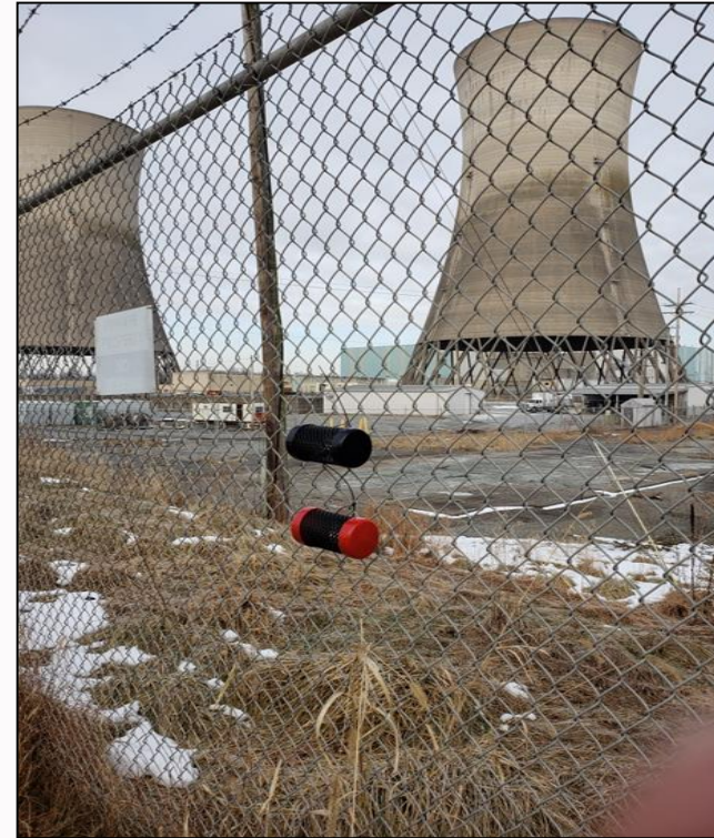
Dosimeter Placement Example