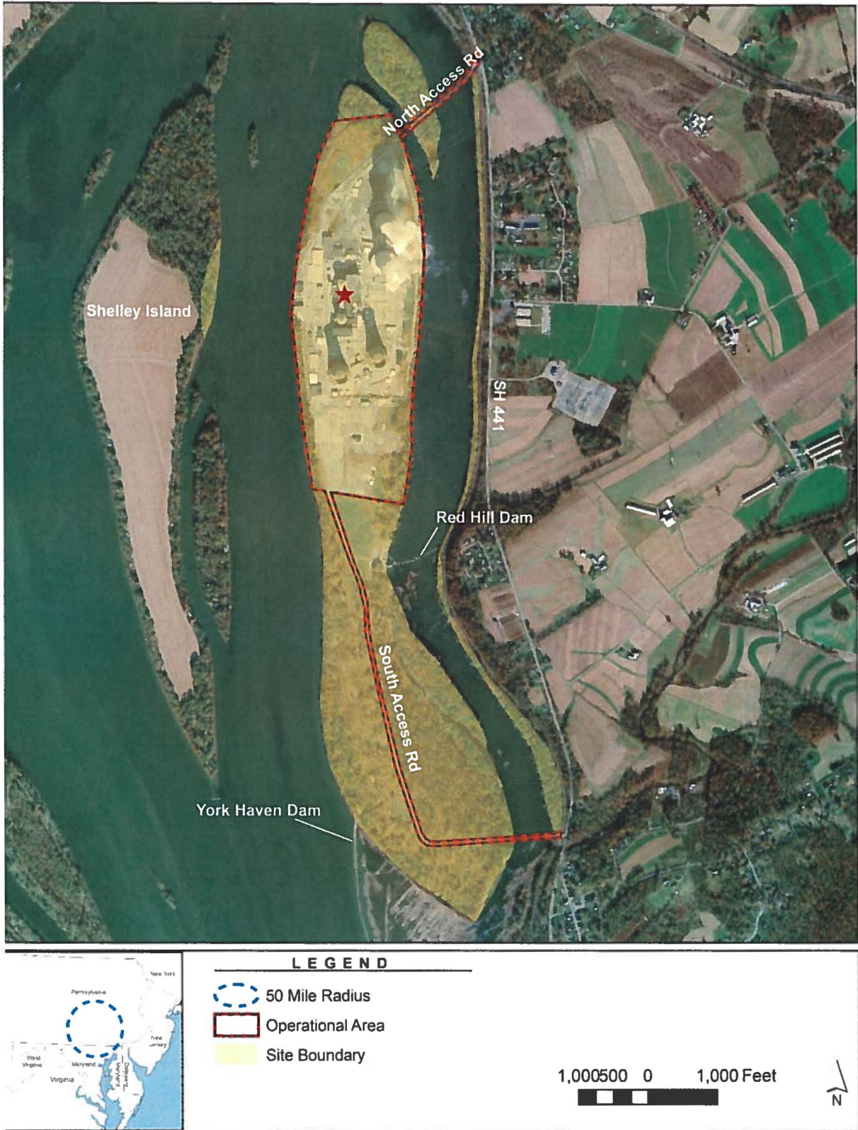
Figure 1 : TMI-1 Approximate Operational Area Boundary