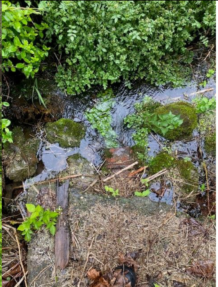
Ponded Area Pipe that Drains to Stream