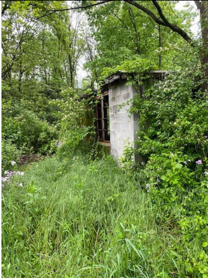
Masonry building adjacent to iron pipe and stream