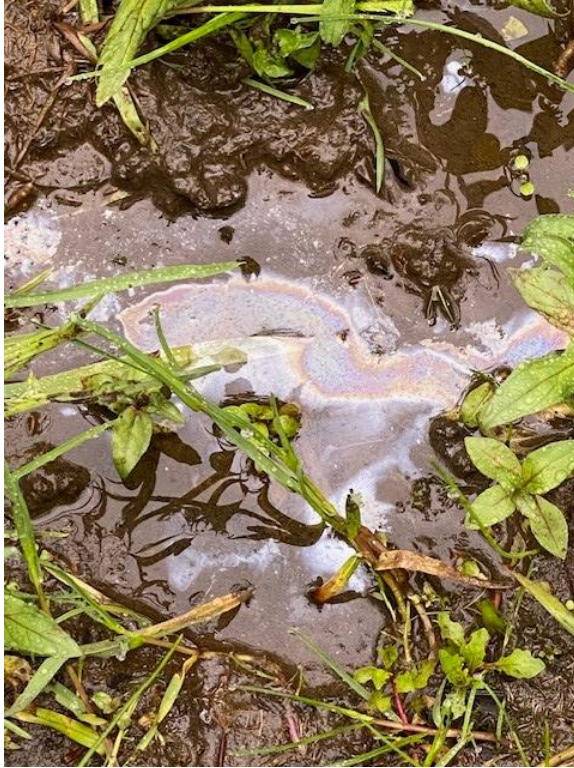
Sheen on Shoreline Upstream of Iron Pipe