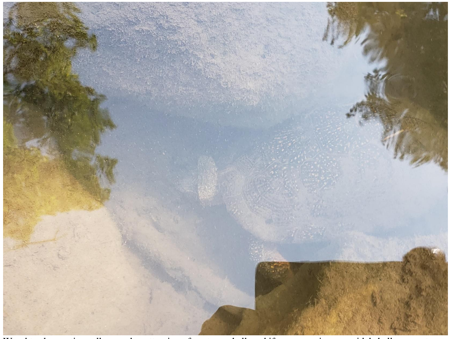
Wood turtle—notice yellow neck, patterning of spots on shell, and if you zoom in, pyramidal shell segment layering