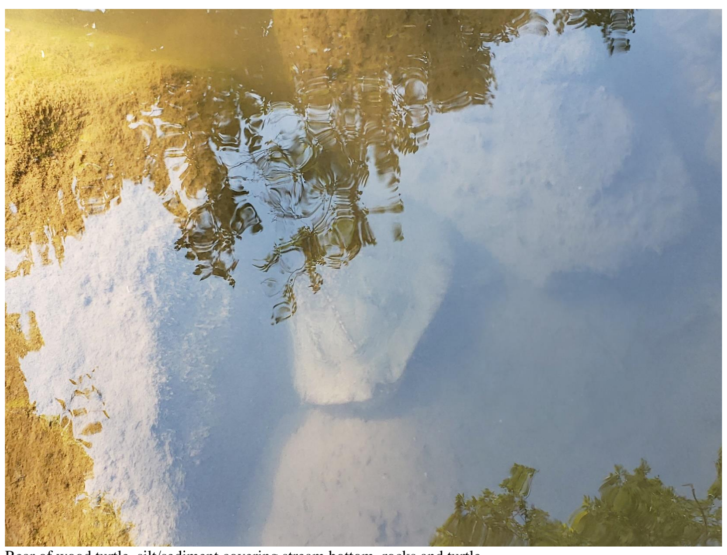
Rear of wood turtle, silt/sediment covering stream bottom, rocks and turtle