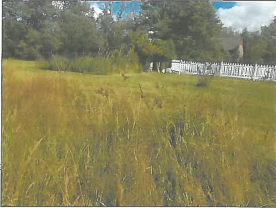
Wetland photograph 1