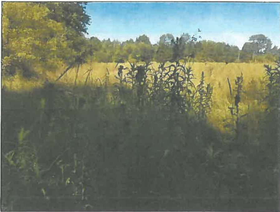
Wetland photograph 2