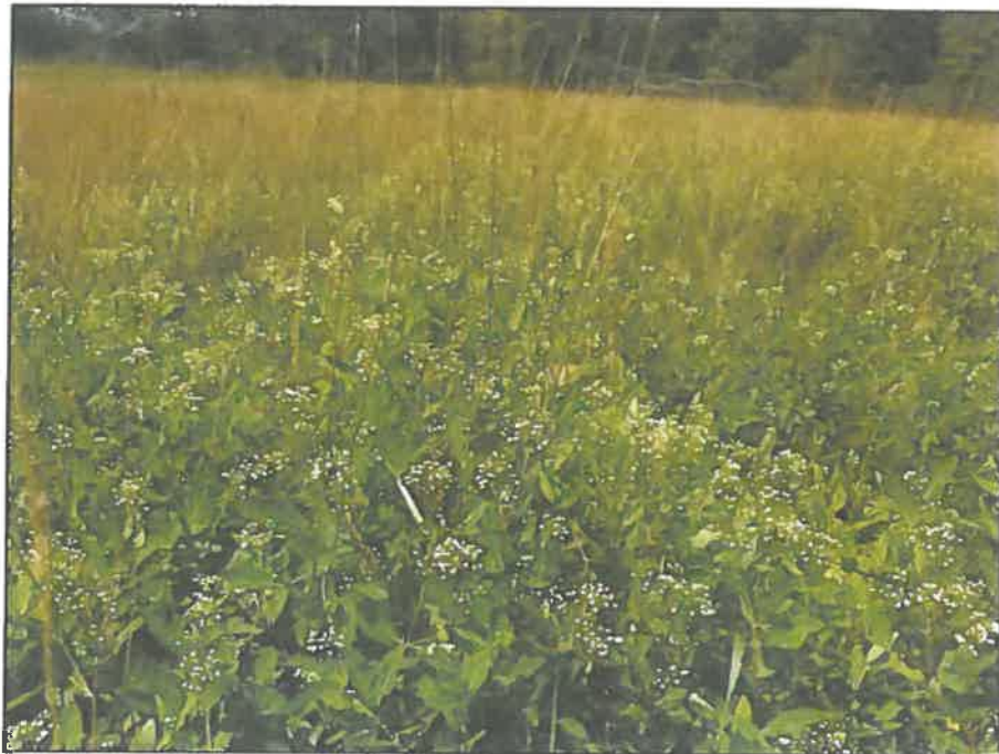
Upland photograph 2