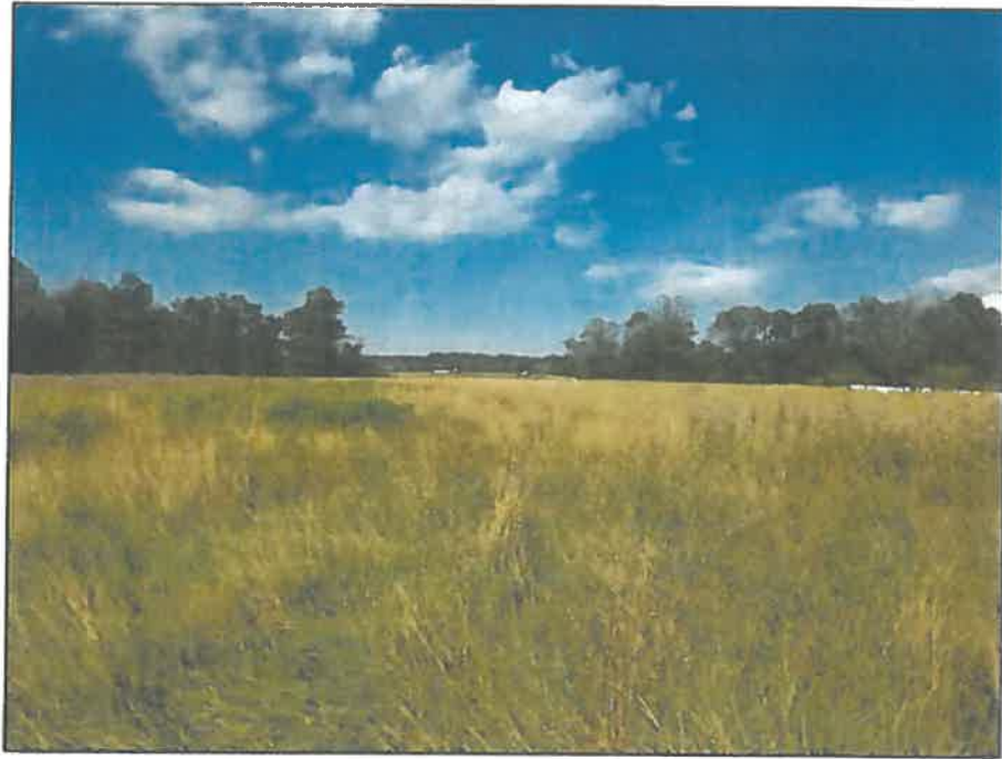
Upland photograph 1