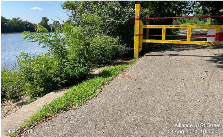
View of DEP51-S14 collected from surface soil in front of gate.

☉ 194°S (T) ● 39°56'6"N, 75°12'24"W ±13ft ▲ 9ft