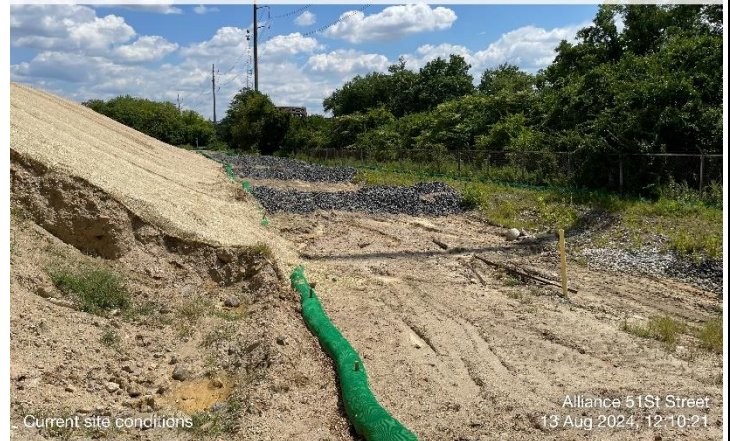
View from top of first berm looking downgradient toward the River. No pooled water is present downgradient of first berm.

☉ 92°E (T) ● 39°56'6"N, 75°12'32"W ±9ft ▲ 29ft