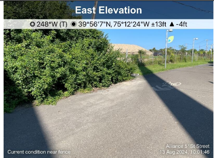
Current conditions on the trail looking toward Alliance property.