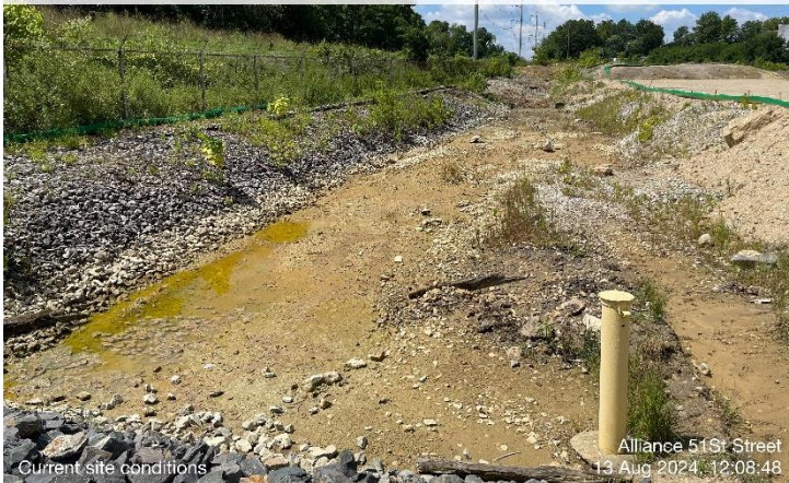
Ponded water upgradient of first berm.

☉ 236°SW (T) ● 39°56'6"N, 75°12'32"W ±13ft ▲ 26ft