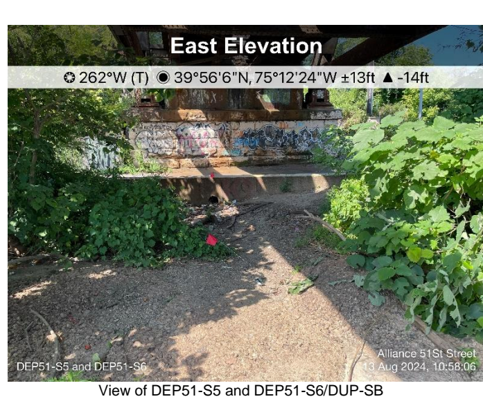
View of DEP51-S5 and DEP51-S6/DUP-SB