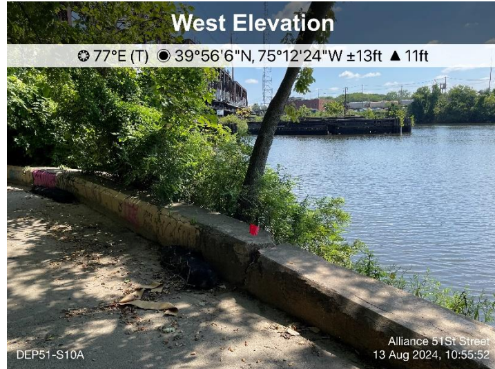
View of DEP51-S10A; location moved to where sediment was present