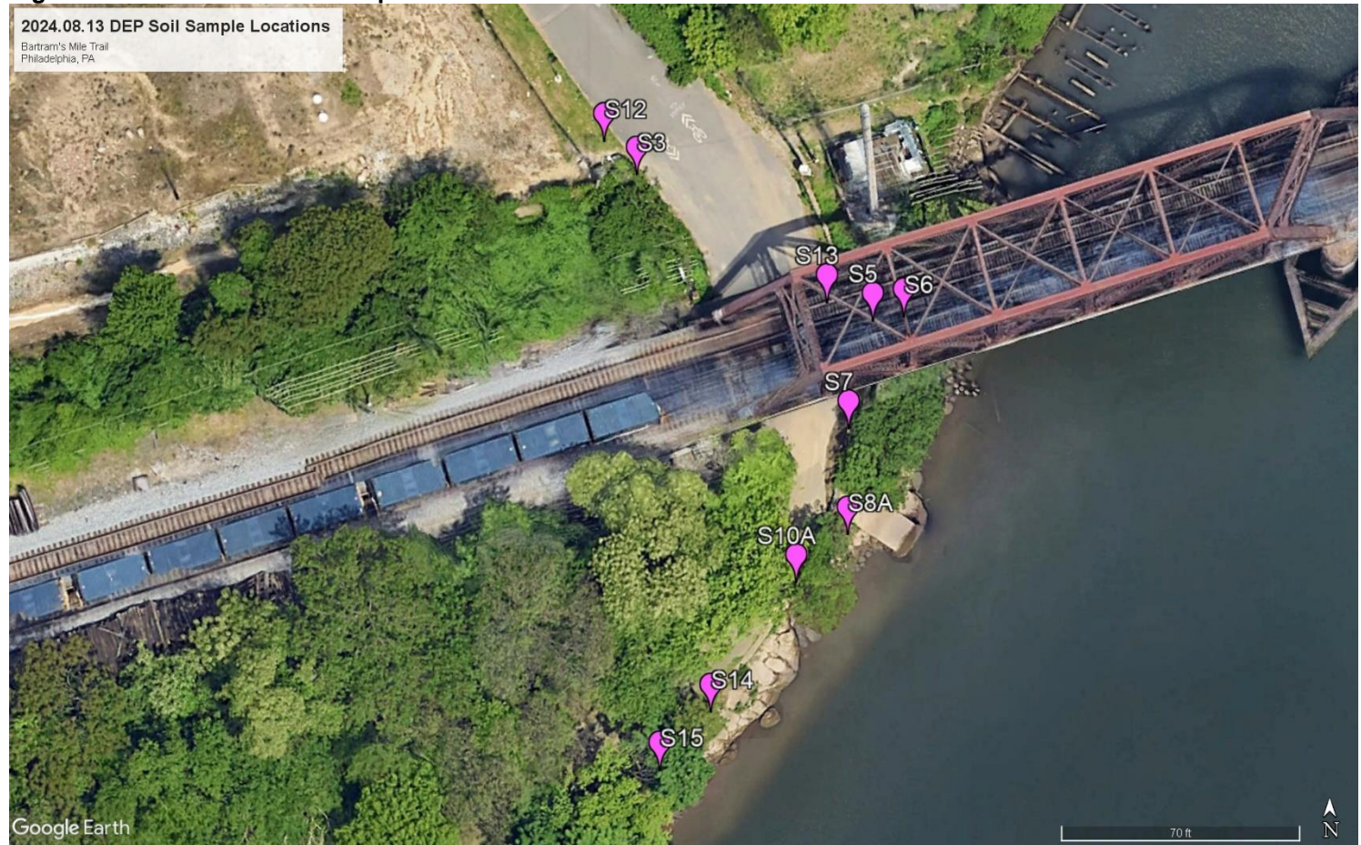
Figure 1 – 8/13/24 DEP Soil Sample Locations.