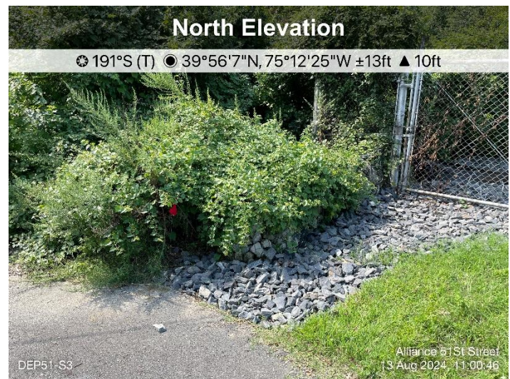
View of DEP51-S3. Sampled from surface soil adjacent stone.