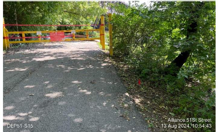
View of DEP51-S15 collected past the gate on Bartram's Garden property.

☉ 54°NE (T) ● 39°56'5"N, 75°12'25"W ±55ft ▲ 11ft