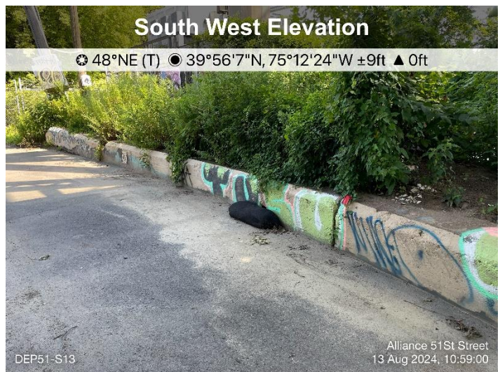
Overview of DEP51-S13 showing sediment on trail.