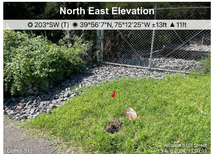
View of DEP51-S12 located in grass adjacent to soil removal area.