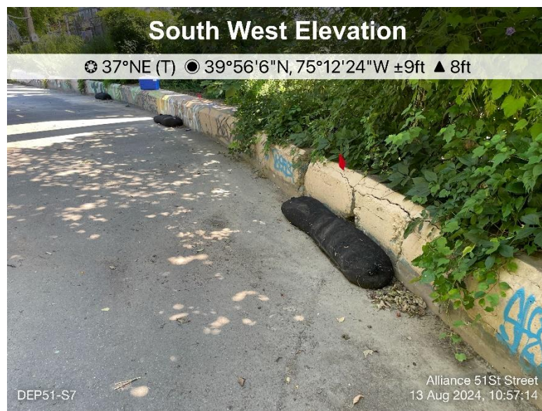
View of DEP51-S7 sampled from accumulated material behind sock.