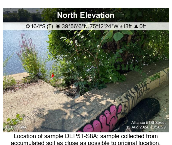
Location of sample DEP51-S8A; sample collected from accumulated soil as close as possible to original location.