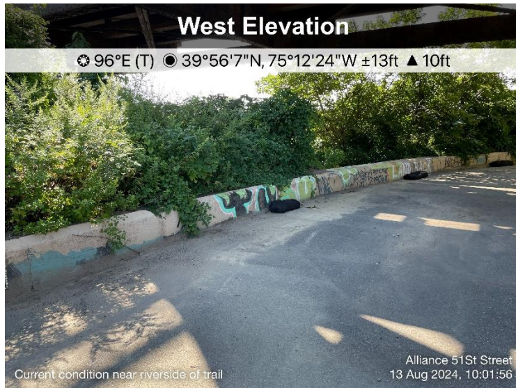
Dried sediment on trail under railroad bridge.