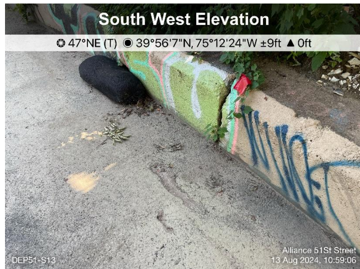
View of sample location DEP51-S13; sediment on trail