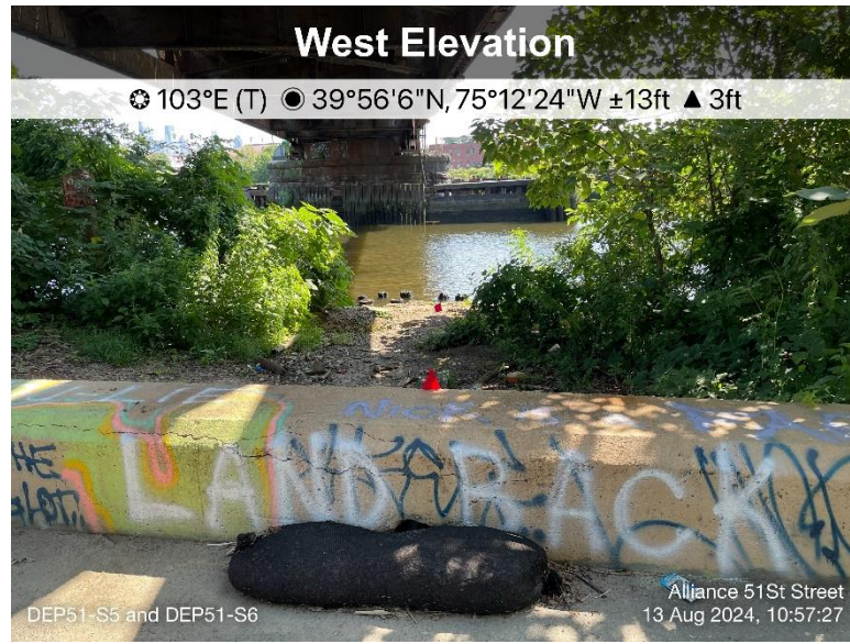
View of DEP51-S5 and DEP51-S6/DUP-SB