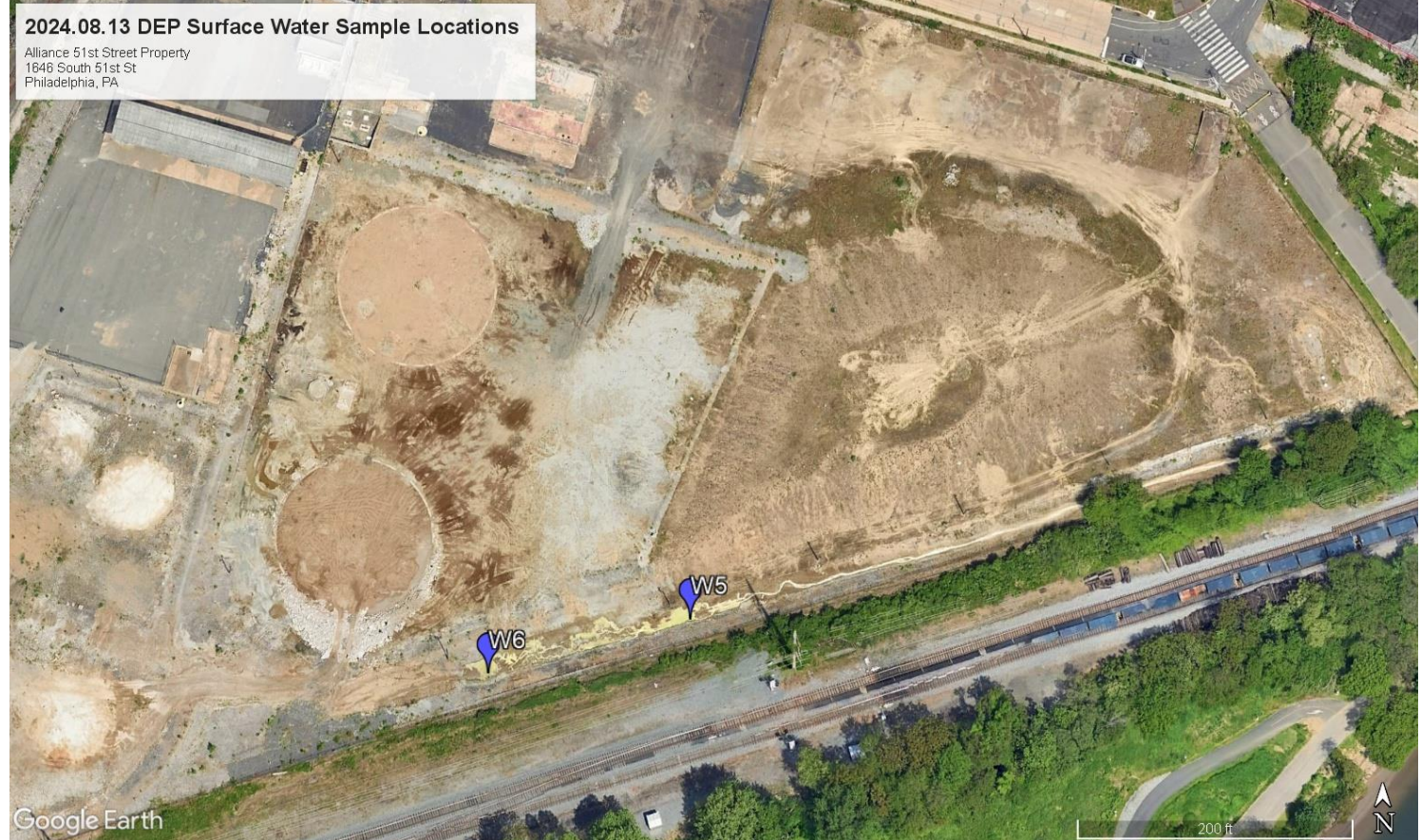
Figure 2 – 8/13/4 DEP Surface Water Sample Locations