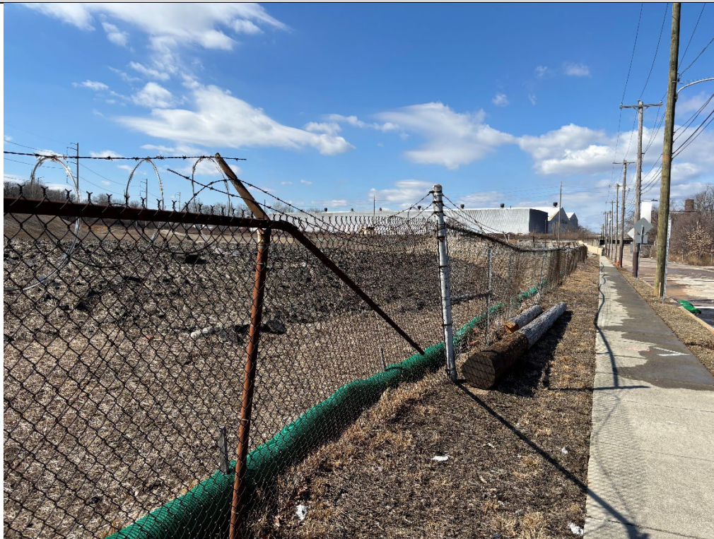
Damaged security fence along 51 st St. End of photo log.