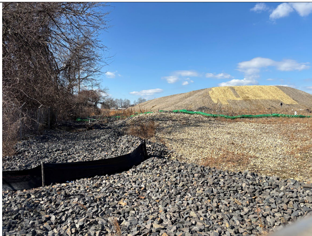
Rear side of large fill dirt stockpile; silt fence along stone-covered swale.