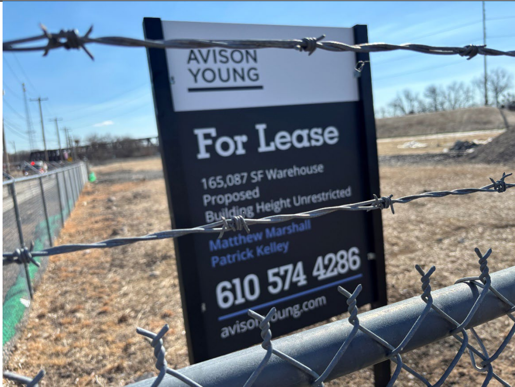
"For Lease" sign present along site boundary with 51 st Ave.