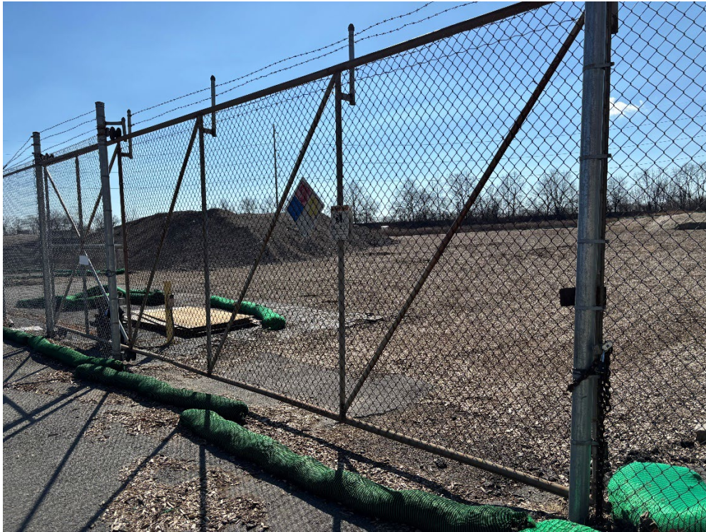
Most upslope gate and filter sock.