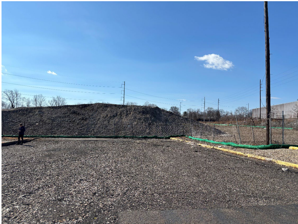
Mid-slope parking lot and stone stockpile.