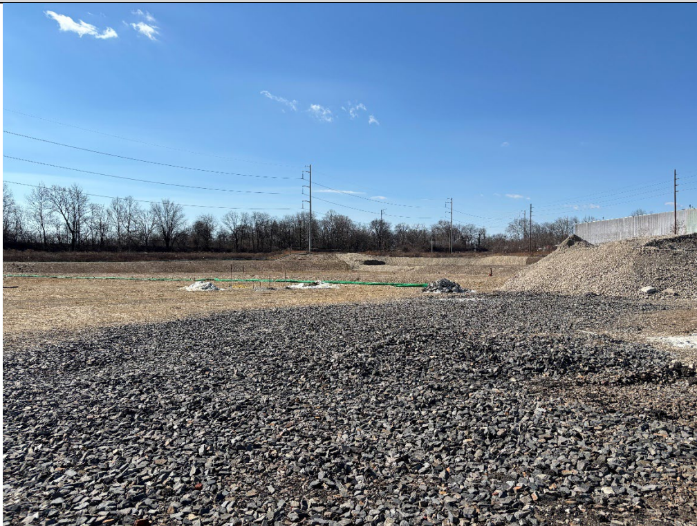
Looking upslope from 51 st St.