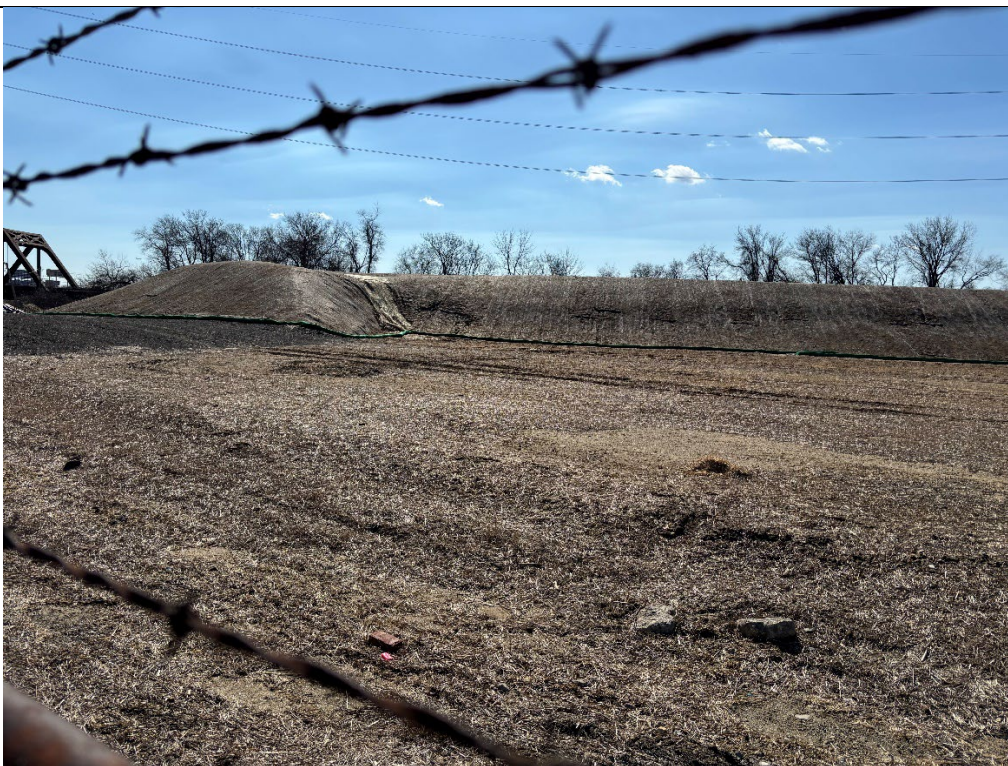
Downslope portion of site and of large fill dirt stockpile, with erosion blanket present in bend of stockpile.