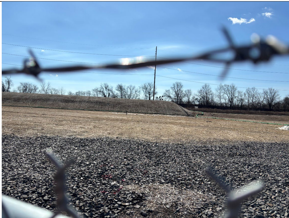
Midslope portion of site with upslope part of large fill dirt stockpile in distance.