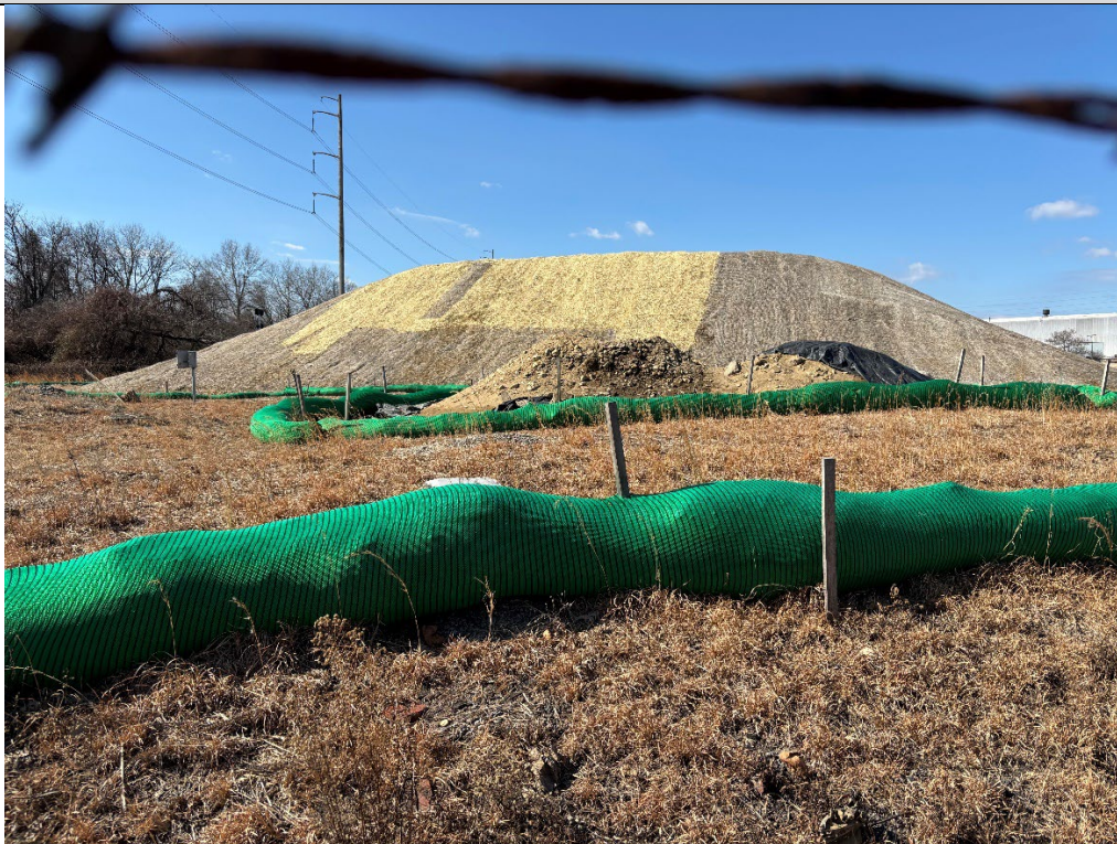
Downslope end of large fill dirt stockpile with erosion blanket present. Small contaminated fill dirt stockpile in front, surrounded by filter sock; with black tarp mostly removed.