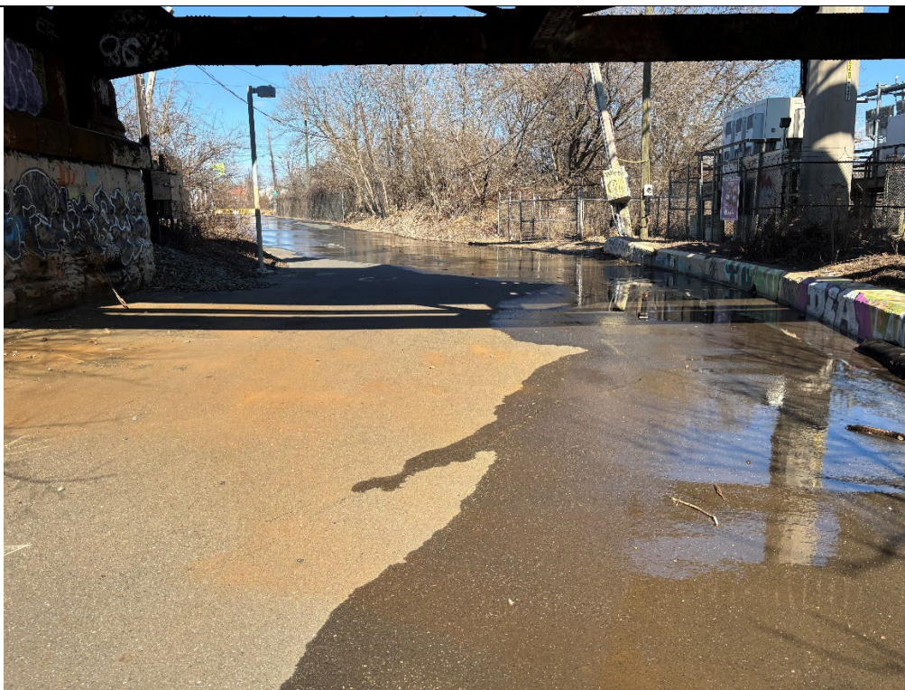
Looking north along Bartram's Garden trail from south side of railroad bridge.