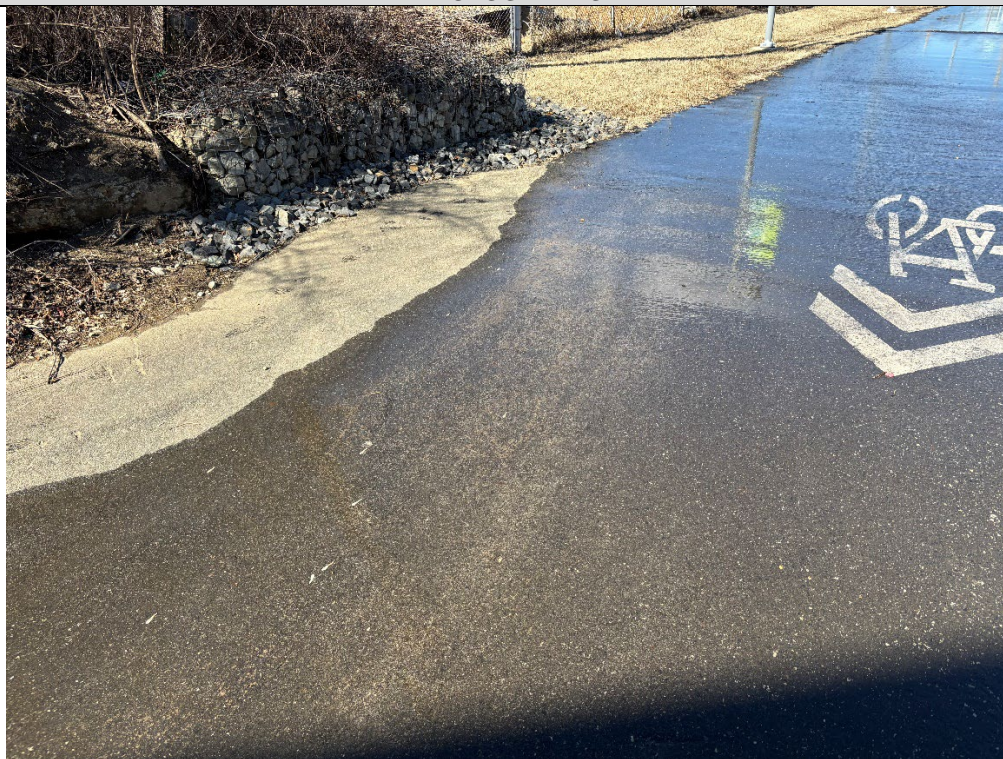
Sediment staining along Bartram's Garden trail. Philadelphia Fire Department was conducting a flushing and/or training activity at a hydrant along 51 st St., causing the wet pavement.