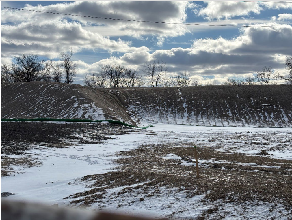
Large fill dirt stockpile with erosion gullies visible.