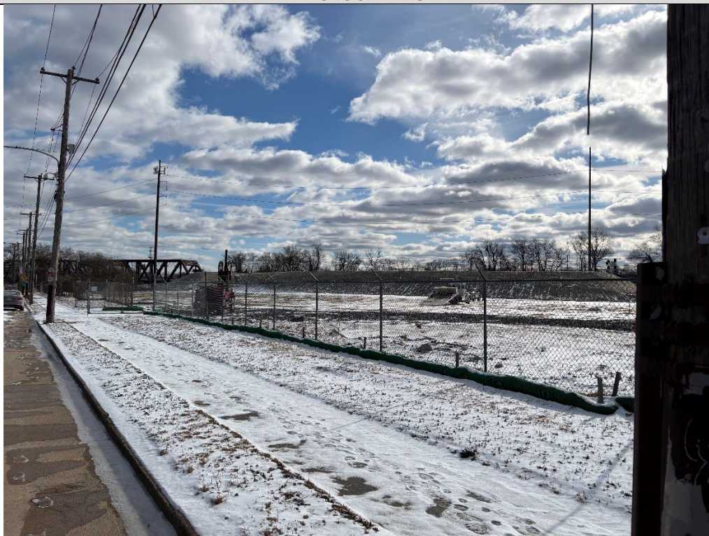
Looking downslope along fence and filtersock from 51 st St.