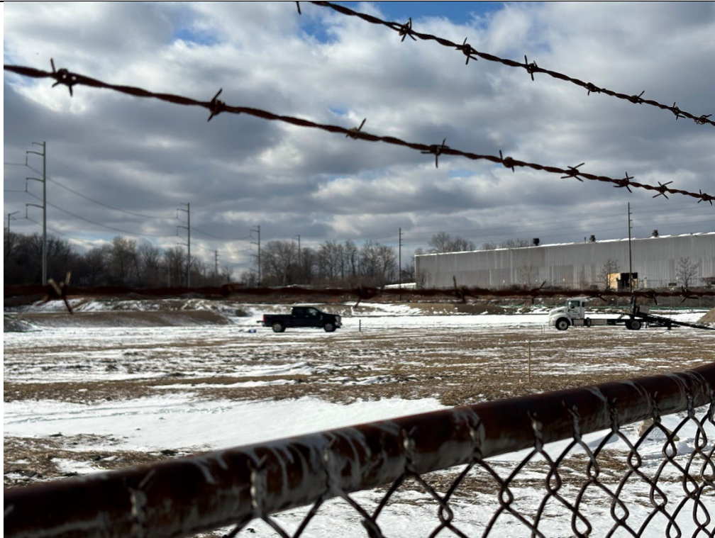
Drilling contractors present on site. End of photo log.