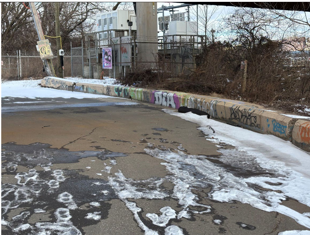
Bartram's Garden trail with one inlet protected with filtersock.