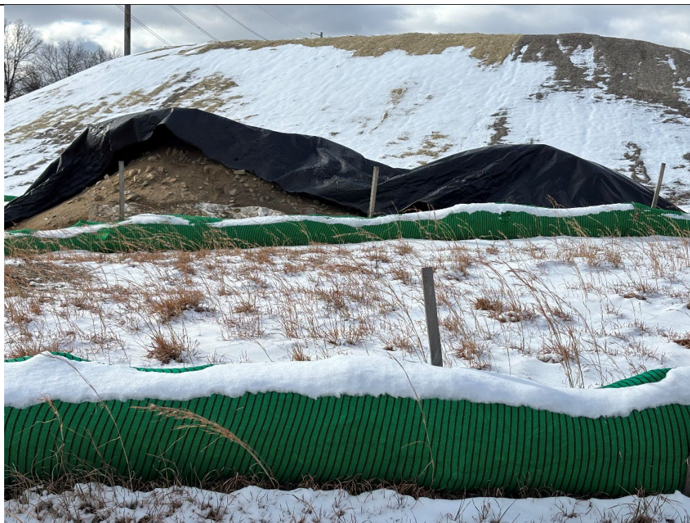
Contaminated fill dirt stockpile in front of larger fill dirt stockpile.