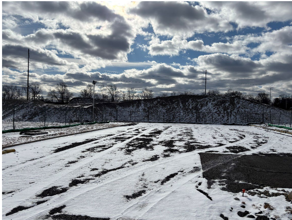
Stone stockpile on 51 st St. side of site.