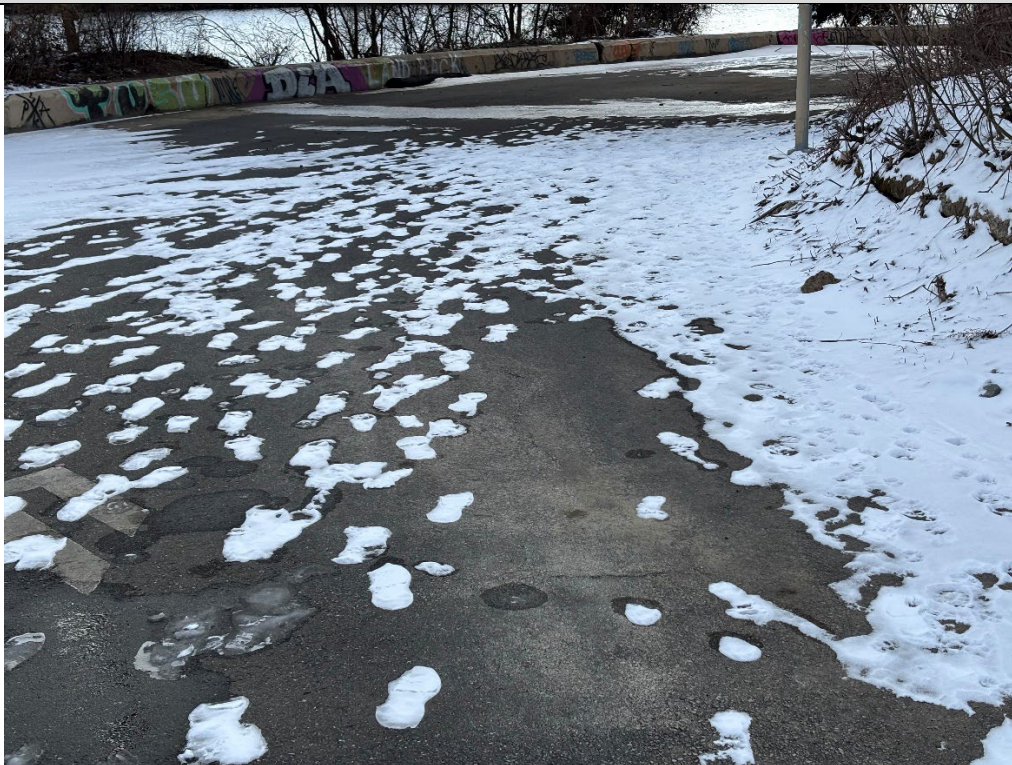
Bartram's Garden trail just downslope of site.