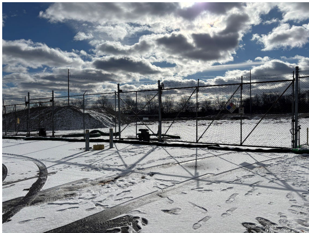
Most upslope gate and filter sock, along 51 st St.