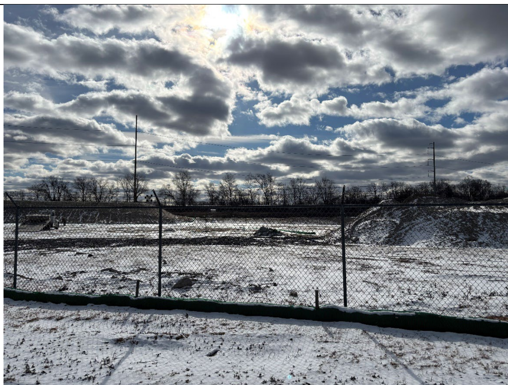
Midslope portion of site with drilling contractors and stockpiles in view.