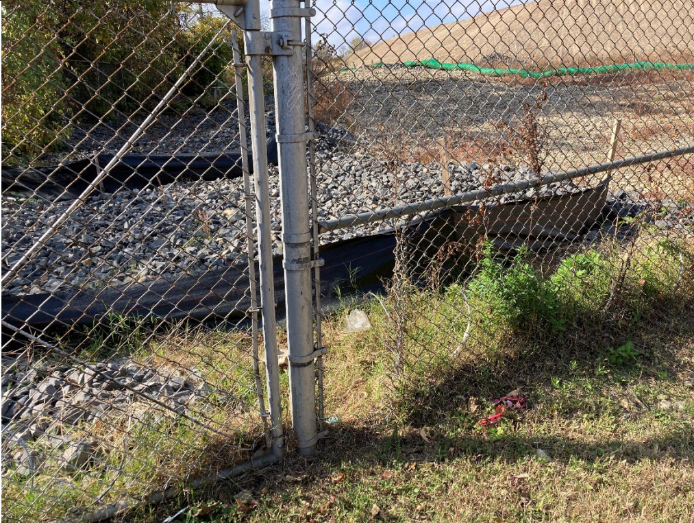
Chain link fence and hole in fence at downslope end of site.