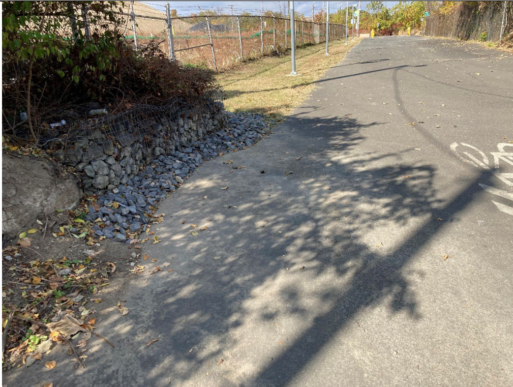
Sediment staining along Bartram's Garden trail.