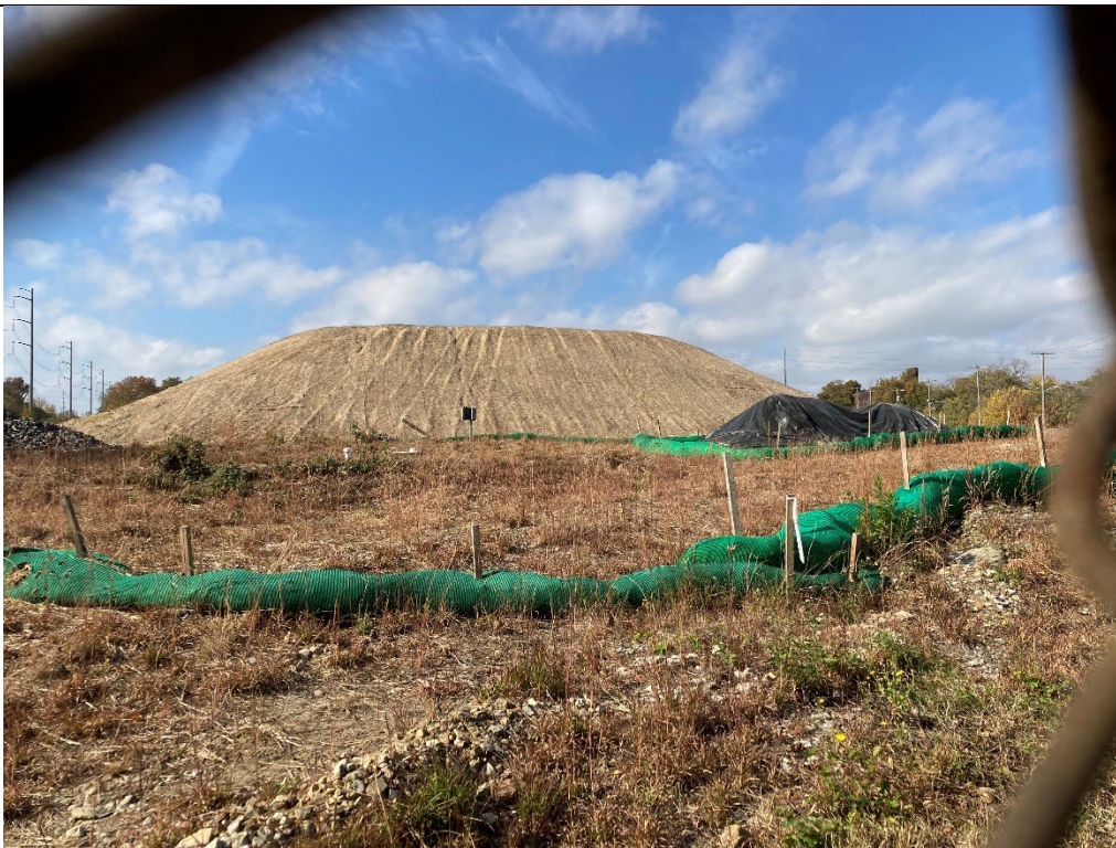
Downslope end of large fill dirt stockpile, with erosion gullies present. Small contaminated dirt pile is covered in black tarp at right-center.