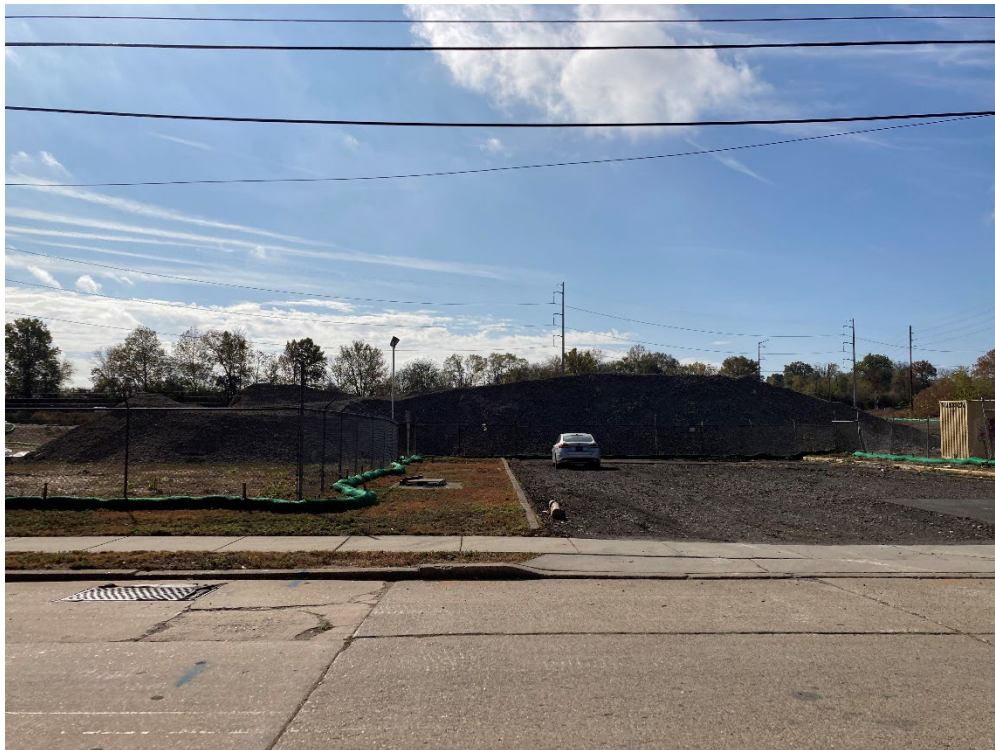
Stone stockpile as photographed from 51 st St.