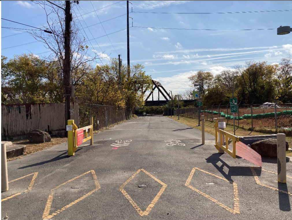
Open gates of Bartram's Garden trail at 51 st and Botanic Streets.