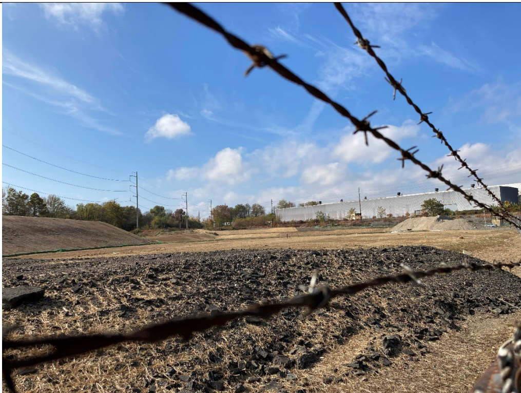
Looking from downslope to upslope across site.