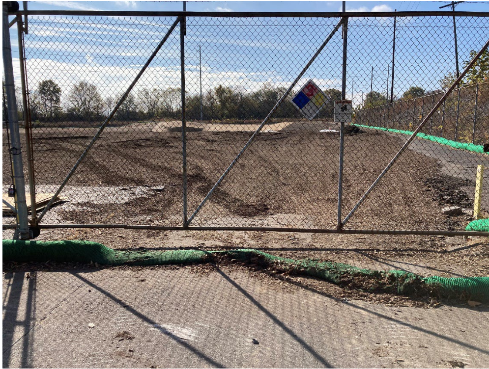
Upslope gate along 51 st St. with run-over and damaged filter sock.