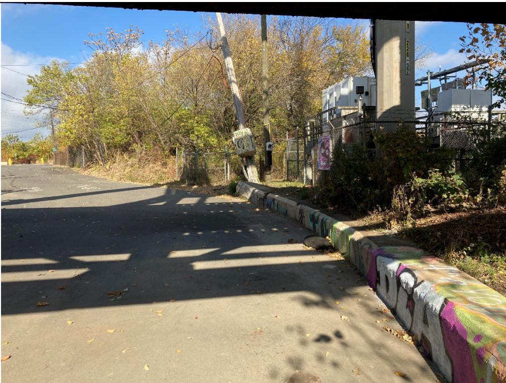
Sediment staining and inlets along Bartram's Garden trail under railroad bridge. Bright spots are sunlight getting through openings in bridge.