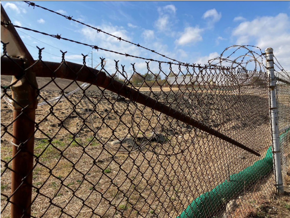
Chain link fence damage along 51 st St.