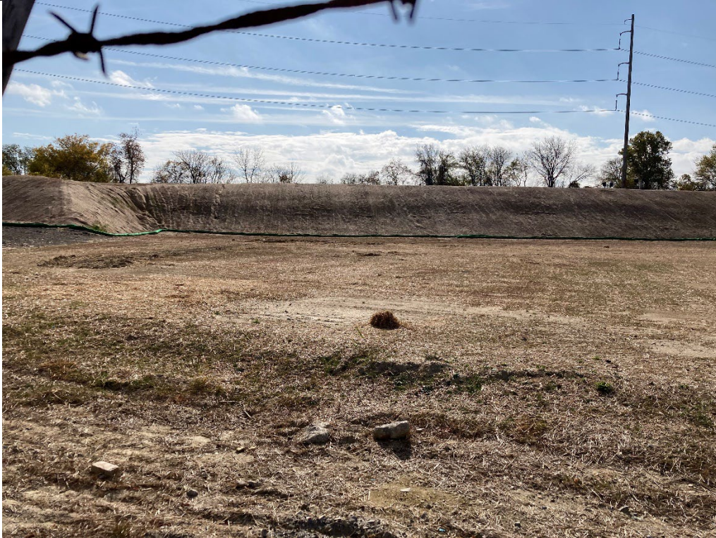
Large fill dirt stockpile with erosion gullings present towards left.