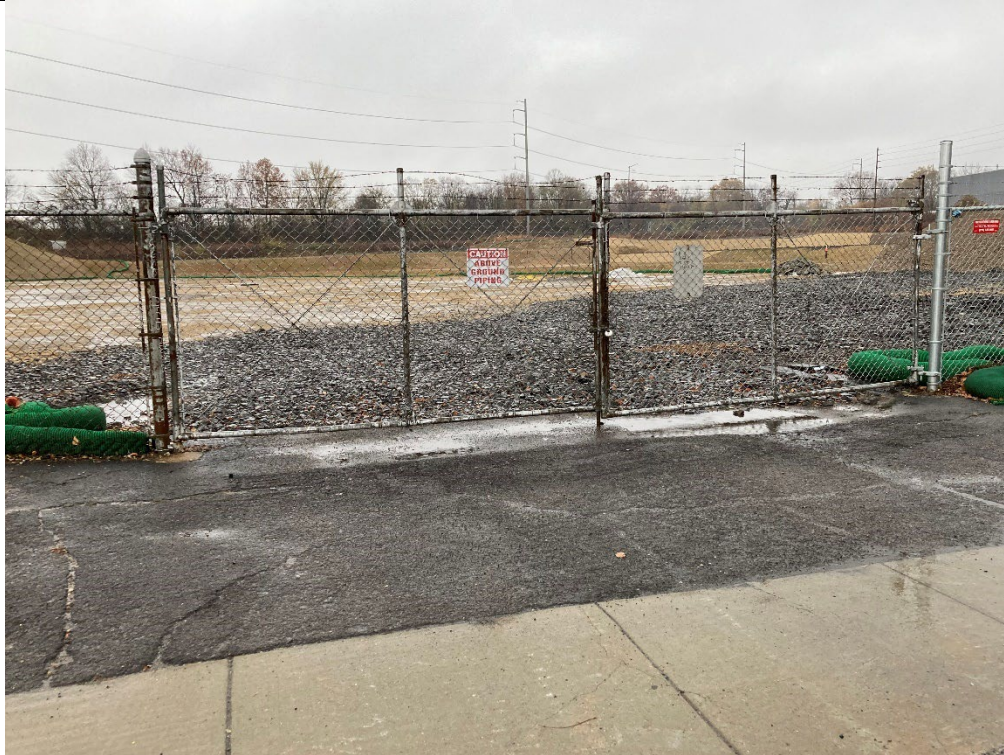
The more downslope of the two gates to the site, along 51 st St.