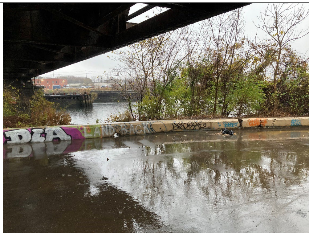
Bartram's Garden trail under railroad bridge.