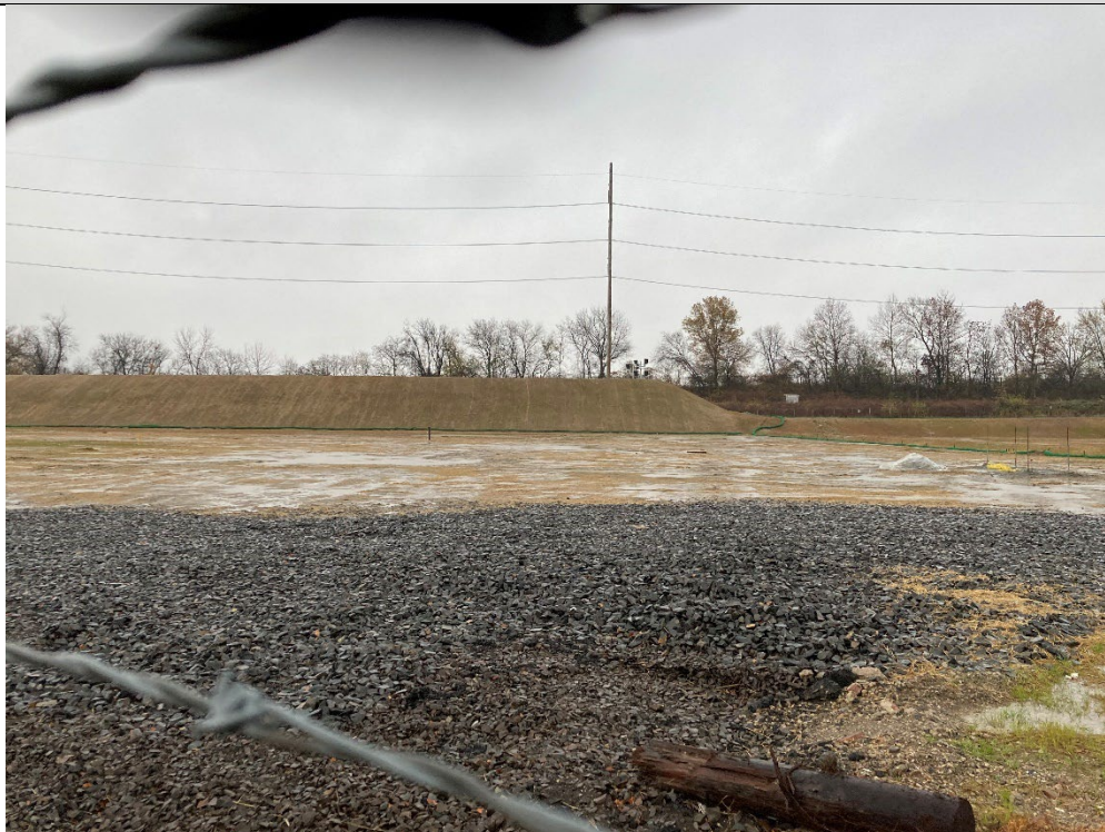
Puddling on site during rain event, with large fill dirt stockpile in background.