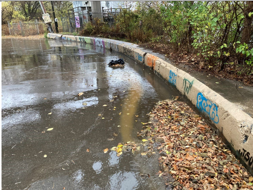
Sediment plume in stormwater during active rain event, on Bartram's Garden trail under railroad bridge.