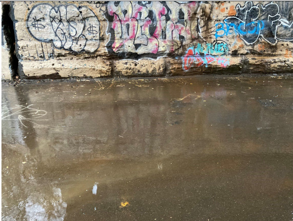
Bartram's Garden trail under railroad bridge, with sediment plume visible.