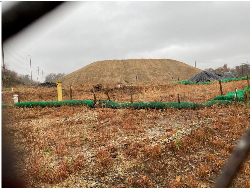
Downslope end of the large fill dirt stockpile, with smaller tarped stockpile at center-right.