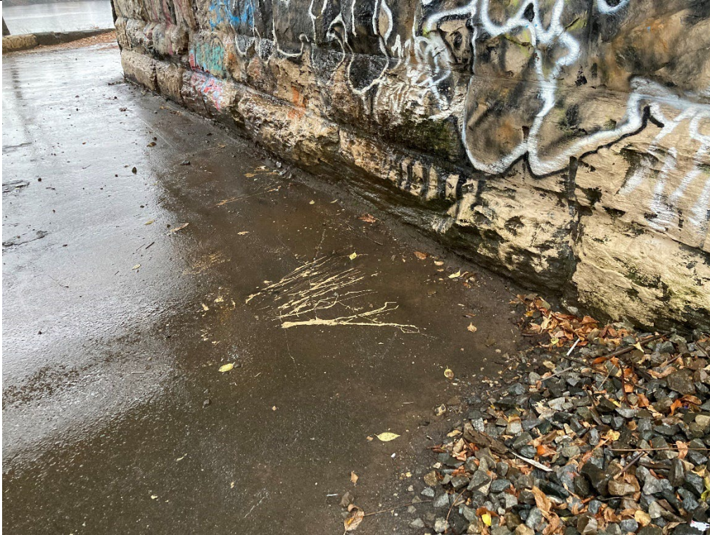
Upslope bridge abutment of railroad bridge over Bartram's Garden trail.