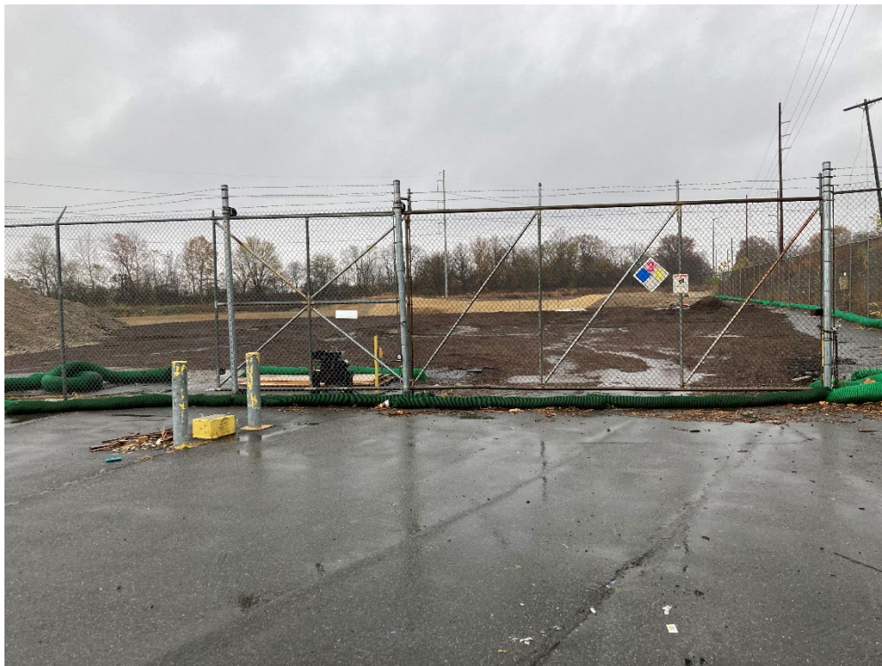
Most upslope gate, along 51 st St.