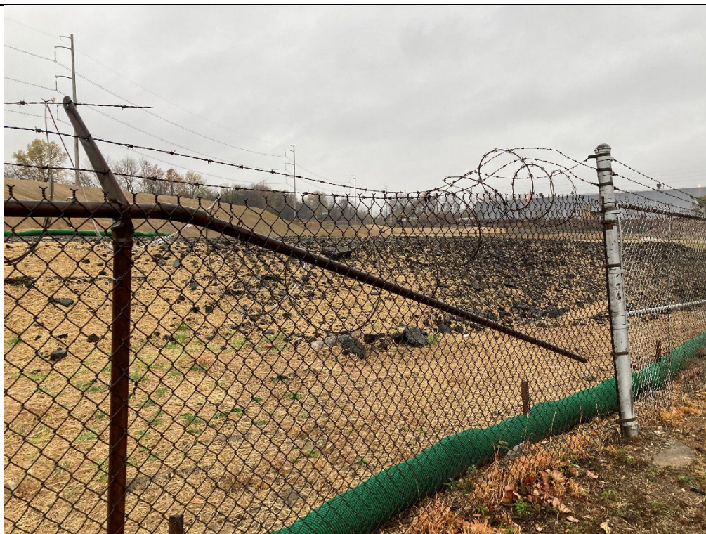
Damage to security fence near corner of 51 st and Botanic Sts. End of photo log.