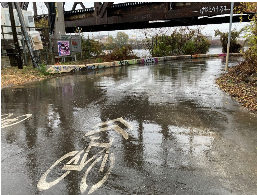
Bartram's Garden trail with previous sediment staining visible.