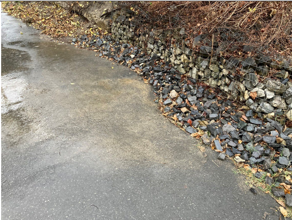
Sediment staining on Bartram's Garden trail at most downslope boundary of site.