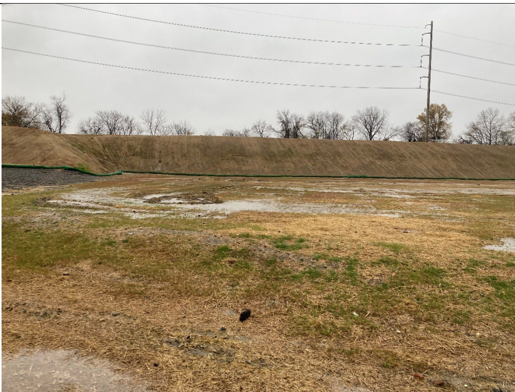
Puddling on site during rain event, with large fill dirt stockpile in background.