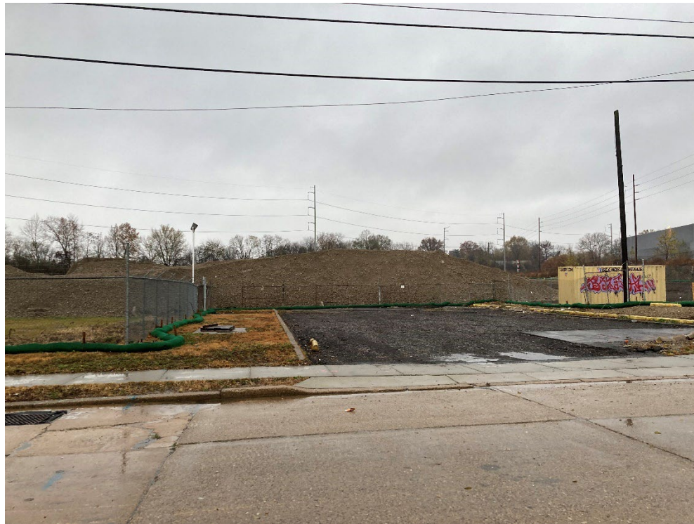
Stone stockpile, taken from 51 st St.