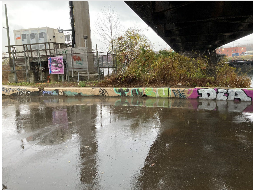
Bartram's Garden trail under railroad bridge.