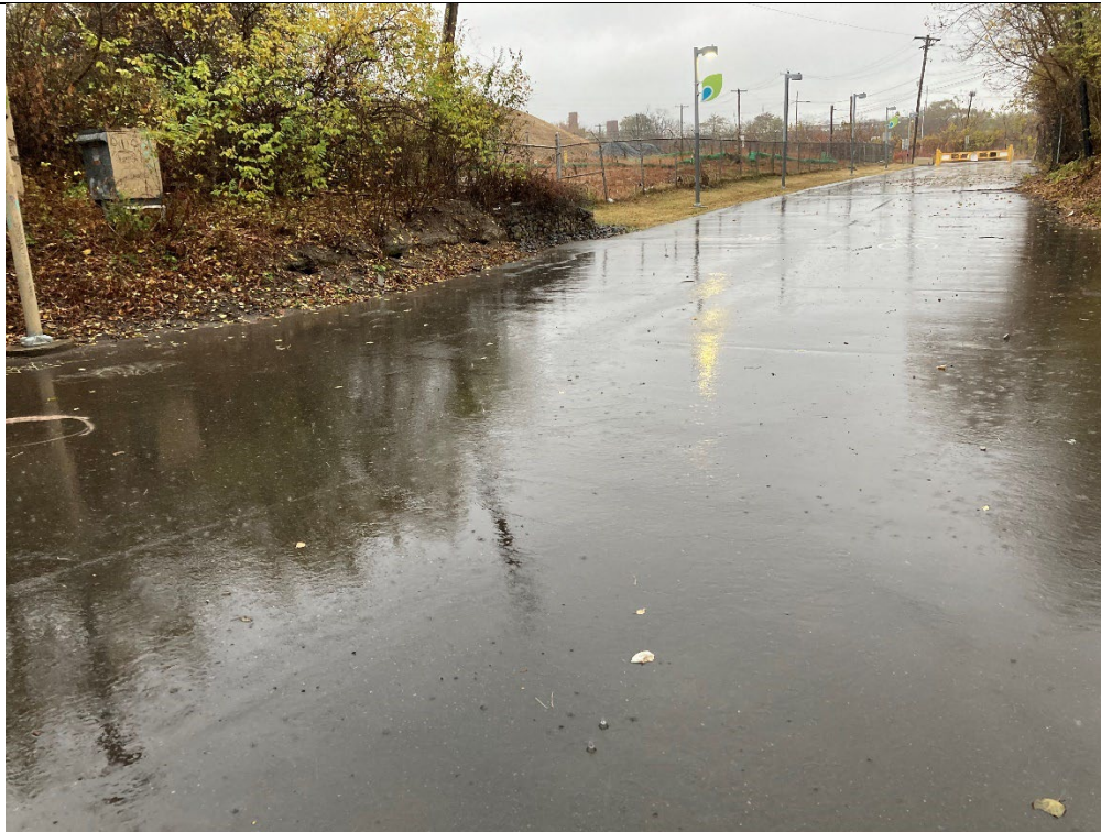
Bartram's Garden trail looking towards downslope boundary of site. Light streak seen on trail is reflection of street lamp during active rain event.