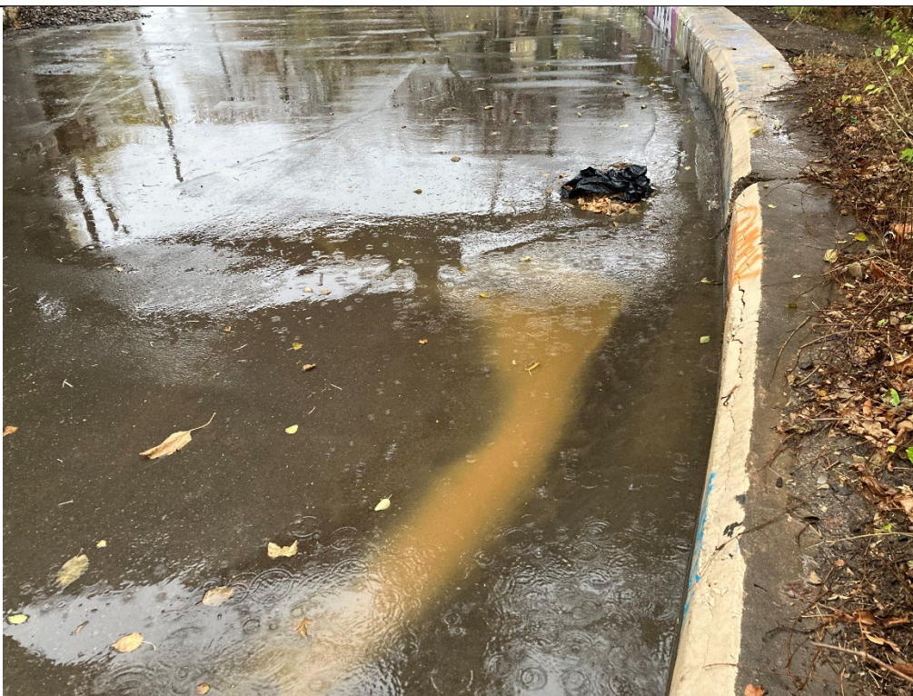
Close-up photo of sediment plume in stormwater during active rain event, on Bartram's Garden trail under railroad bridge.