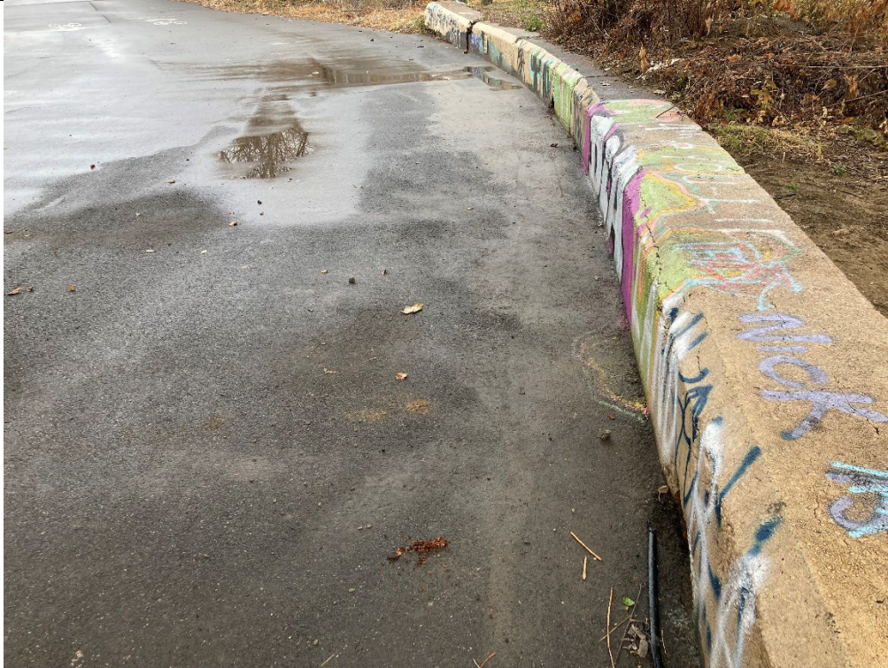
Wall along Bartram's Garden trail adjacent to Schuylkill River without storm drain protection.