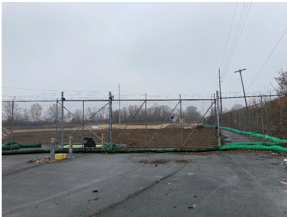
Most upslope gate, along 51 st St.