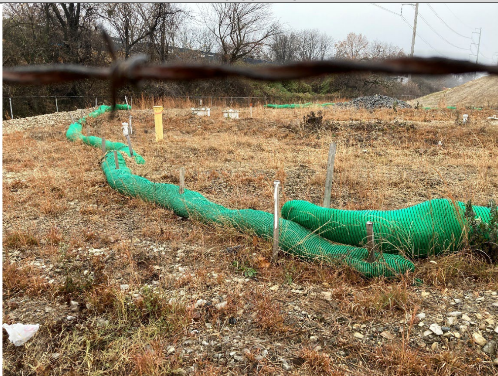
Filter sock along downslope(eastern) border of site, with some parts of filtersock nearly overtopped.