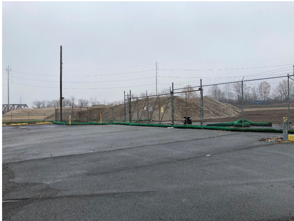
Filter sock and stone stockpile, taken from parking lot along 51 st St.