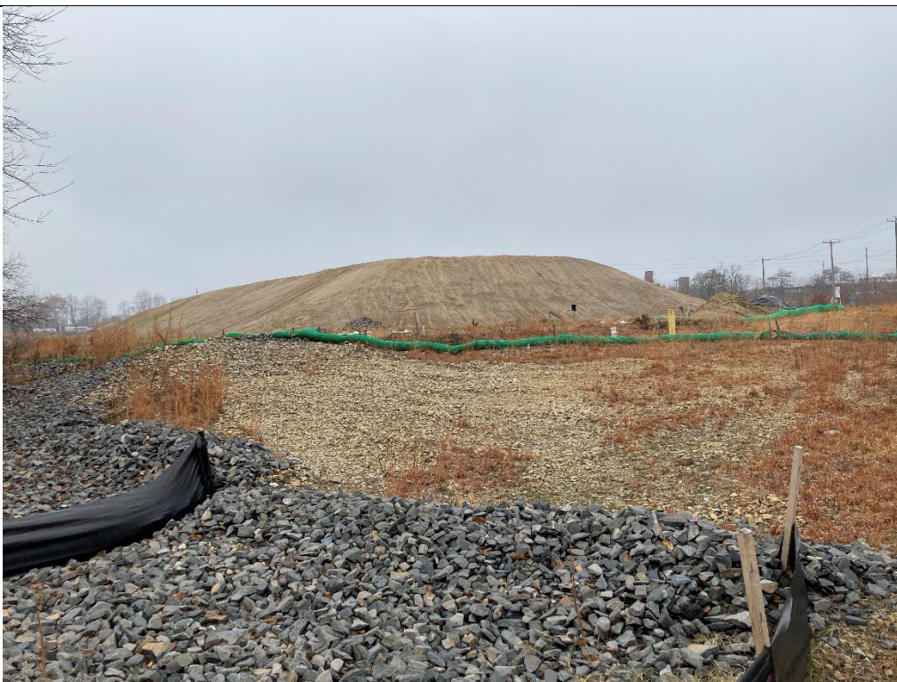
Downslope and southern side of large fill dirt stockpile.