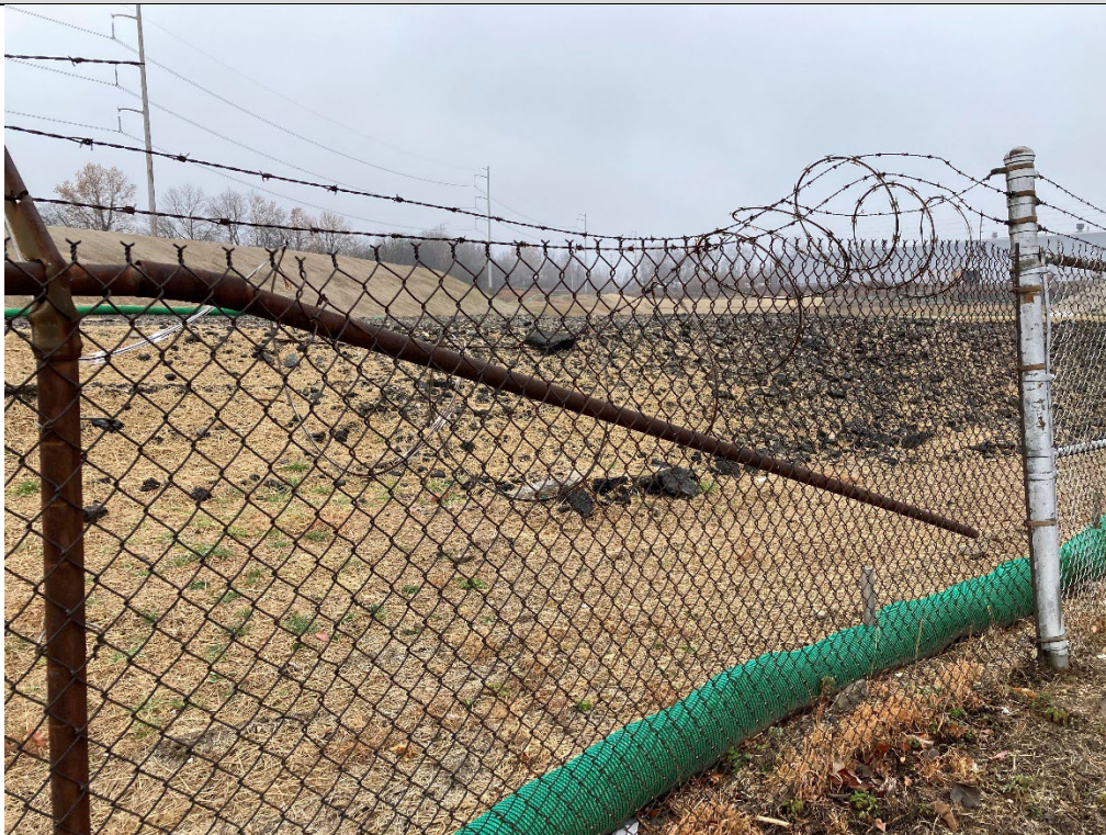
Security fence damage along 51 st St.