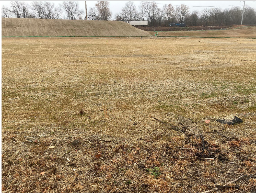
Midslope section of site with some germination.