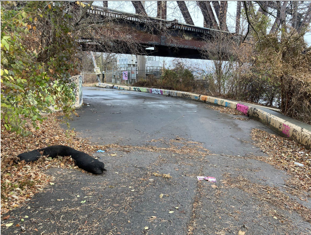
Bartram's Garden trail taken from south side of railroad bridge, with misplaced filter sock in left foreground.