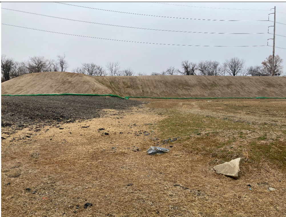
Downslope section of site with some germination. Large fill dirt stockpile in background with erosion gullying present.