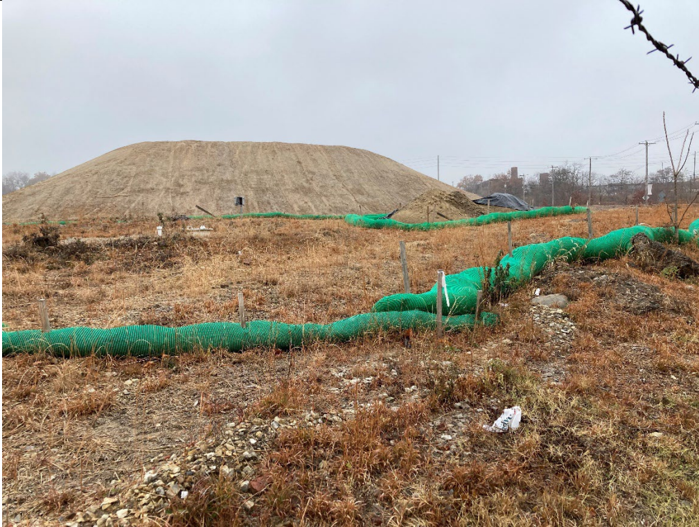
Smaller contaminated dirt stockpile with black tarp partially removed. End of photo log.