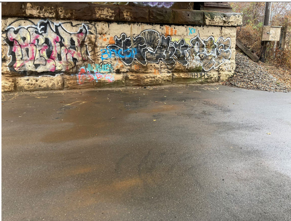
Sediment staining on Bartram's Garden trail under railroad bridge.