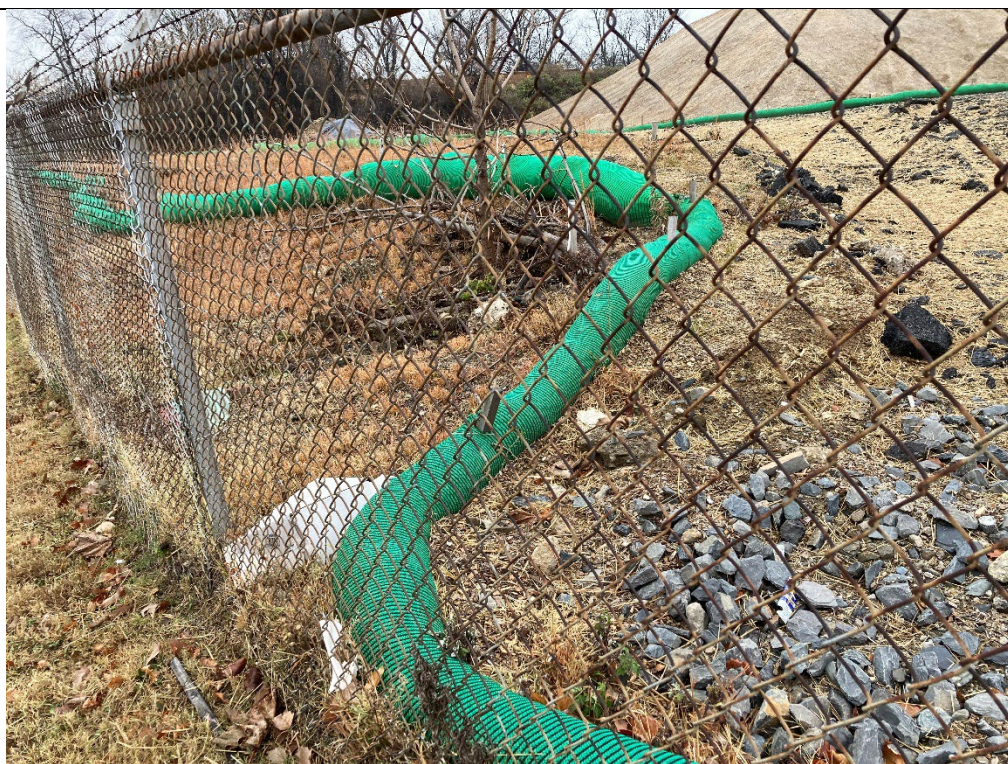
Filter sock along downslope(eastern) border of site, with some parts of filtersock nearly overtopped.