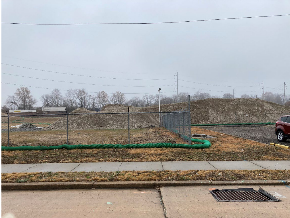
Stone stockpile, as taken from 51 st St.