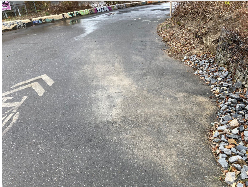
Sediment staining along Bartram's Garden trail.