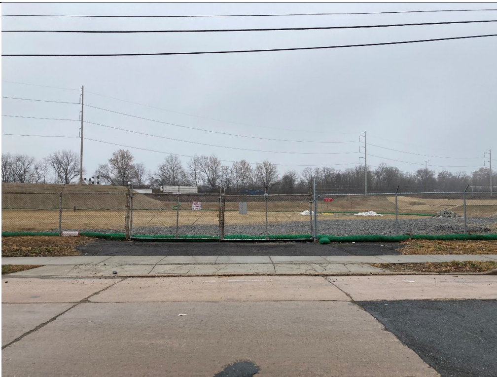
More downslope of the two gates along 51 st St.