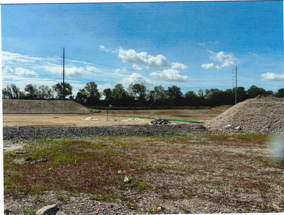
Area of midslope work with rock/concrete pile, plastic sheeting, and rebar present at center.