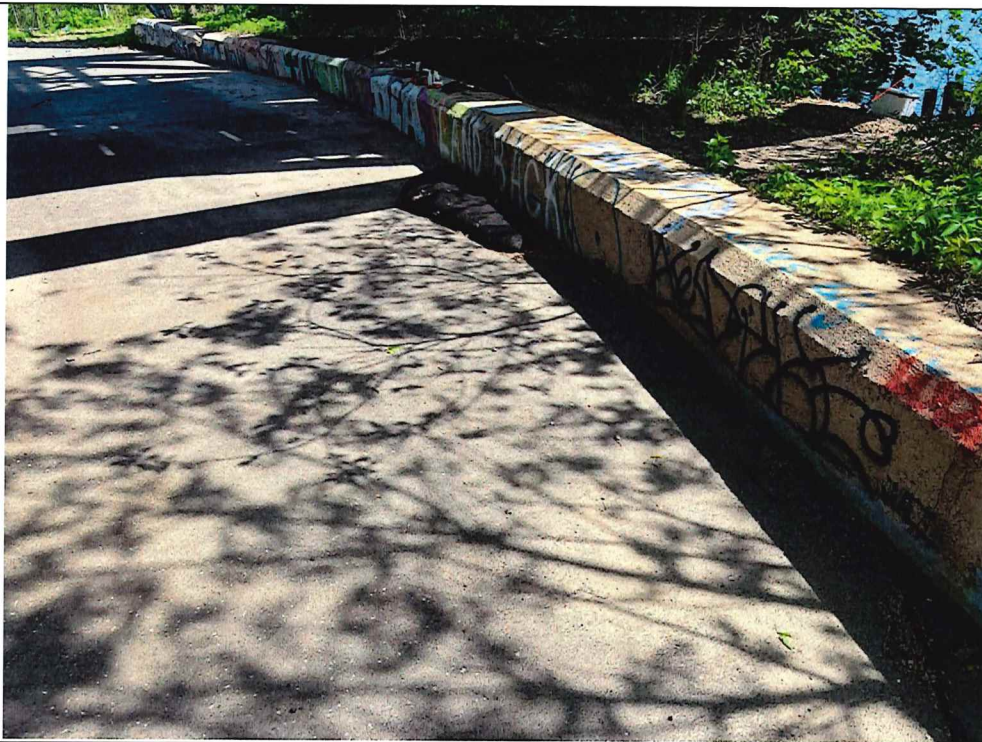
Bartram's Garden trail staining and inlet protection under railroad bridge. End of photo log.