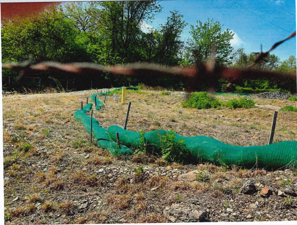
Filtersock along downslope boundary of site.