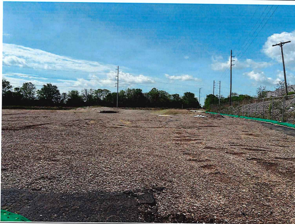
Upslope portion of site with some germination in distance.