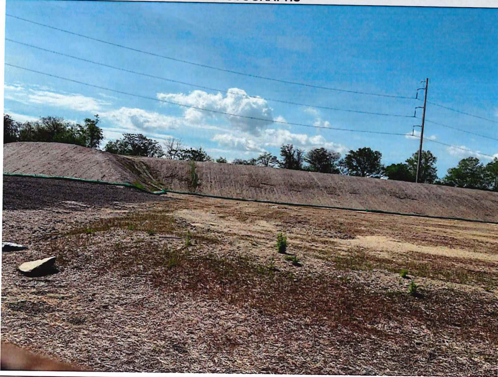
Large fill dirt stockpile in distance with some germination present.