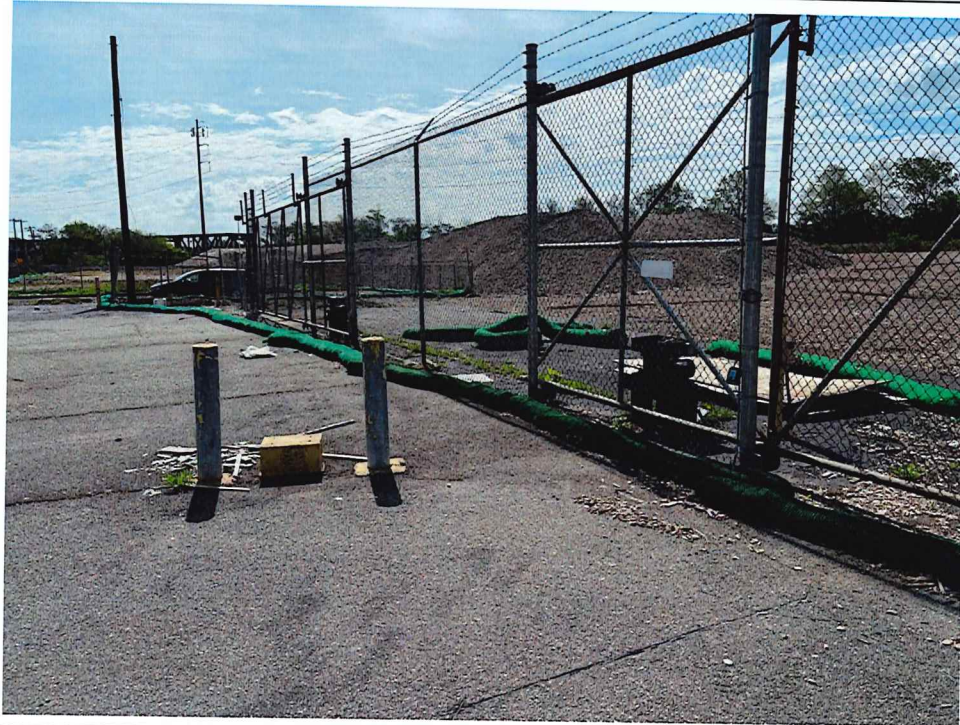
Most upslope gate and filter sock.