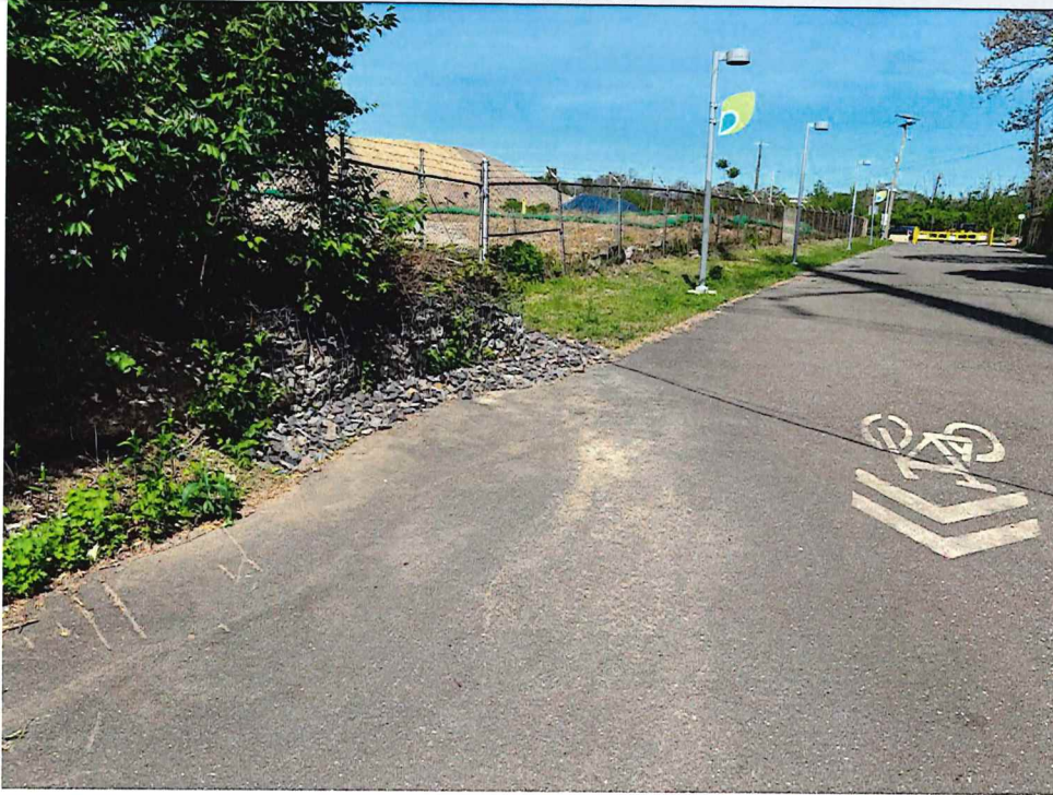
Sediment staining on Bartram's Garden trail.