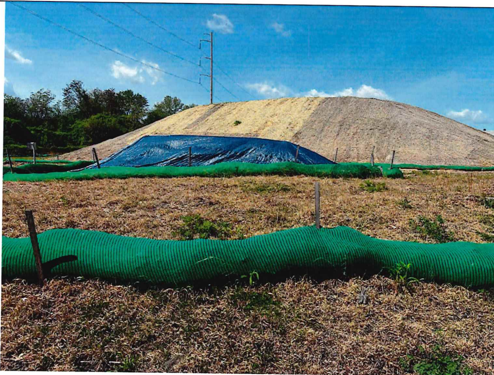
Downslope filtersock (foreground); contaminated fill dirt stockpile with tarp (at center); downslope end of large fill dirt stockpile with erosion matting (background).