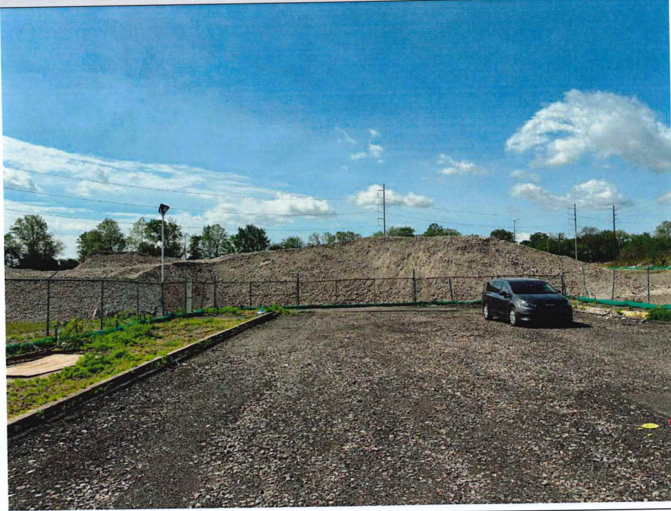
Stone stockpile and midslope filter sock.