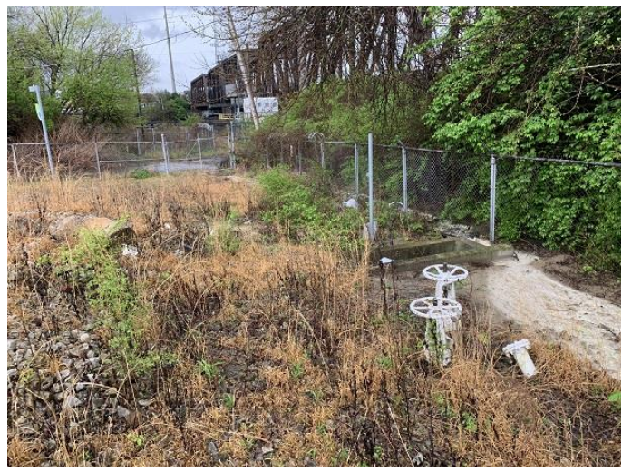
Eastern corner separator and ditch