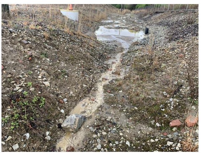
Ditch, concrete pipe discharge and valve box