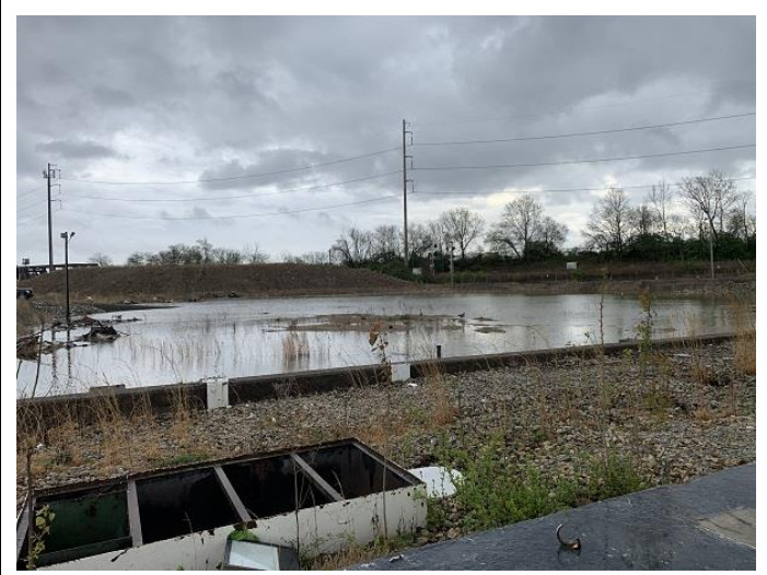
Empty tank containment looking east