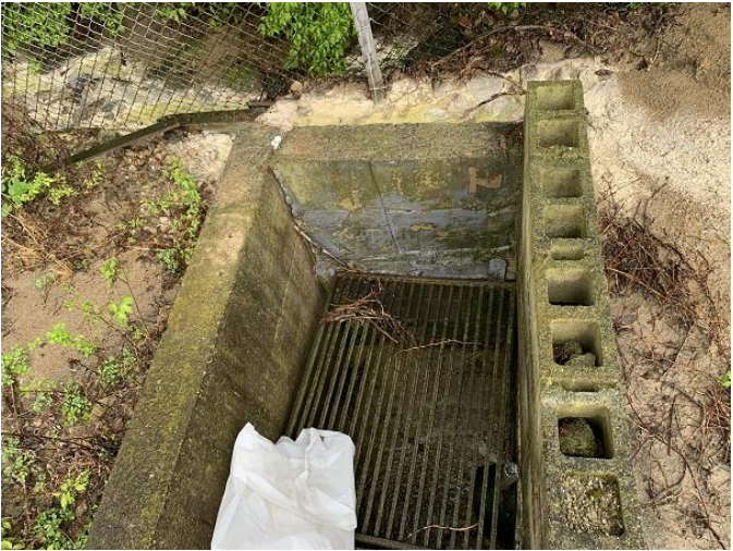
Separator and re-infiltration into the soil.