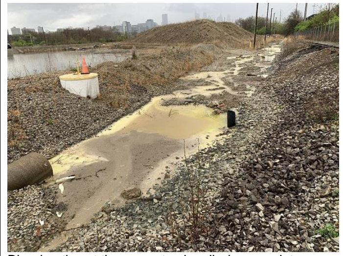
Discoloration at the concrete pipe discharge point