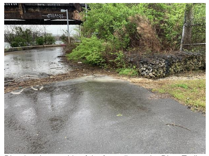
Discoloration outside of the fence line at the River Trail