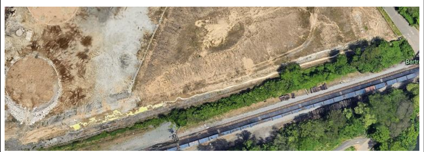
5/10/23 Google Earth view of the ditch showing discoloration

Name and Location of Facility or Pollution Incident 51<sup>st</sup> and Botanic Ave. County Philadelphia Municipality Philadelphia