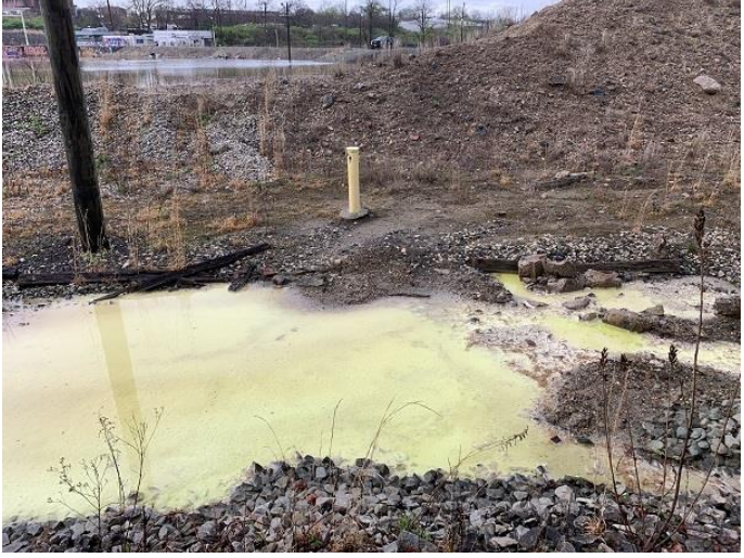
Pooled material in the ditch near MW-3