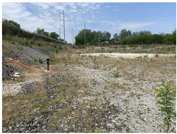
MW-9 and deposited fill in the upgradient tank containment