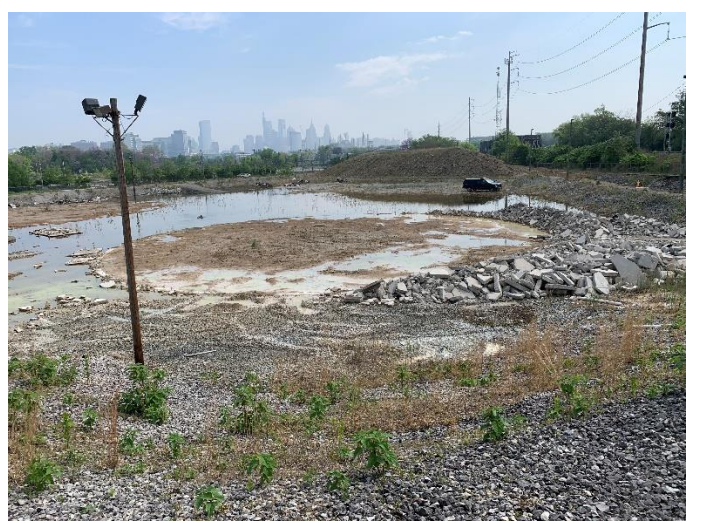
TK-7550 / TK-7551 tank containment with discoloration