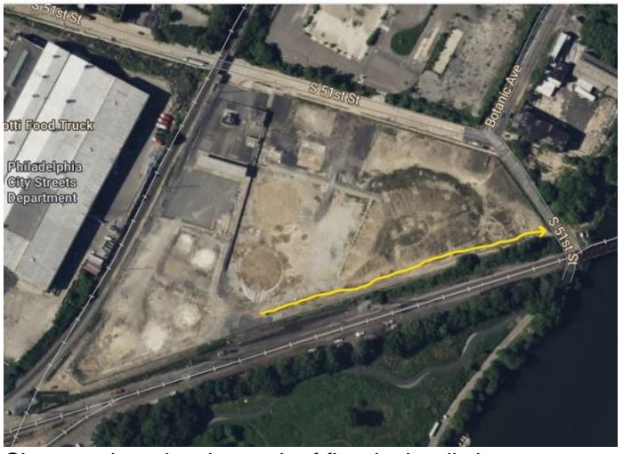
Site overview showing path of flow in the ditch