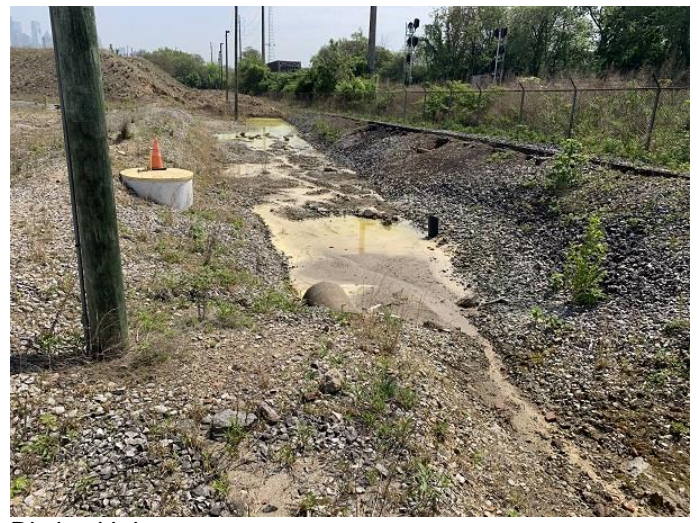
Ditch with berms at rear