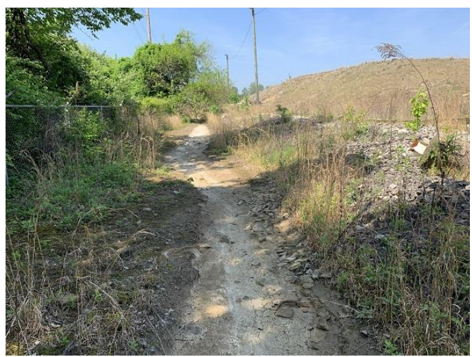
Dry ditch below the berms