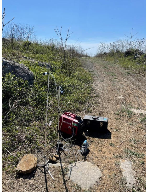
Sampling Location 7 - 4/12/23, 11:20 AM