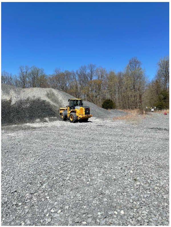
Loader getting aggregate from wetted stockpile - 4/12/23, 12:01 PM