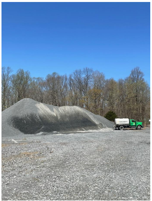
Water truck in operation (just sprayed stockpile) - 4/12/23, 11:57 AM