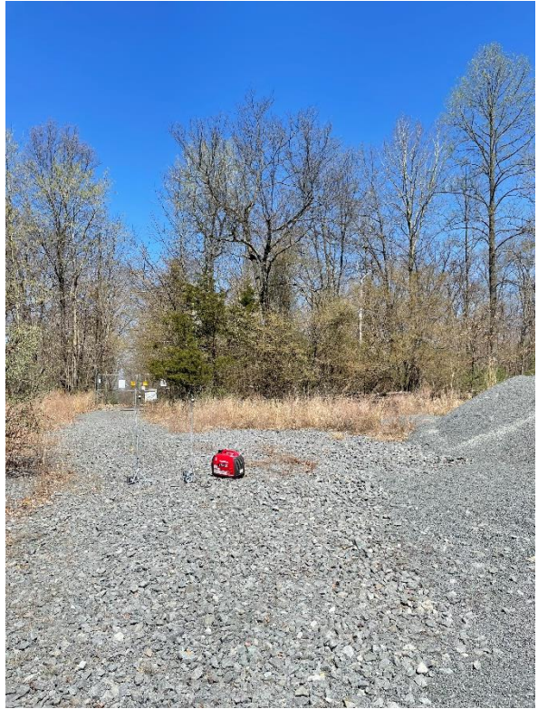
Sampling Location 2 after it was moved slightly back from stockpile (was moved so that loader could more easily access stockpile) - 4/12/23, 12:00 PM