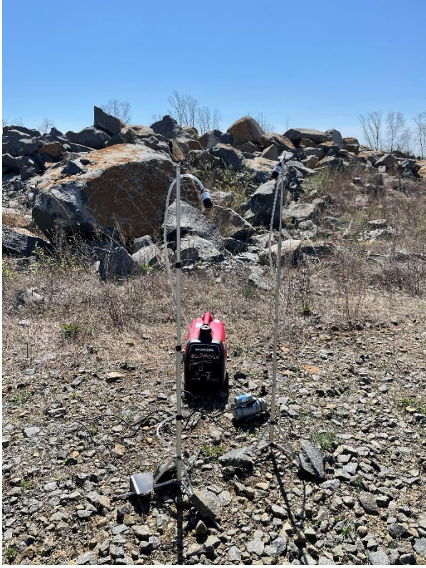
Sampling Location 6 - 4/12/23, 11:41 AM