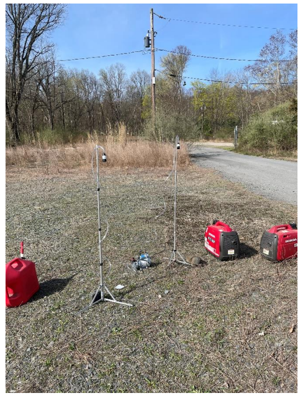
Sampling Location 3 - 4/12/23, 9:51 AM