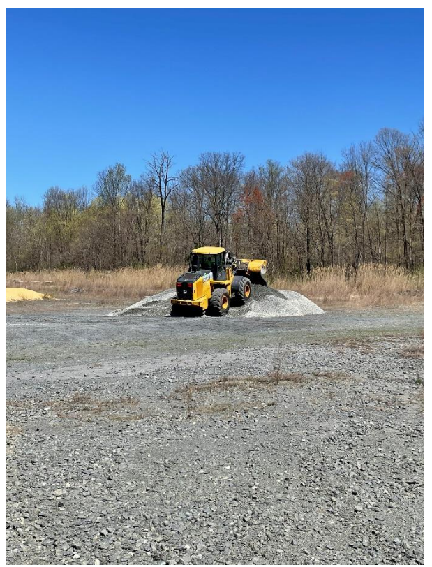
Loader dumping aggregate from wetted stockpile to new stockpile area - 4/12/23, 12:04 PM