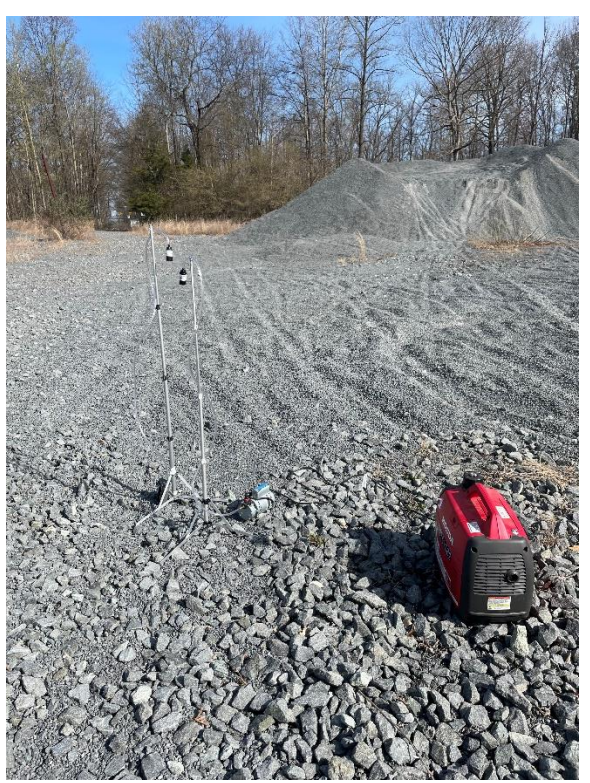
Sampling Location 2 - 4/12/23, 9:48 AM

4/12/23 Heidelberg Materials East Rockhill Quarry AQ Sampling Photos