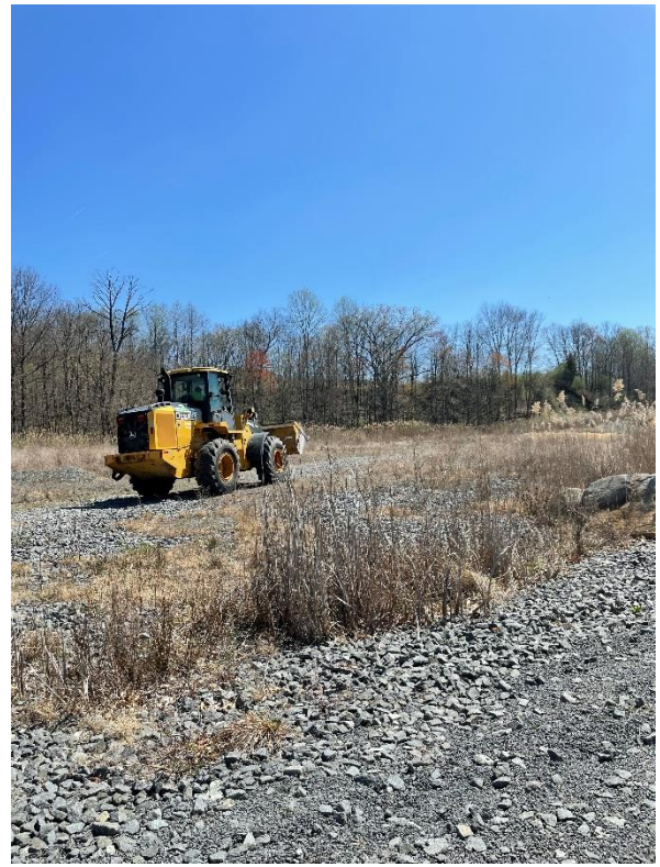
Loader moving aggregate from wetted stockpile to new stockpile area - 4/12/23, 12:01 PM