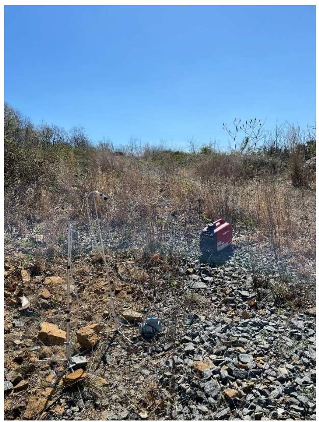
Sampling Location 8 - 4/12/23, 11:17 AM