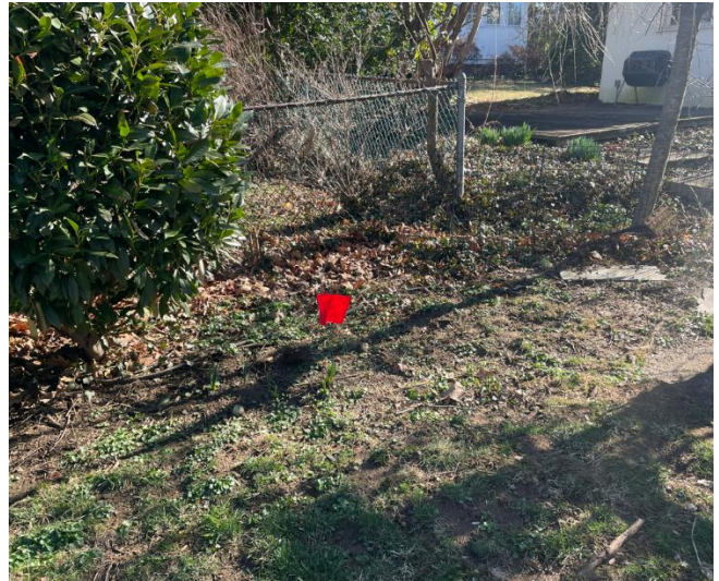
3/18/2025 Residential Property C/D Location