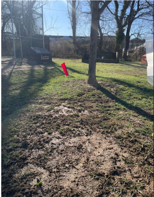
3/18/2025 Hallowell Park Sample ID A/B Location

Facility Name: SPS Technologies Fire Investigation Primary Facility ID: n/a