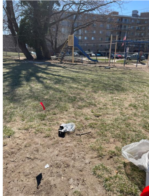
3/18/2025 Jenkintown Schools Sample ID K/L