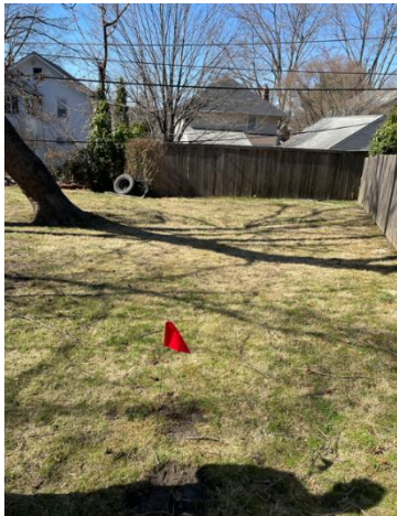
3/18/2025 Residential Property Sample ID M/N