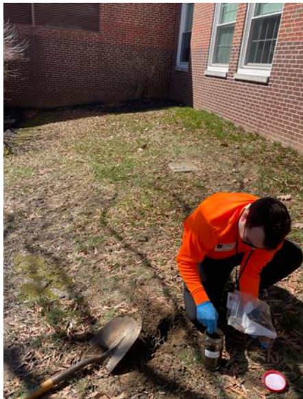
3/18/2025 Jenkintown Schools Sample ID I/J

Facility Name: SPS Technologies Fire Investigation Primary Facility ID: n/a