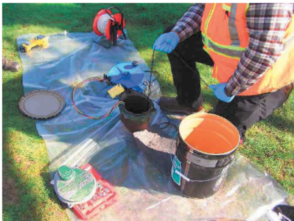
Bailing potable well at [REDACTED] 4-21-25 @ 9:37