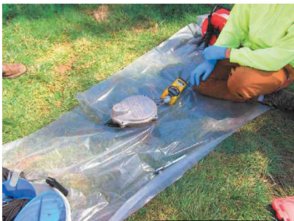
Screening wellhead at [REDACTED] 4-21-25 @ 10:44