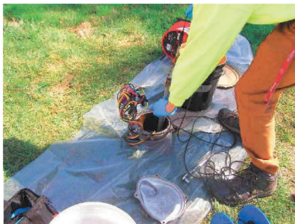
Bailing potable well at [REDACTED] 4-21-25 @ 10:48