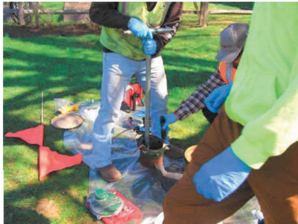
Recovering bailer from [REDACTED] 4-21-25 @ 10:11