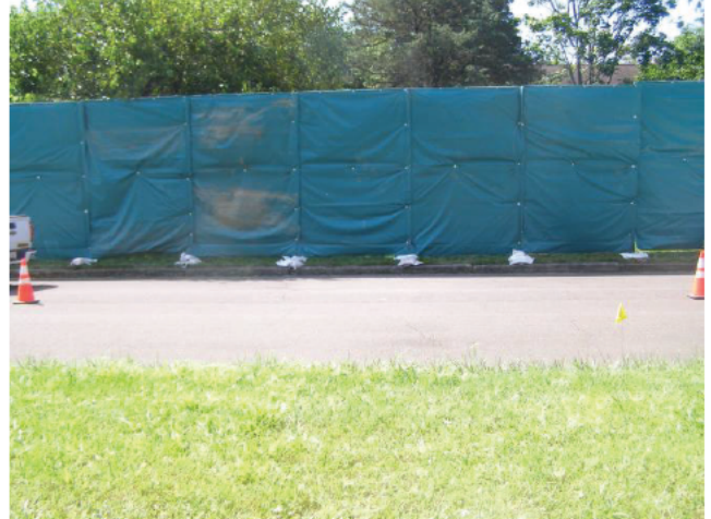
Sound Barriers in front of [REDACTED] 7-21-25 @ 10:46