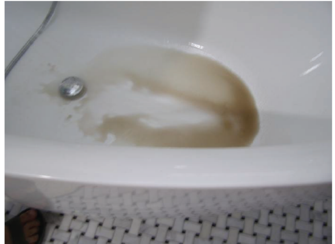
Black water from cold faucet, 2 nd floor bathroom on [REDACTED] 7-21-25 @ 13:35