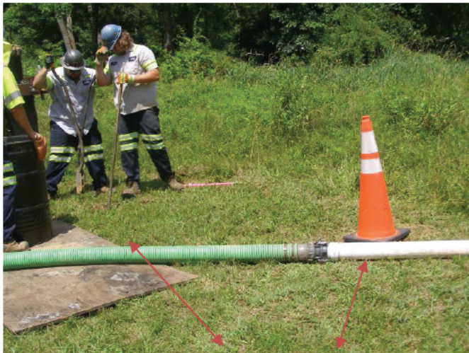
Locations of Monitoring wells MW-1S and MW-1D on Glenwood Drive 7-21-25 @ 12:04