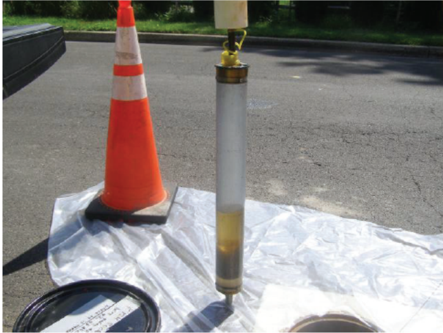
LNAPL in skimmer pulled from recovery well RW-2 7-21-25 @ 10:34