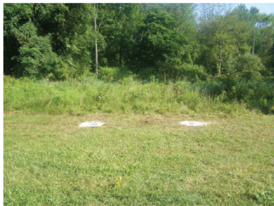
Installed well pads at monitoring wells MW-5S and MW-5D in SPLP right of way on Glenwood Drive 7-28-25 @ 9:18