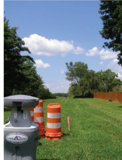
Well locations on Upper Makefield Township property behind [REDACTED]