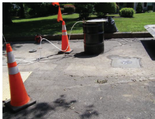
Completed well pads for monitoring wells MW-4S and MW-4D 7-28-25 @ 10:05