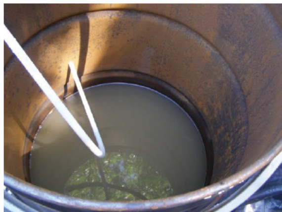
Well development water from monitoring well MW-4D 7-28-25 @ 10:05