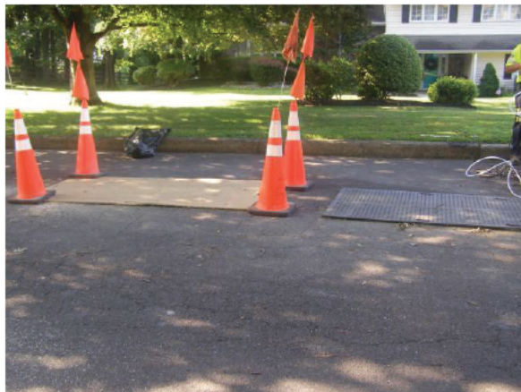
Covers on recently drilled monitoring wells MW-4S and MW-4D on Glenwood Drive in the right of way 7-28-25 @ 9:21