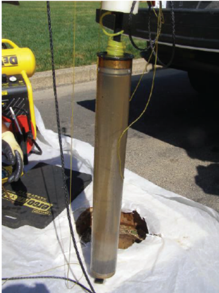
Pulled skimmer from recovery well RW-2 will LNAPL 7-28-25 @ 10:23