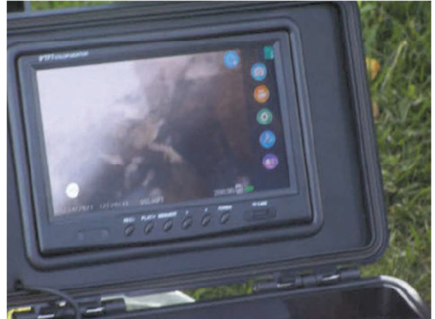
Downhole camera in potable well at [REDACTED] 6-23-25 @ 9:43am