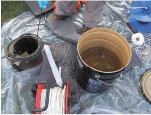
LNAPL in bailed water from well at [REDACTED] 6-23-25 @ 9:17am