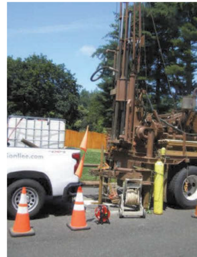
Packer testing set up at recovery well RW-2 6-23-25 @ 11:31