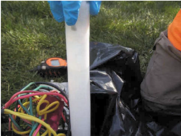
Small sheen of LNAPL in potable well at [REDACTED] 6-23-25 @ 10:14am