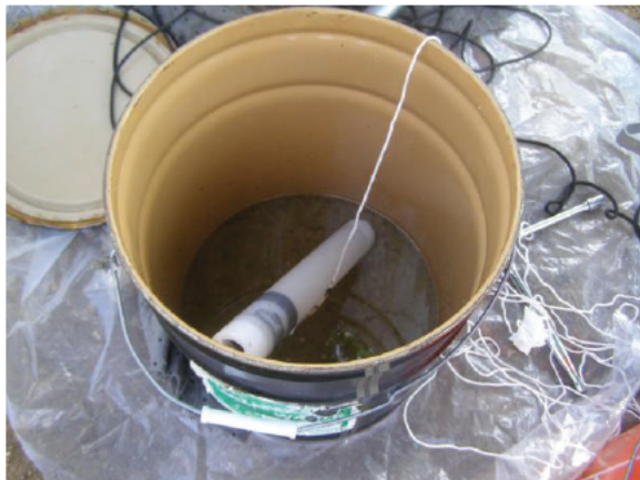
LNAPL in bailed water from well at [REDACTED] 6-30-25