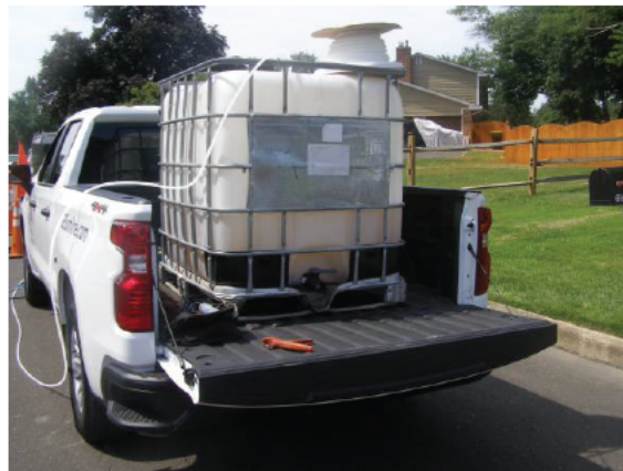
Tote where water from recovery wells was pumped prior to using UV light 6-30-25