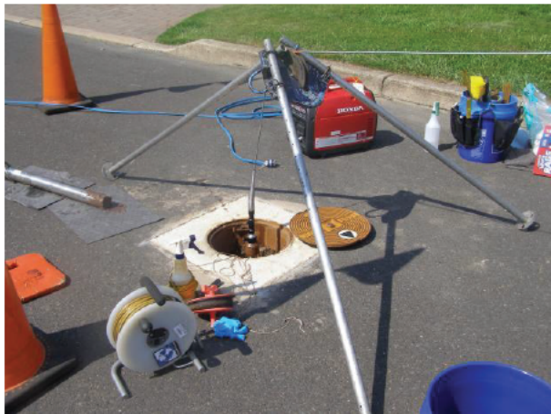
Probe with UV light being lowered into Recovery Well RW-4 on Glenwood Drive 6-30-25