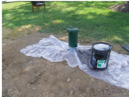
New potable well riser at [REDACTED] 6-30-25