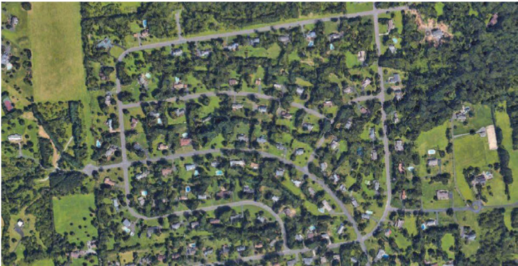
Map 1: Google Maps location of Washington Crossing neighborhood