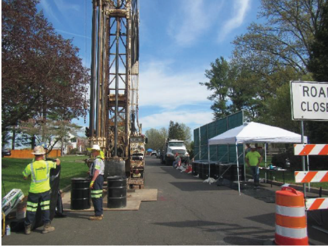
Drill rig setup on Well C.