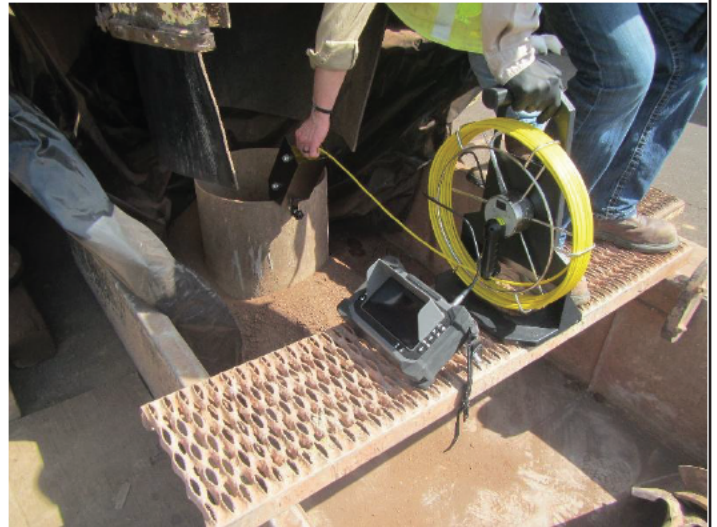
Borehole camera inspection completed by ET.