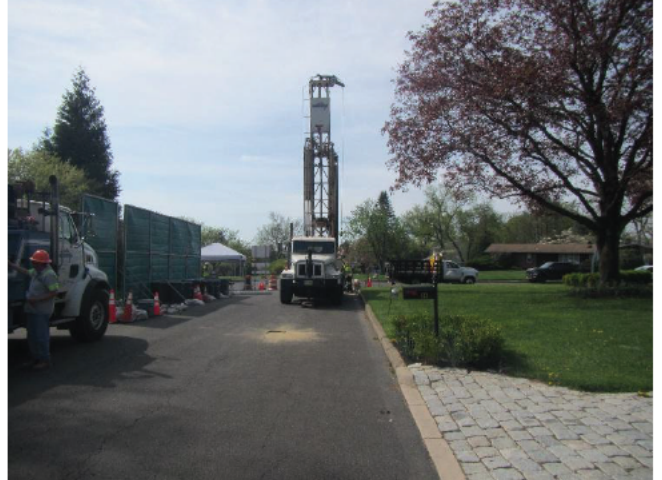
Drill rig setup on Well C looking toward Walker Road.