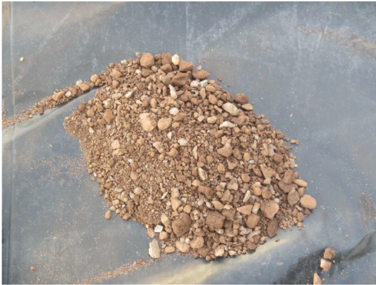
Rock chips brought up from around 5ft below ground surface.