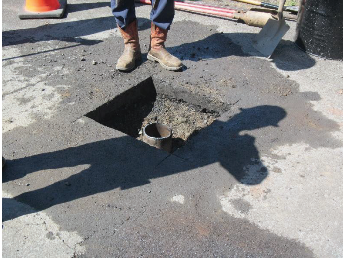
Well C location after casing is cut.