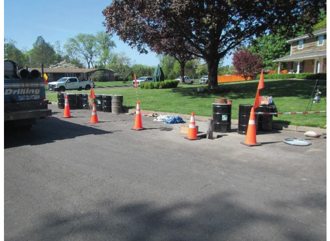
Drums stored on Glenwood Drive between Well B and Well C.