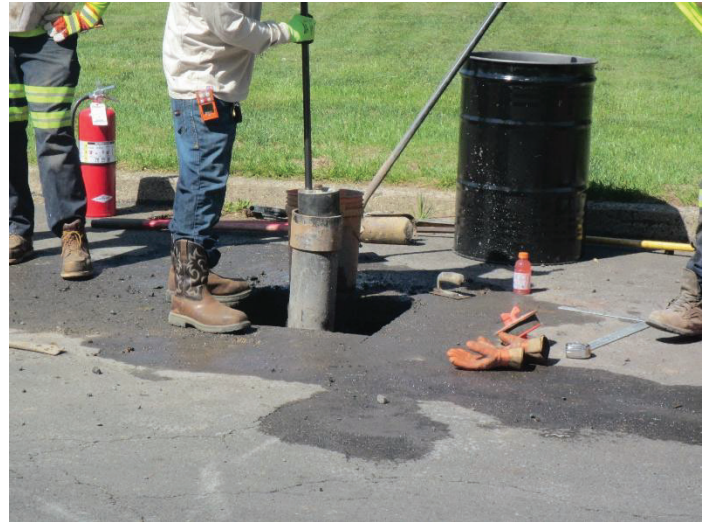
Bladder used to seal Well C casing prior to cutting.