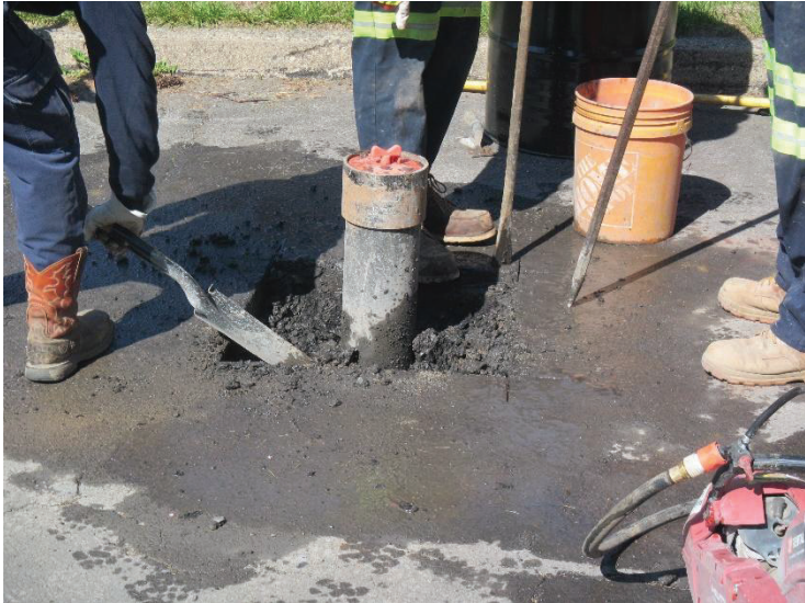
Clearing asphalt from Well C location in preparation for cutting the casing.