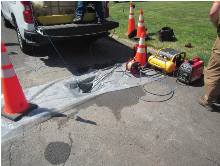
Pumping setup at Well C.