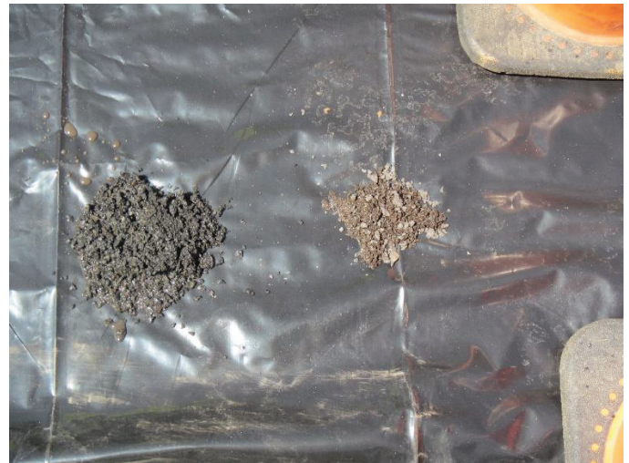
Rock chips from 45 to 50 feet below grade collected during drilling.