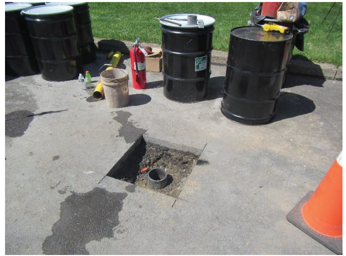
Well B location after casing is cut.