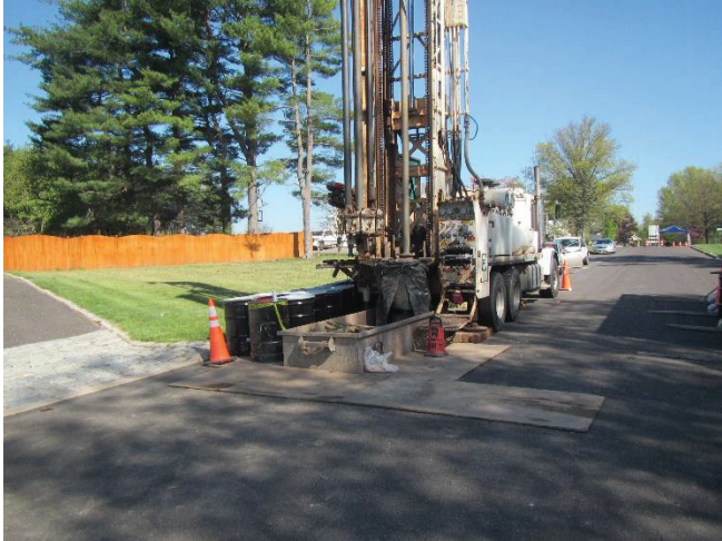
Drill rig set up on MW-18DD to continue drilling.