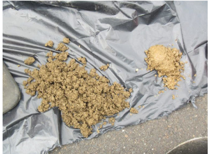
Rock chips from 5 feet (left) and 10 feet (right) collected while drilling MW-17DD.