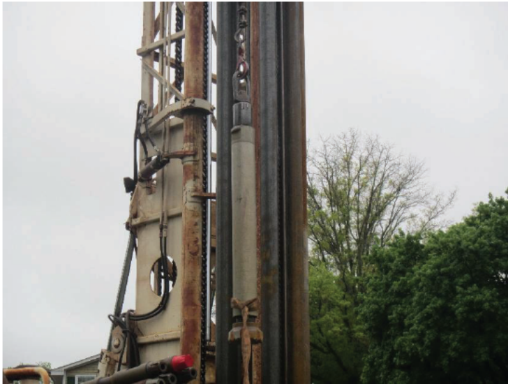
Drill head being connected to the drill rig.