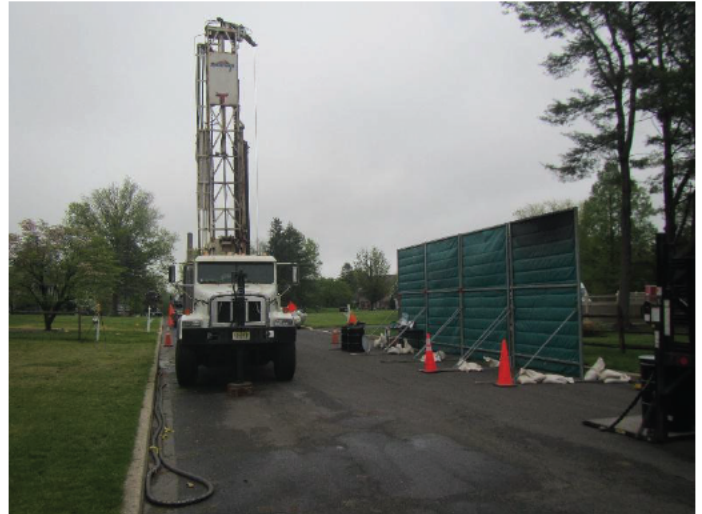
Drill rig set up on MW-17DD.