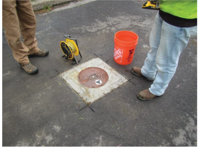
Completed flush mounted Well B.