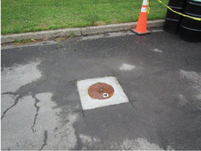
Completed flush mounted Well C.