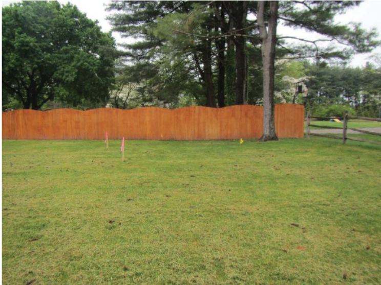
Proposed Well A and MW-16DD locations.