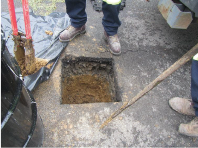
Hand clearing of MW-17DD prior to drilling.