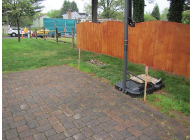
Proposed MW-15S and MW-15D well locations.